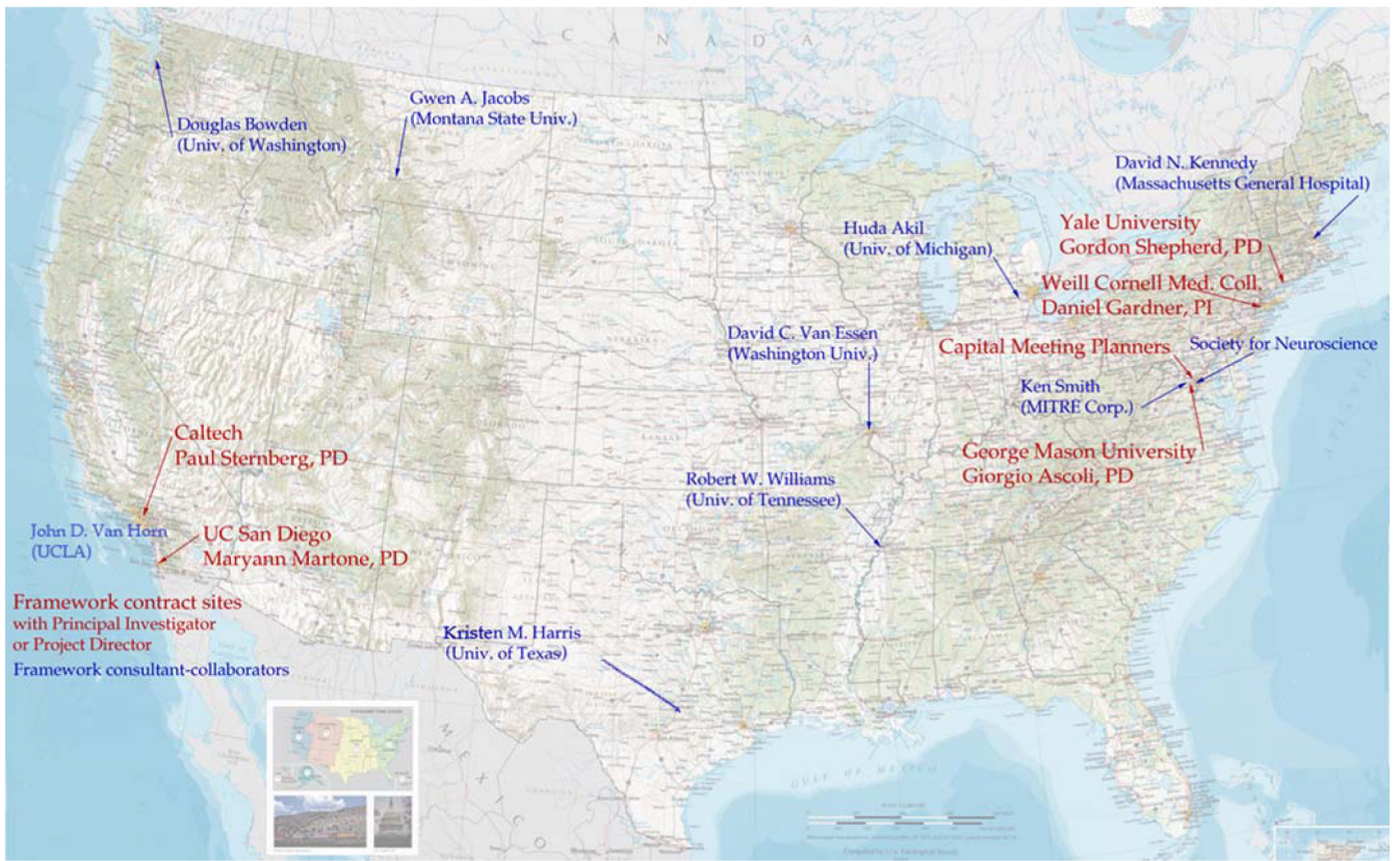
Fig. 1. Framework contributors include both contract sites and volunteer consultant-collaborators. An Appendix lists contributors in greater detail