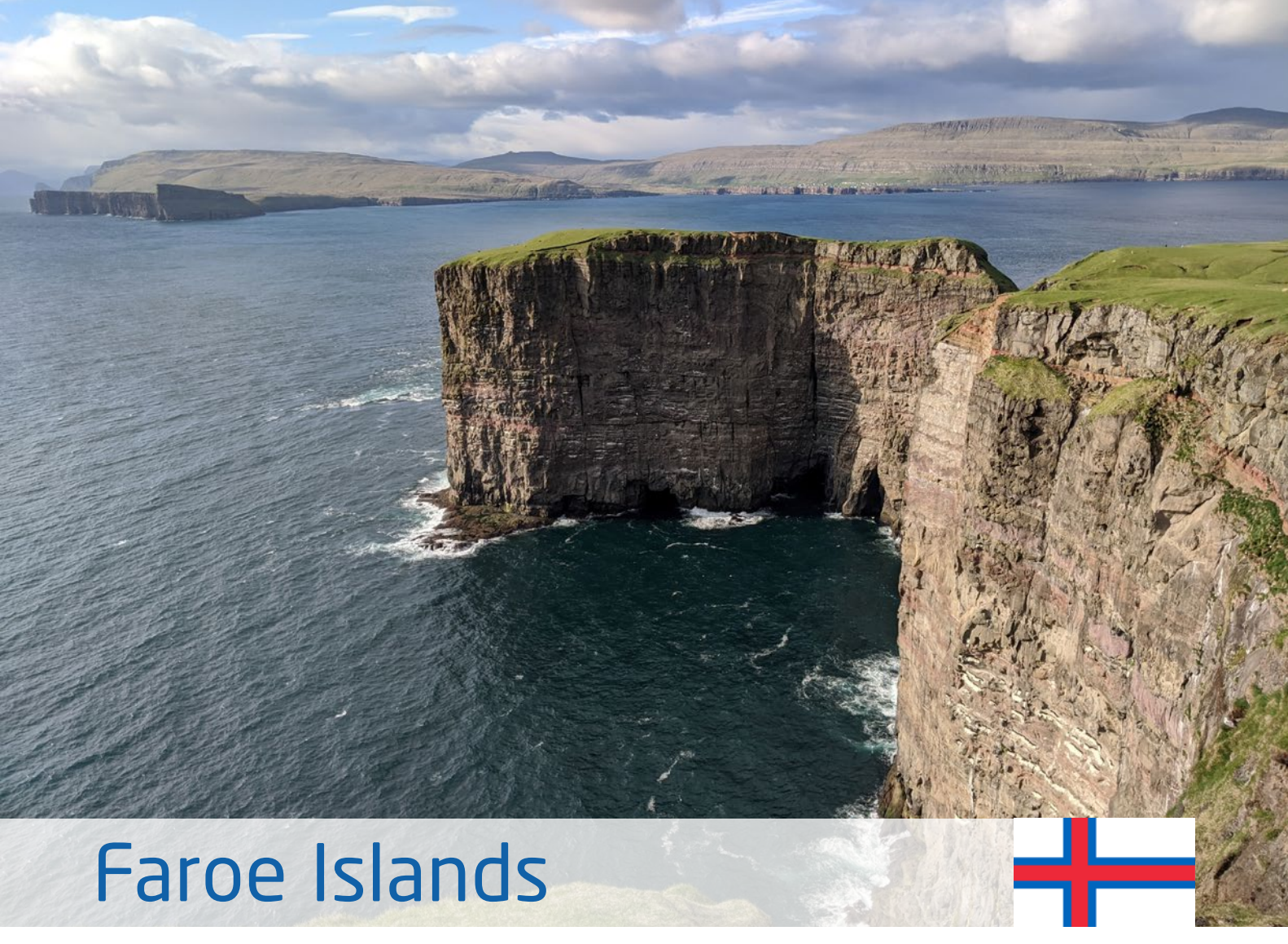
Two Islands called Skúvoy and Sandoy.

Part of the research funded by the <u>Ministry of Foreign Affairs</u> and <u>Culture</u> is conducted in the university of the Faroe Islands, while a greater part is carried out in other governmental research institutions.