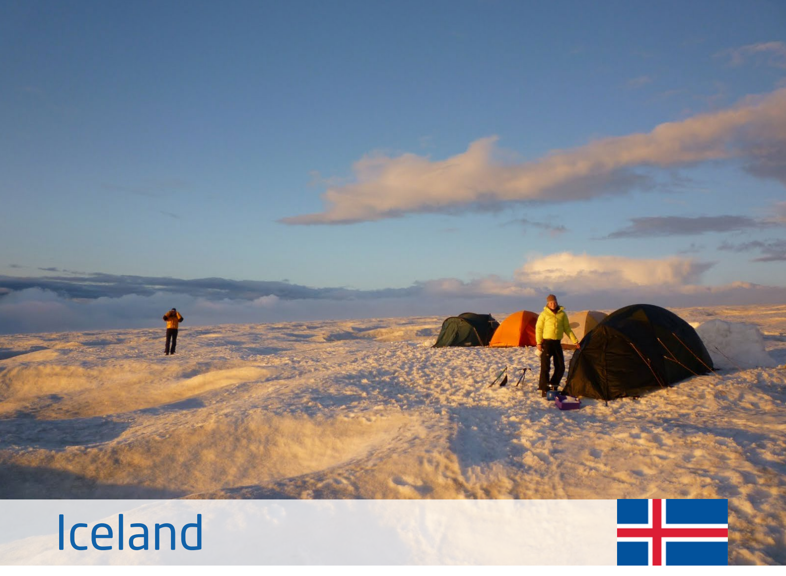
Fieldwork Langjokull 2011.

The Icelandic government provides national competitive funds that support Icelandic research on a wide variety of research topics.