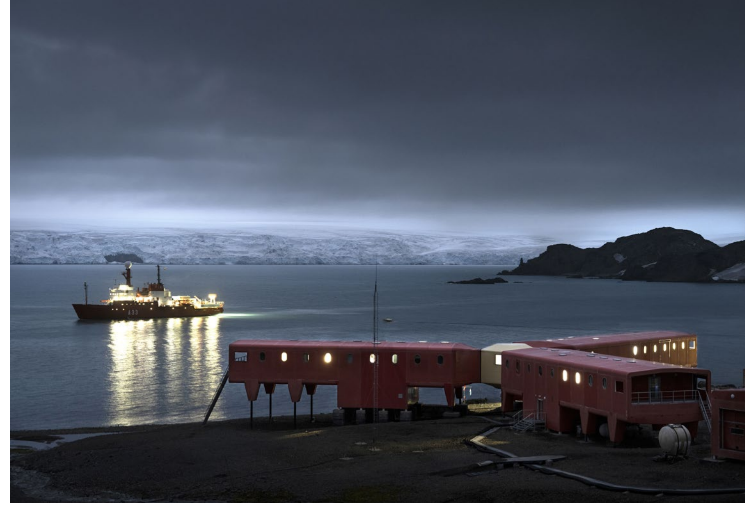
RV Hesperides and Juan Carlos I station.