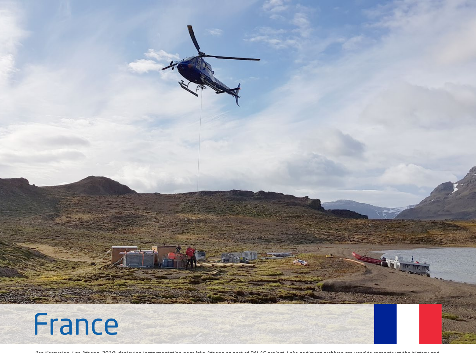
lles Kerguelen, Lac Athena, 2019: deploying instrumentation near lake Athena as part of PALAS project. Lake sediment archives are used to reconstruct the history and ecological impact of rabbit invasion since their introduction on the island in 1874.

The French National Scientific Research Centre (CNRS) provides long-term support to joint international research initiatives such as International Research Laboratories focusing on Arctic research, observatories in the Arctic regions, international networks involving several Siberian universities, polar infrastructures (e.g. SAFIRE, PolarPod) and support to IPEV personnel. Project funding is also provided through research programmes managed by the different CNRS institutes. Through its direct employment, CNRS supports most of the polar research personnel in France.