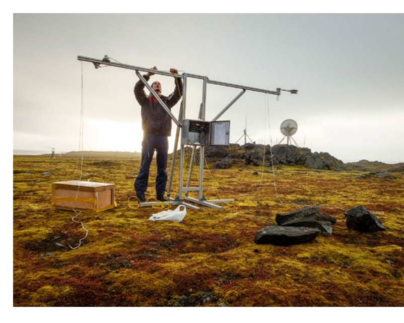
Installation of solarphotometer by Estonian scientist at Polish station Hornsund on Svalbard.

In the EU projects DAMOCLES and within the international MO-SAiC expedition, Estonia cooperated with the AWI (Germany), the Finnish Meteorological Institute (Finland), Bern University (Switzerland), Heidelberg University (Germany), Hefei University of Technology (China) and with Argonne National Lab (USA).