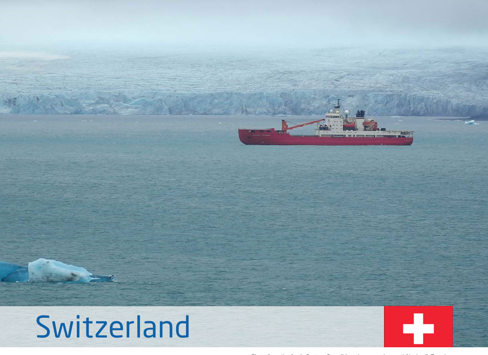
Photo from the Arctic Century Expedition, the research vessel Akademik Tryoshnikov at Inostatseva Bay.

The State Secretariat for Education, Research and Innovation (SERI) has the lead when it comes to supporting research organisations, setting research policy priorities, and bilateral/multilateral relations for research. The responsibility for the polar research field lies with the Division for International collaboration, which is also responsible for bilateral research collaborations and agreements. Another Division at SERI is responsible for the Swiss participation in EU research programmes.