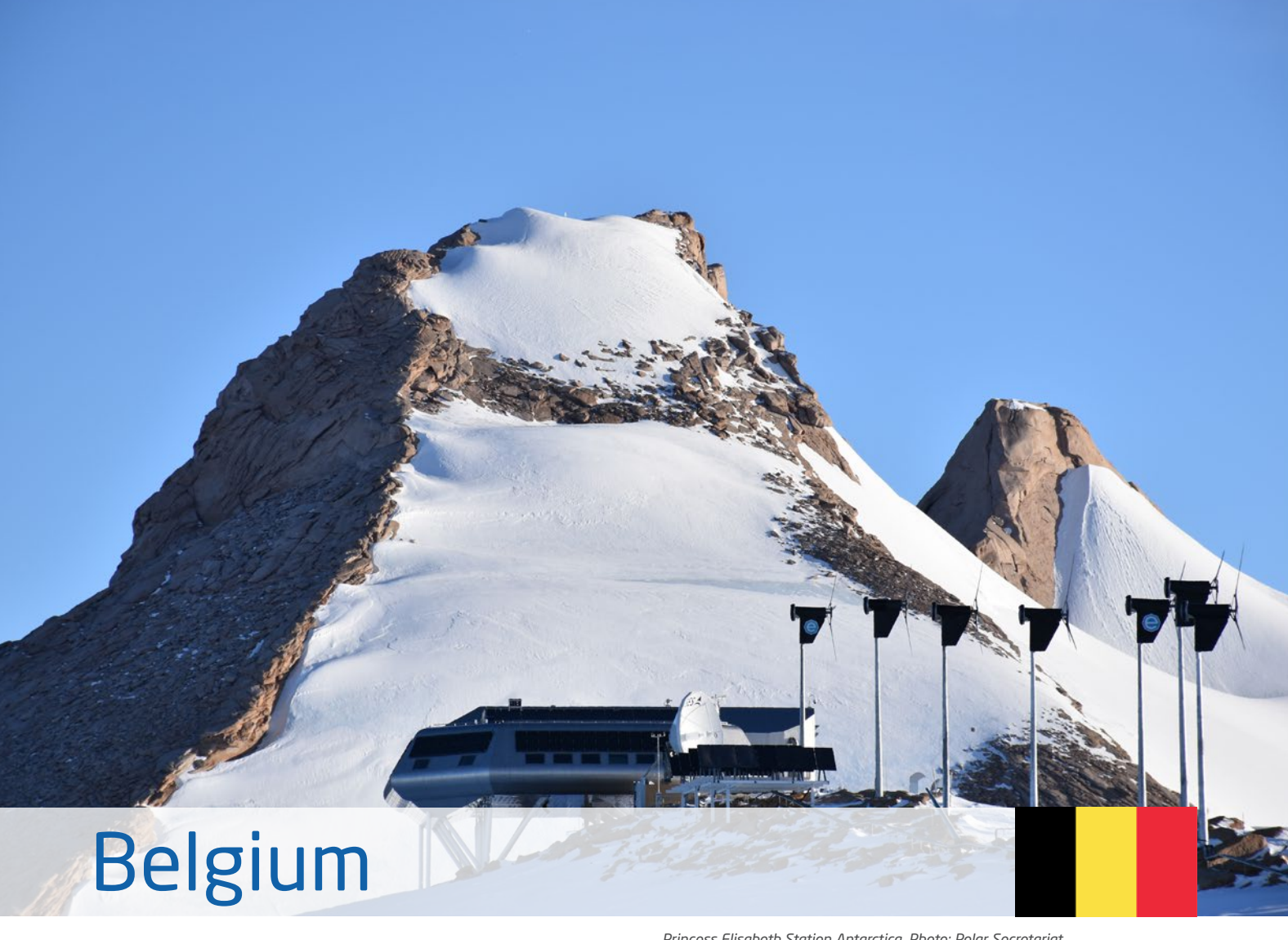
Princess Elisabeth Station Antarctica.

The Belgian Federal Science Policy (BELSPO) depends on the Ministry of Science Policy. Its mission is to optimise and strengthen the working of the Belgian, European and international research area by coordinating the research efforts of all public authorities in the country and inserting Belgian researchers in international research networks. BELSPO prepares and manages a portfolio of funding actions including various research programmes, research infrastructures and science-policy interfaces, and participates in national and international cooperation initiatives, inter alia related to the Arctic and the Antarctic. Thanks to its research programmes, its federal scientific institutes and with 2300 employees, BELSPO brings together a wide range of expertise in various research fields. BELSPO is involved in various European research initiatives (ERA-NET, JPI, ESFRI etc.). BEL-SPO is responsible for the follow-up of the bilateral agreements for economic, industrial, scientific and technological cooperation with a number of countries. BELSPO also manages the Belgian contribution to the European Space Agency. Contact