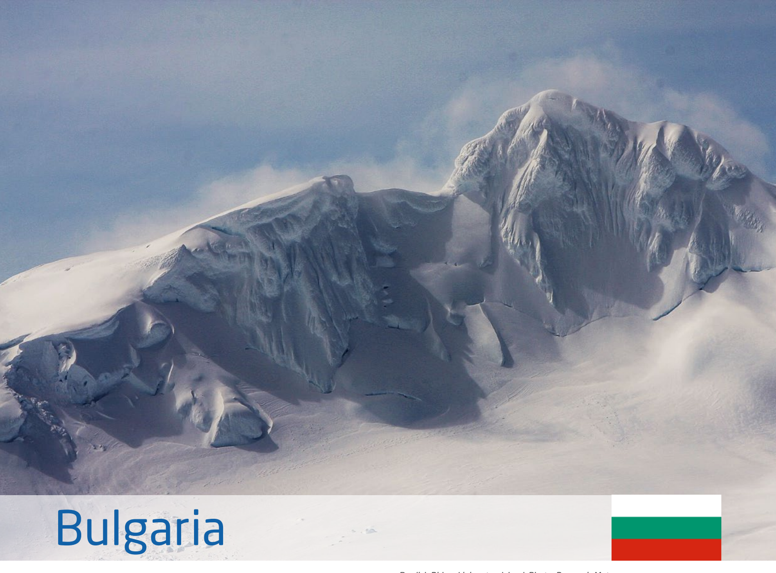
Burdick Ridge, Livingston Island.

The Ministry of Education and Science (MES) funds both the national polar infrastructure on Antarctica (through the National Roadmap for scientific infrastructure programme) and the National Programme for Polar Research. In addition, The Bulgarian National Science Fund (BNSF), which is part of MES, funds scientific projects, (some of them in the polar regions) on a general competitive base.