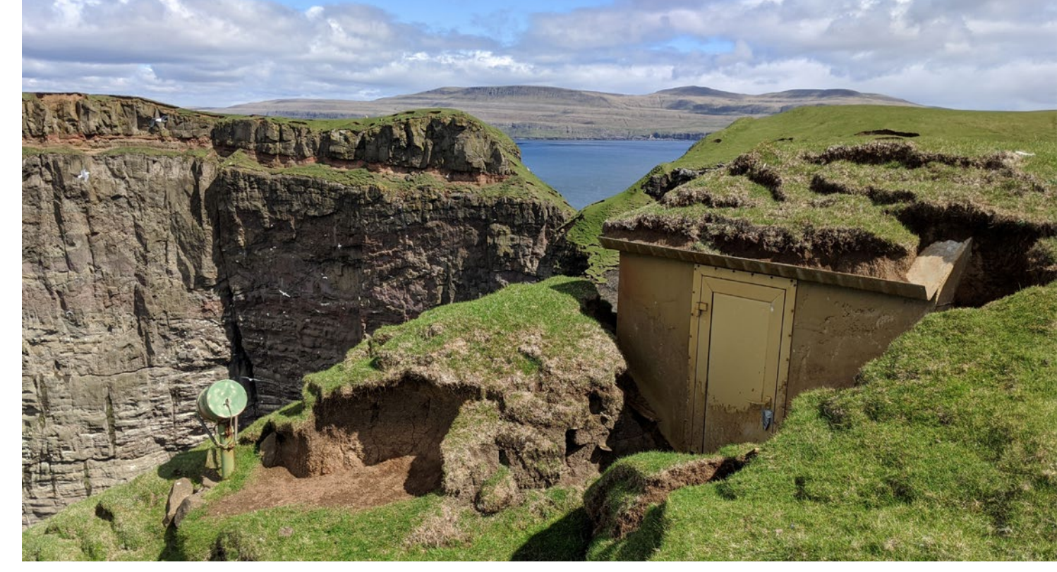
Two Islands called Skúvoy and Nólsoy.

The latest national research strategy and action plan under the headline "Knowledge & Growth" covered the period 2011-2015.