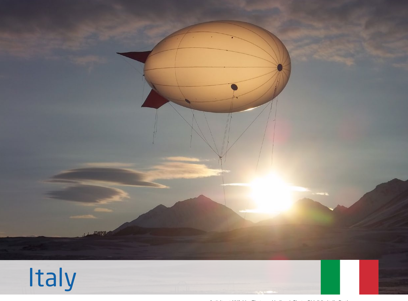
Activity at NYA (the Theteread balloon).

Italian polar research activities are mainly supported by dedicated programmes such as the <u>National Antarctic Programme</u> (since 1985) (PNRA) and the <u>National Arctic Programme</u> (since 2018) (PRA), both funded by the Research Ministry (MUR).