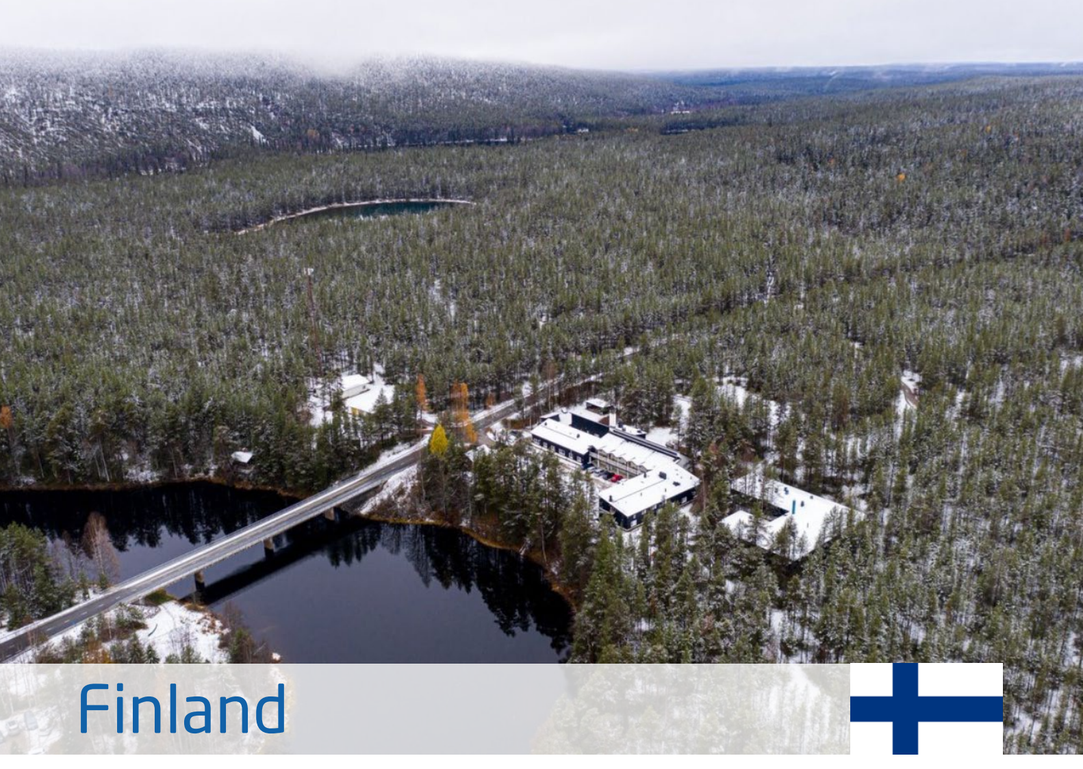
Oulanka Research Station.

Arctic research in Finland is not administrated by a specific secretariat or a programme and is therefore not labelled as such and no specific records are available. A recent survey (2019, Prime Minister's office) concluded that it is impossible to either estimate or give a full picture of Arctic research public funding in Finland as it so scattered and comes from many sources incl. the business and industry sector. As an example, the survey lists the largest competing funders of Arctic research in Finland (in order from largest to smallest): EU, Academy of Finland, Ministries, Nordic funding sources, national private foundations, European Space Agency, and Business Finland (R&D, innovations).