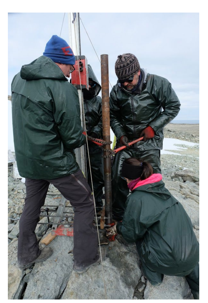
Antarctic Activities Portugal.

Portugal contributes to the international logistics in Antarctica with an annual freighted flight operating from Chile but has no stations in the polar regions. Hence, international cooperation is essential for national field activities, especially in Antarctica. Since the start of the Portuguese Polar Programme, Spain has been the main cooperation partner, supporting the transport of personnel and equipment, as well as the accommodation of scientists in the Spanish Antarctic stations. This collaboration is framed by a bilateral scientific agreement signed in 2009.