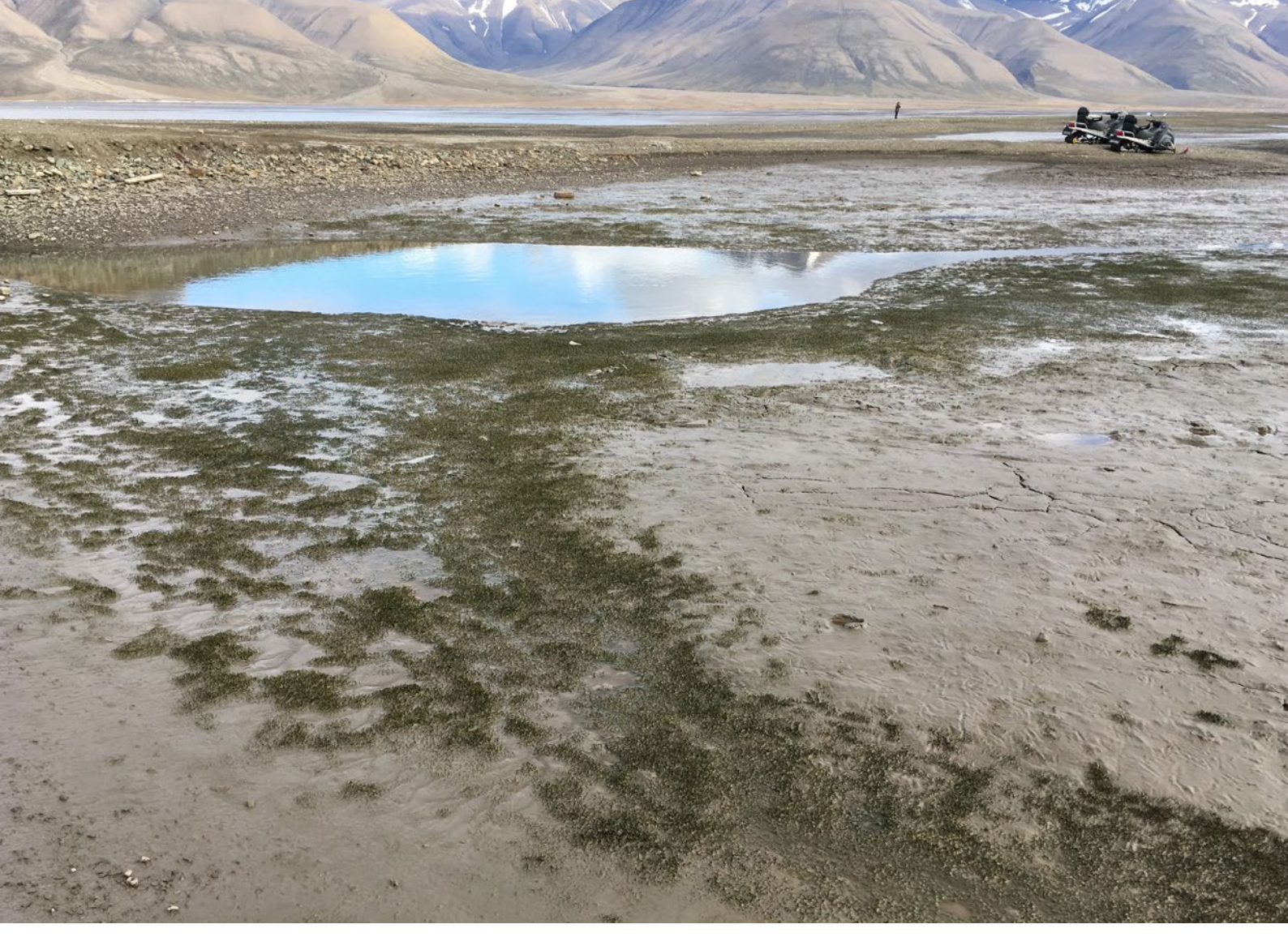
Adventfjord, experimental site - tide flat with invasive algae Vaucheria compacta