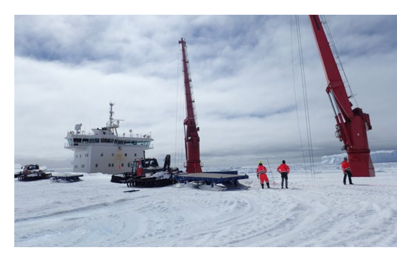
January 2016: unloading at the coast.

Depending on the funding organisation and the programme, proposals are scientifically evaluated by foreign and/or Belgian peers, followed by a strategic selection taking into account available funding, links with ongoing (inter)national initiatives and coverage of research themes. International researchers can