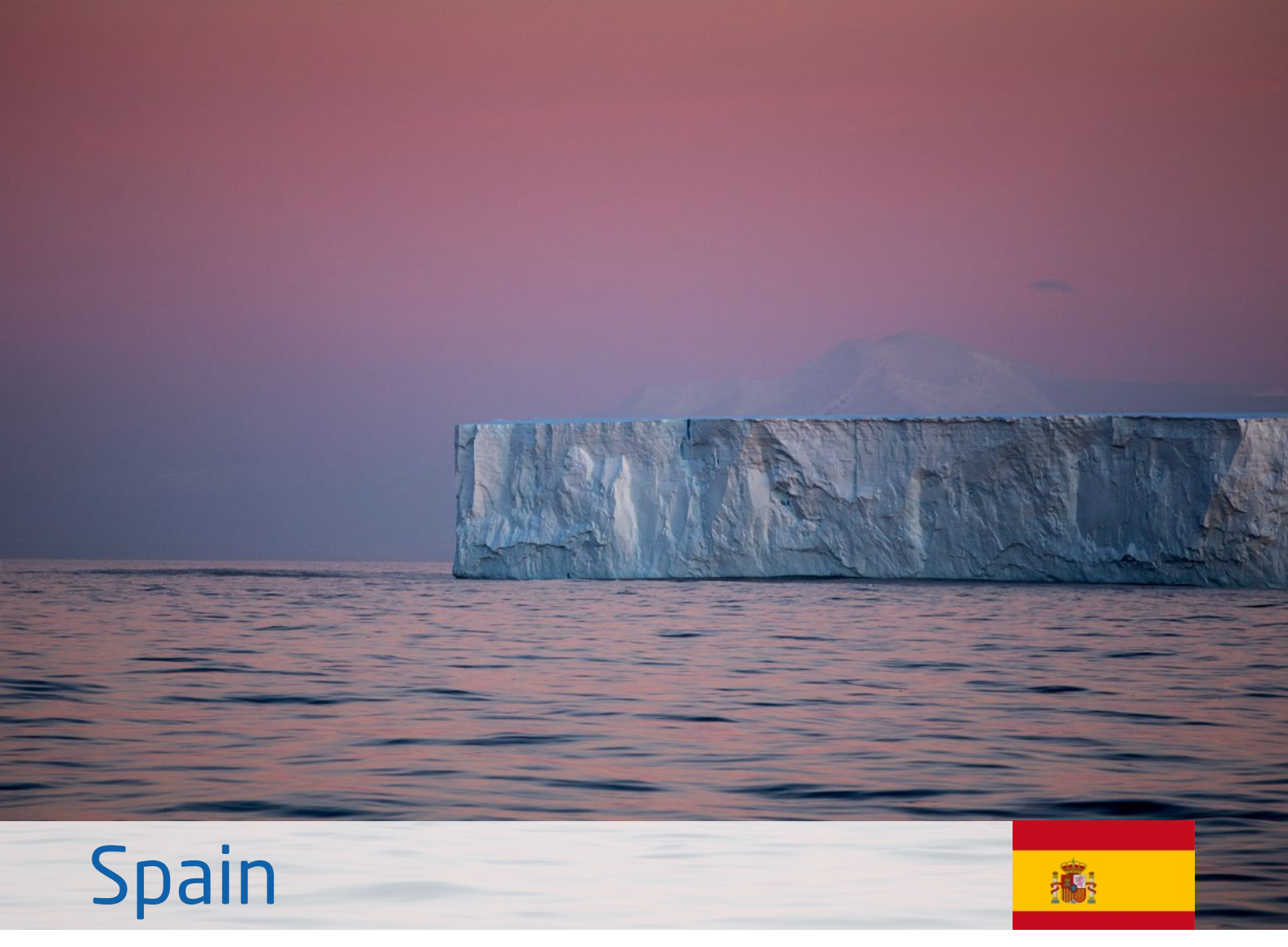
Iceberg by Marguerite Bay.

Spain has no polar institute as such. The coordination body is the Spanish Polar Committee, in which ministries involved in polar activities are represented.