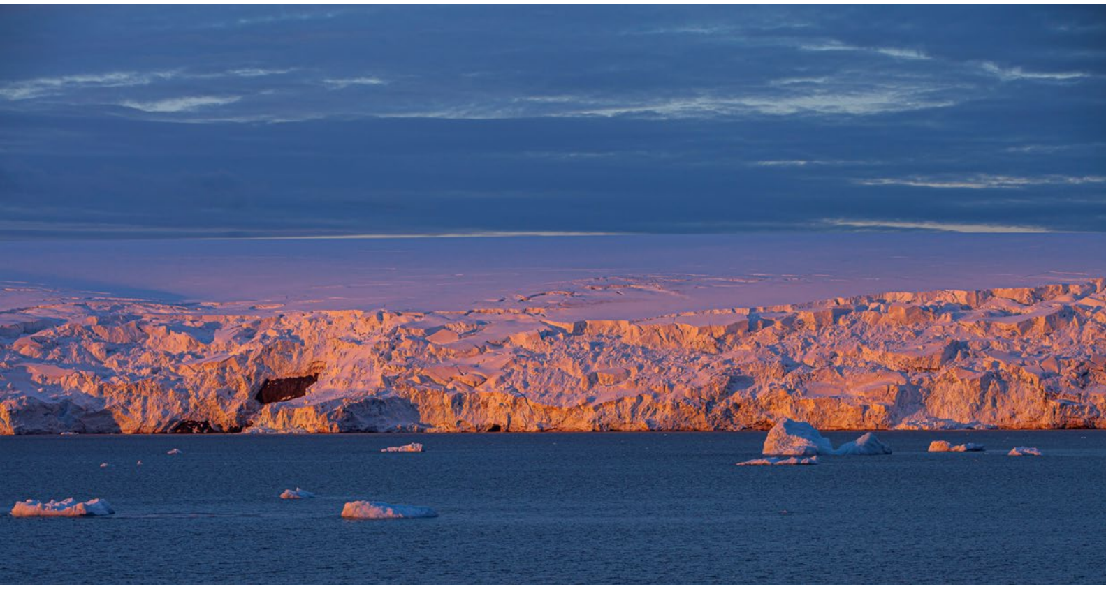
Sunset view of Smith Island.