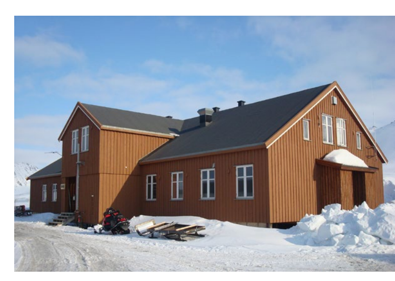
The Italian station from outside.

In Antarctica, international collaboration is promoted by providing access to and hospitality at the Italian stations and by supporting projects that aim to be carried out in non-Italian stations. Italy's main cooperation partners in Antarctic research are France, South-Korea, USA, Chile and Argentina. In the Arctic Italian scientists mainly cooperate with researchers from Norway, Germany, South-Korea, Denmark and Japan.