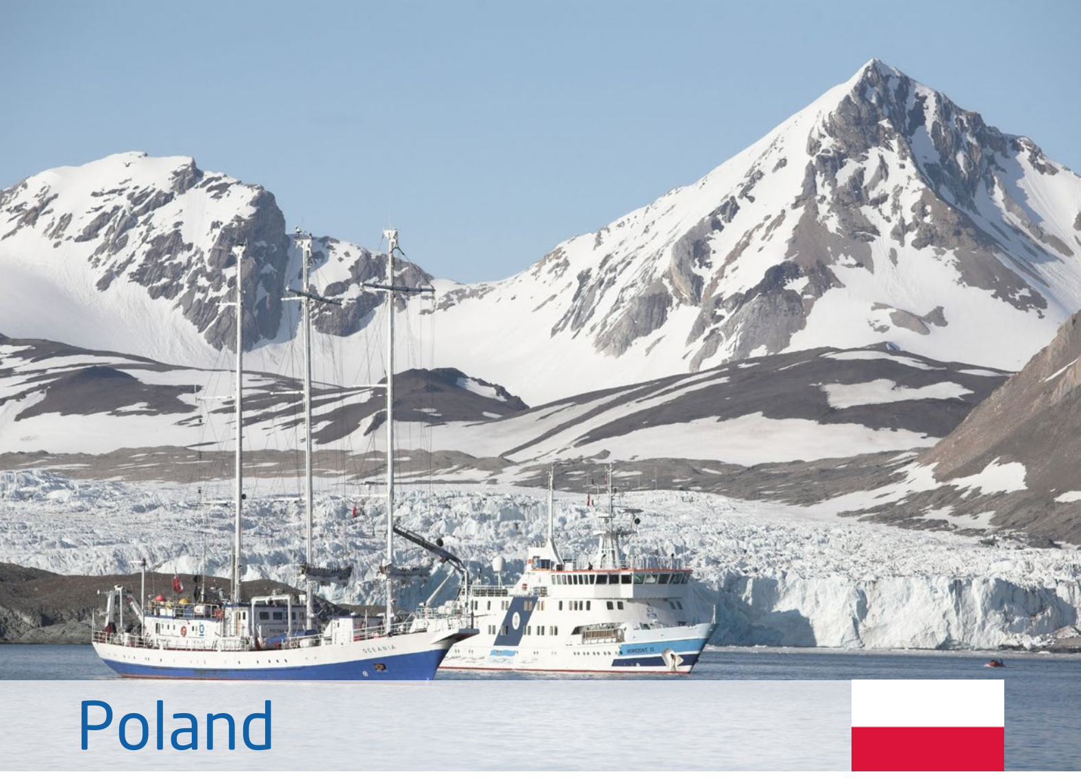
Ocenia, Horyzont.

In Poland, the <u>Ministry of Education and Science</u> ( MEIN ) is the leading governmental institution supervising the organisation and financing of polar research, providing strategic solutions and implementing national and EU programmes. It supports: