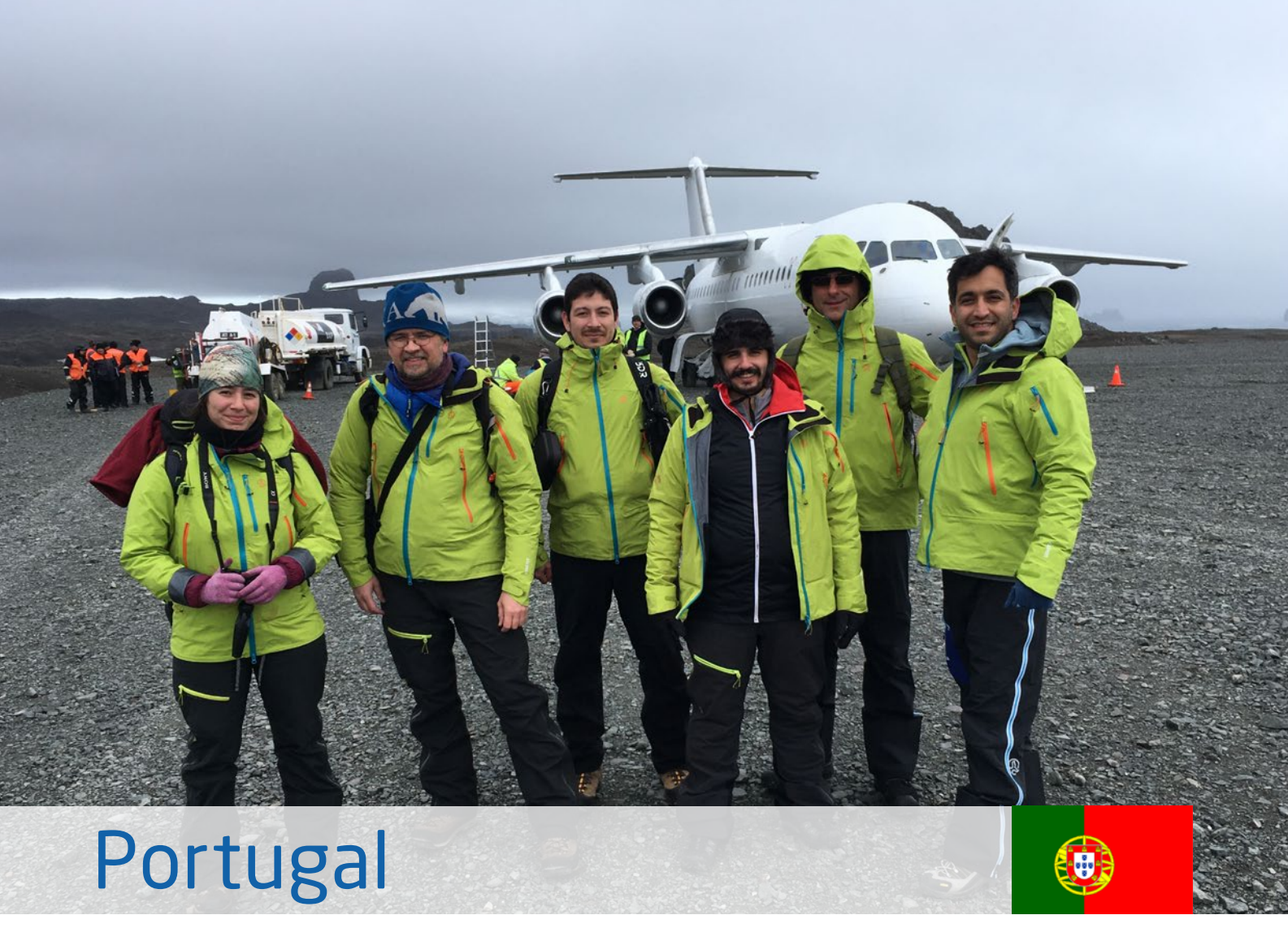
Logistic Suport Portugal.

The Fundação para a Ciência e a Tecnologia (FCT, Portuguese Foundation for Science and Technology), part of the Ministério da Ciência, Tecnologia e Ensino Superior, is the State funding agency for research, including investigation in the polar regions. It hosts the Polar Programme which links with the Instituto de Geografia e Ordenamento do Território (IGOT) - University of Lisbon, which manages the Portuguese Polar Programme (PROPOLAR). Information on the Portuguese Polar Programme and the FCT funding schemes can be found here.