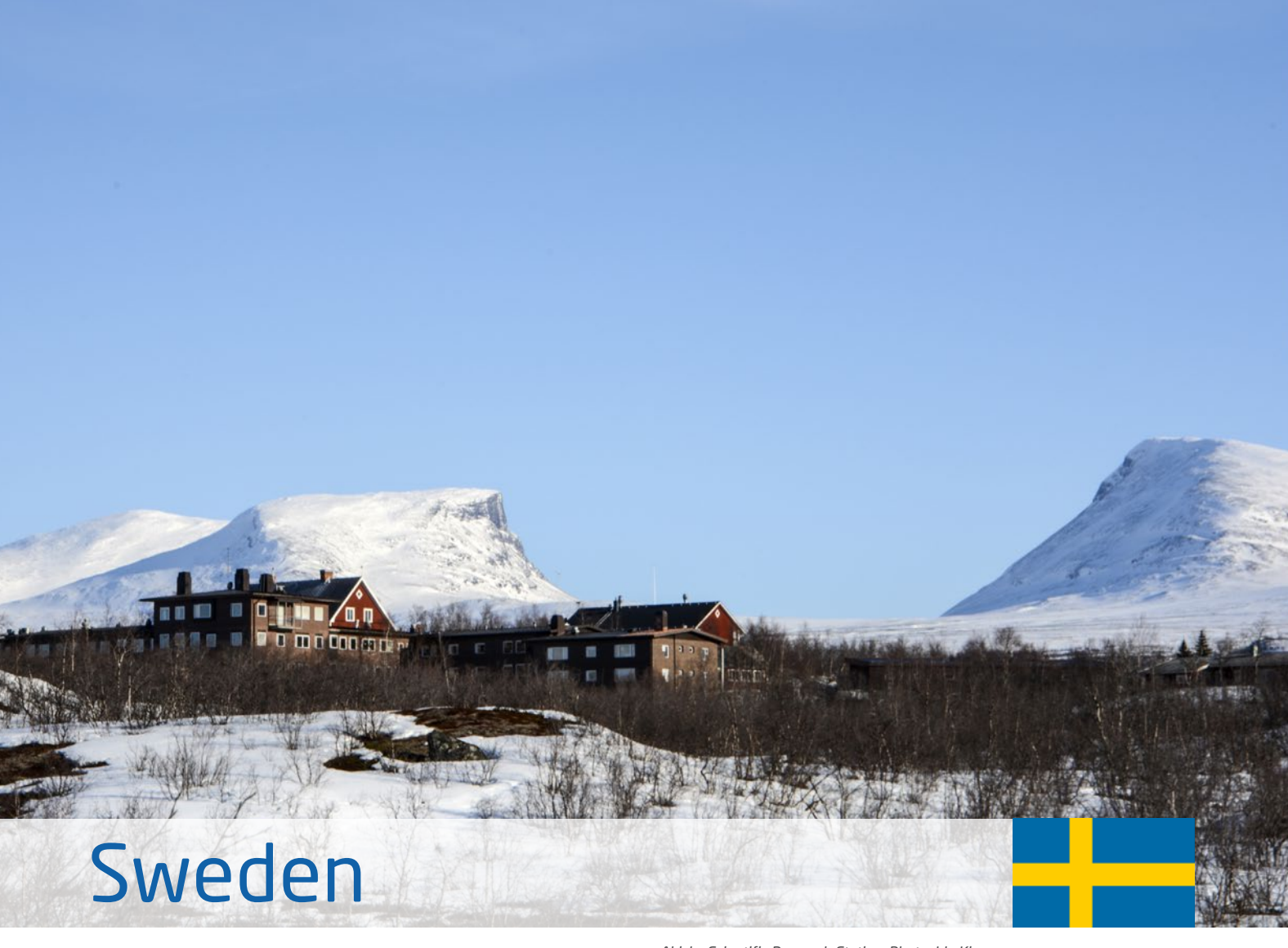
Abisko Scientific Research Station.

The Swedish Research Council (VR), the Research Council (FOR-MAS) and the Swedish National Space Agency evaluate and fund polar research projects.