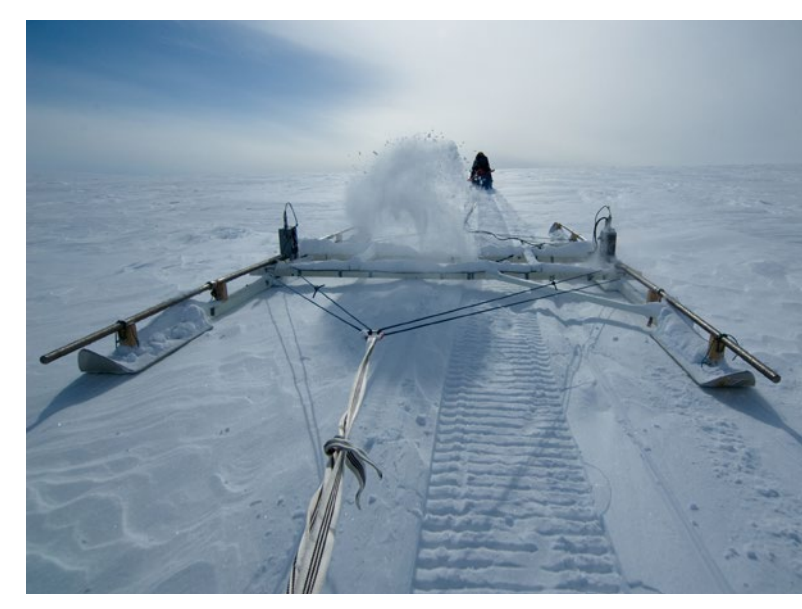
Greenland Zackenberg.

After the International Polar Year 2007/08, Austrian polar research received funding from the Federal Ministry of Science and Research for the strategic development of polar research, which enabled both the Austrian Polar Research Institute APRI and membership in the International Arctic Science Committee to be established.