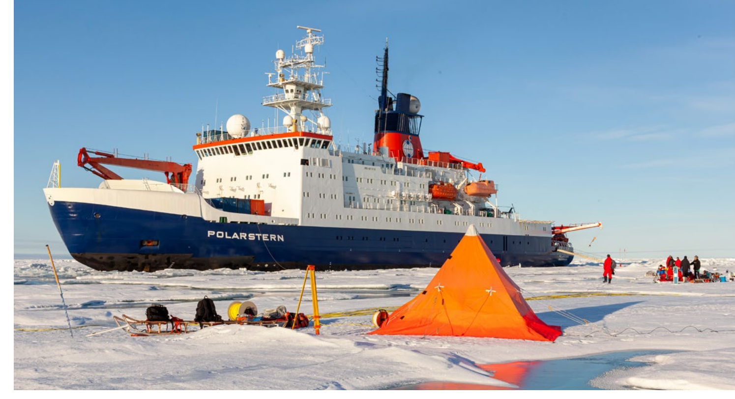
Ice station work during the RV Polarstern expedition "TransArc" in the central Arctic Ocean in summer 2011.