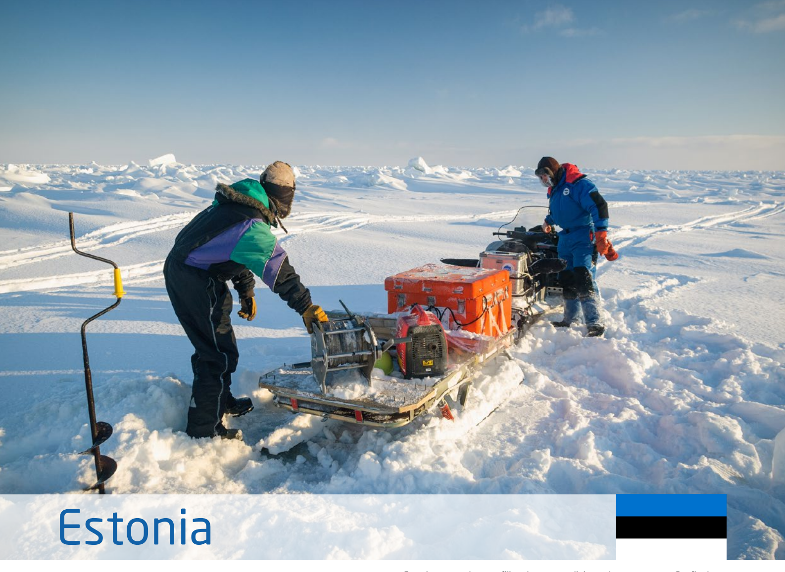
Estonian researchers profiling the water salinity and temperature at Strofjord on eastcoast of Svalbard in the frame of Damocles project.

The <u>Ministry of Education and Research</u> implements the national research policy, organises the financing and evaluation of the activities of R&D institutions and coordinates international research cooperation at the national level. The Ministry is also responsible for the planning, coordination, execution and monitoring of the research policy related to the activities of universities and research institutes.