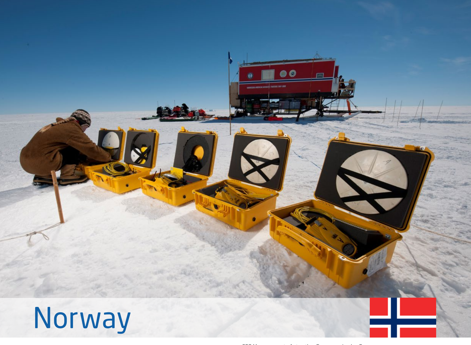
GPS Measurements Antarctica, Basecamp Icerise B.

Research in Norway is organised according to the sector principle, which means that each Ministry is responsible for financing research within their area of responsibility. Several Ministries and their subordinate agencies and institutions are involved in the governance of polar affairs in general and polar research in particular.