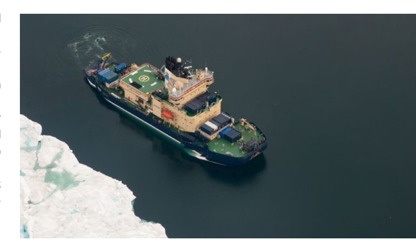
Icebreaker Oden Arctic Ocean.