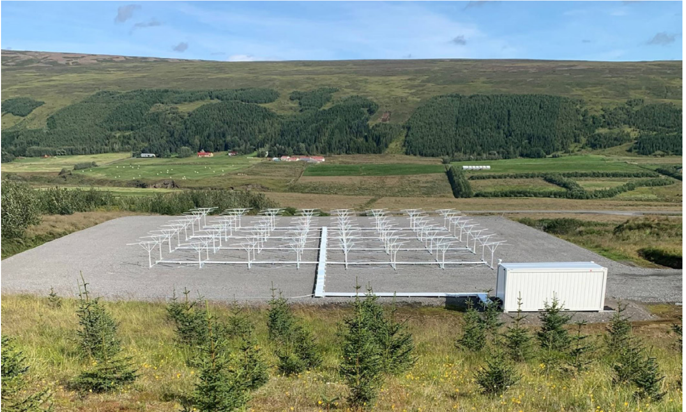
Riometer field, China Iceland Arctic Science Observatory Karholl 2021.

The Ministry for the Environment, Energy and Climate supervises various affairs pertaining to Arctic research related aspects, including climate change, weather forecasting, and environmental monitoring and surveillance. The Minister for the Environment, Energy and Climate appoints a Cooperation Committee on Arctic Affairs for a four-year period with representatives from eleven public institutes, agencies, and universities. The role of the committee is to strengthen cooperation between the parties concerned through monitoring and research in the Arctic.