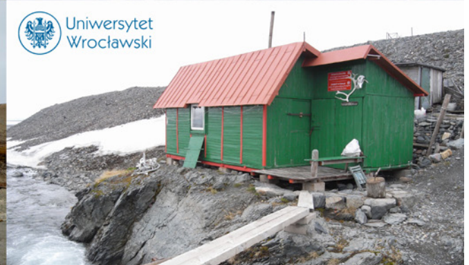
Polish seasonal field stations in Svalbard operated by Adam Mickiewicz University in Poznań, Nicolaus Copernicus University in Toruń, Marie Curie-Skłodowska University in Lublin and University of Wrocław.