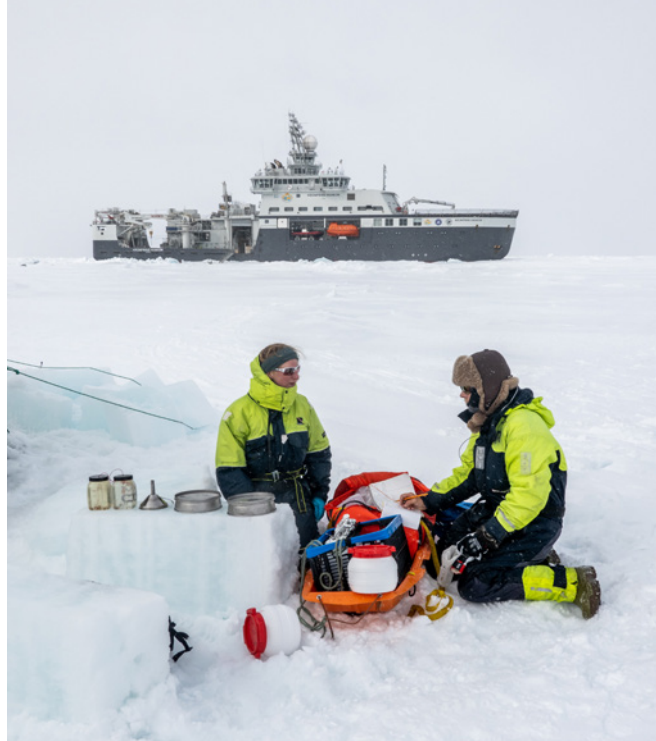
Plastic Cruise Svalbard 2021, Ice stations near Nordaustlandet, where scientists collect samples from the under-ice fauna.

Norwegian membership in the European Space Agency is administered by the Norwegian Space Agency (NOSA) , and NOSA is also the secretariat for the Norwegian participation in the EUs space programme. Several polar orbiting satellites and future satellites under development, i.e., in the EU Copernicus programme, are very important data infrastructures for the polar research community. Facilitating access to reliable and relevant data sources for climate and environmental policies is therefore a priority task for the Government's investments in space activities, The Government's strategy for Norwegian space activities .