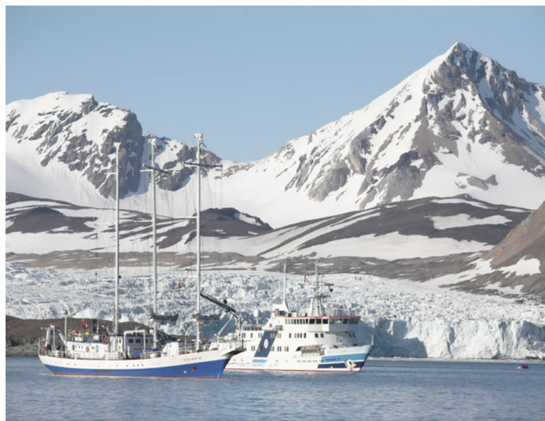
Oceania, Horyzont.

On January 28th 2022, the Prime Minister decree established the governmental Committee for the National Polar Policy to implement a national polar strategy: The Polar Policy of Poland: Resolution of the Council of the Ministers Republic of Poland No. 129/2020 with the attachment: "Od ekspedycji z przeszłości ku wyzwaniom przyszłości. Polska polityka polarna" [From expeditions from the past towards challenges in the future. The polar policy of Poland - in Polish]. This first governmental strategy on policy related to the polar regions is mainly based on the "Strategy for Polish Polar Research - a concept for the years