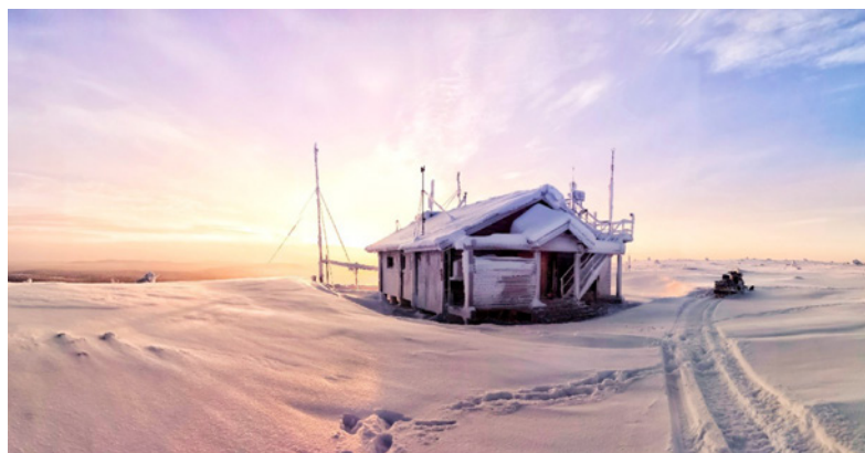
Pallas Atmosphere-Ecosystem Supersite, Pallas Global Atmosphere Watch station, Finnish Meteorological Institute.