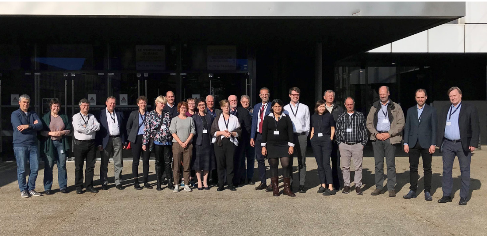
EPB Autumn 2019 Plenary Meeting, Brest.

ican polar programmes (via the Reunión de Administradores de Programas Antárticos Latinoamericanos (RAPAL)). The EPB actively works (with EU-PolarNet 2), towards implementation of the All-Atlantic Ocean Research Alliance goals for the polar regions. Within the INTERACT III project, the EPB leads work to understand the impact of the Agreement on Enhancing International Arctic Scientific Cooperation on researchers and station management throughout the Arctic.