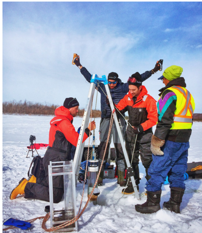
Iles Kerguelen, Lac Athena, 2019: deploying instrumentation near lake Athena as part of PALAS project. Lake sediment archives are used to reconstruct the history and ecological impact of rabbit invasion since their introduction on the island in 1874.

GROUND TRAVERSES are established between the Antarctic coast and Concordia station for resupply of the station together with the Italian ENEA operator (3 traverses each summer). The French-Italian coastal station Robert Guillard, located 5 km from Dumont d'Urville, serves as a hub to prepare the logistic convoys and scientific traverses deployed on the East Antarctic Plateau.