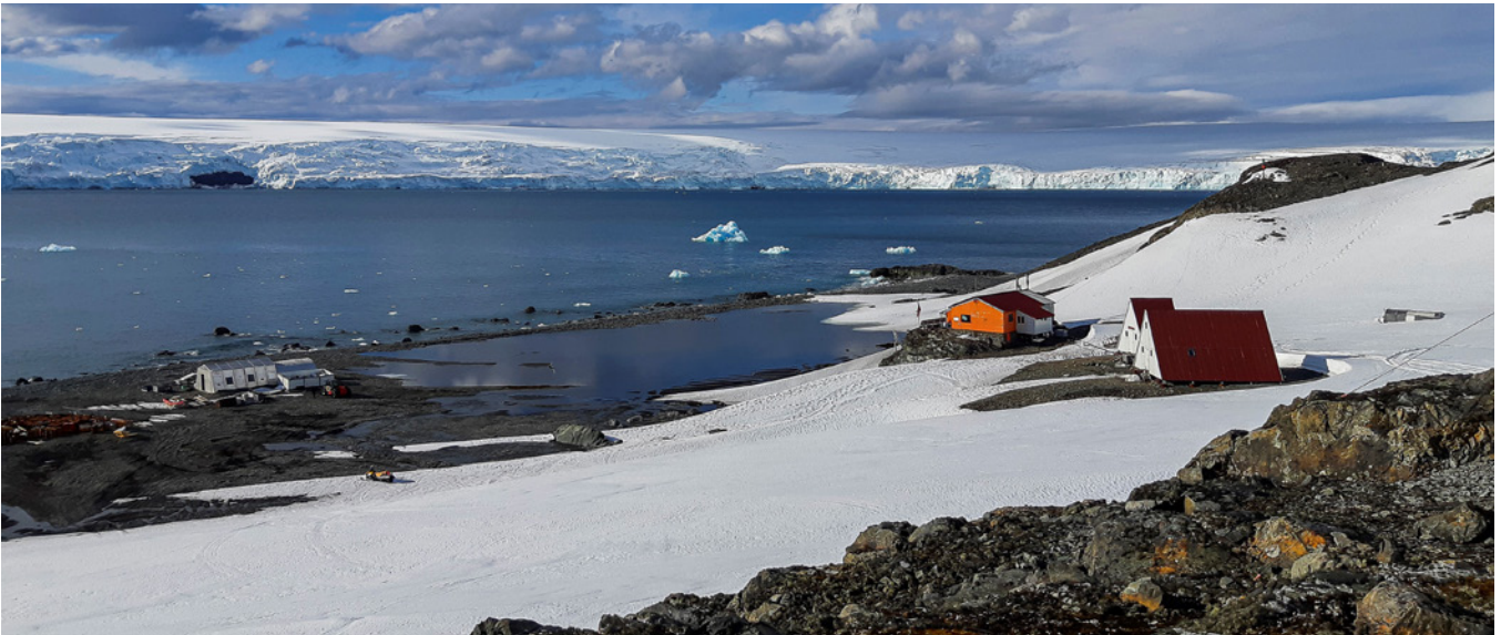
Bulgarian Antarctic base St Kliment Ohridski.

tific excellence and logistical feasibility including all necessary permissions. All foreign participants are responsible for their own transportation to and from a hub city in South America, their insurance and stay while outside Antarctica.