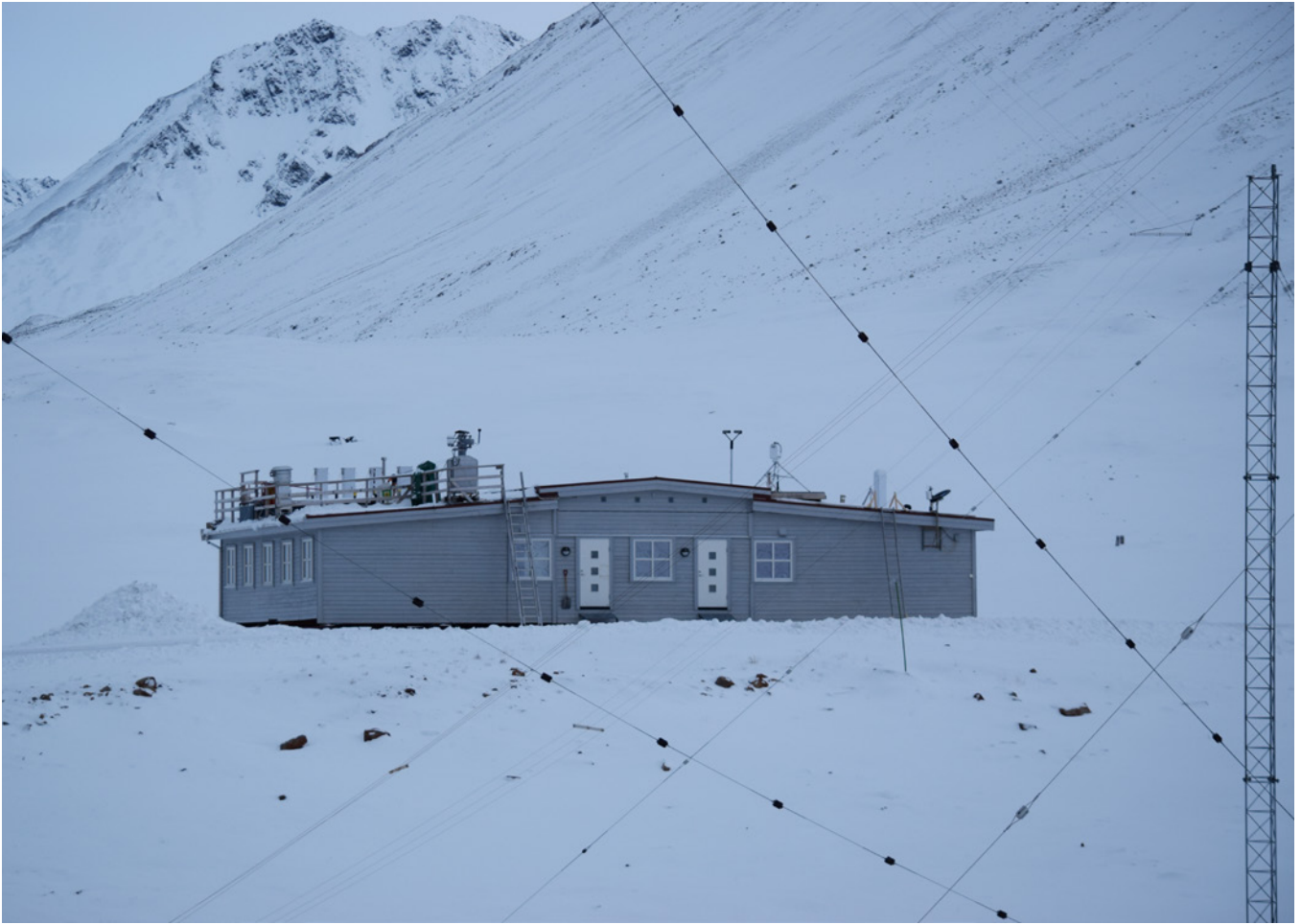
The Gruvebadet aerosol lab.

Governmental authorities and research institutions/communities are connected through the PNRA and PRA research programmes. The two programmes also develop research agendas/strategies that are approved by MUR. Italy continues to implement the Madrid protocol into its national law, which should happen soon. As soon as this takes place, the Environmental Ministry (MATTM) will also serve as the governmental authority for research activities in Antarctica.