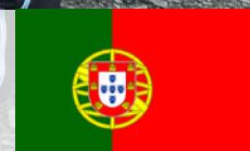
Logistic Suport Portugal.