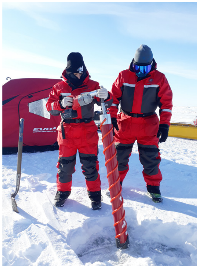
Arctic Activities Portugal.

Portugal has currently no research stations in the polar regions and hence, international collaboration in logistics is essential to its field activities, especially in the Antarctic. Since the start of the Portuguese Polar Programme, Spain is the main collaboration partner providing support with transport of equipment from Europe, as well as cooperation with transport and accommodation of scientists to the Spanish Antarctic stations. This collaboration is framed by a bilateral scientific agreement signed in 2009. Through the FCT, Portugal maintains also scientific and/or logistical cooperation for several years with many institutes and national programmes from South America (Brazil, Argentina, Chile, Uruguay and Peru), Europe (UK, Italy, Spain, Turkey), Asia (China, South-Korea) and the US. Several of these collaborations are sustained by Memoranda of Understanding. Support is provided for the transport of Portuguese researchers and equipment to and from Antarctica, as well as for the use of Antarctic research stations, remote field camps, vessels or for maintenance of field equipment.