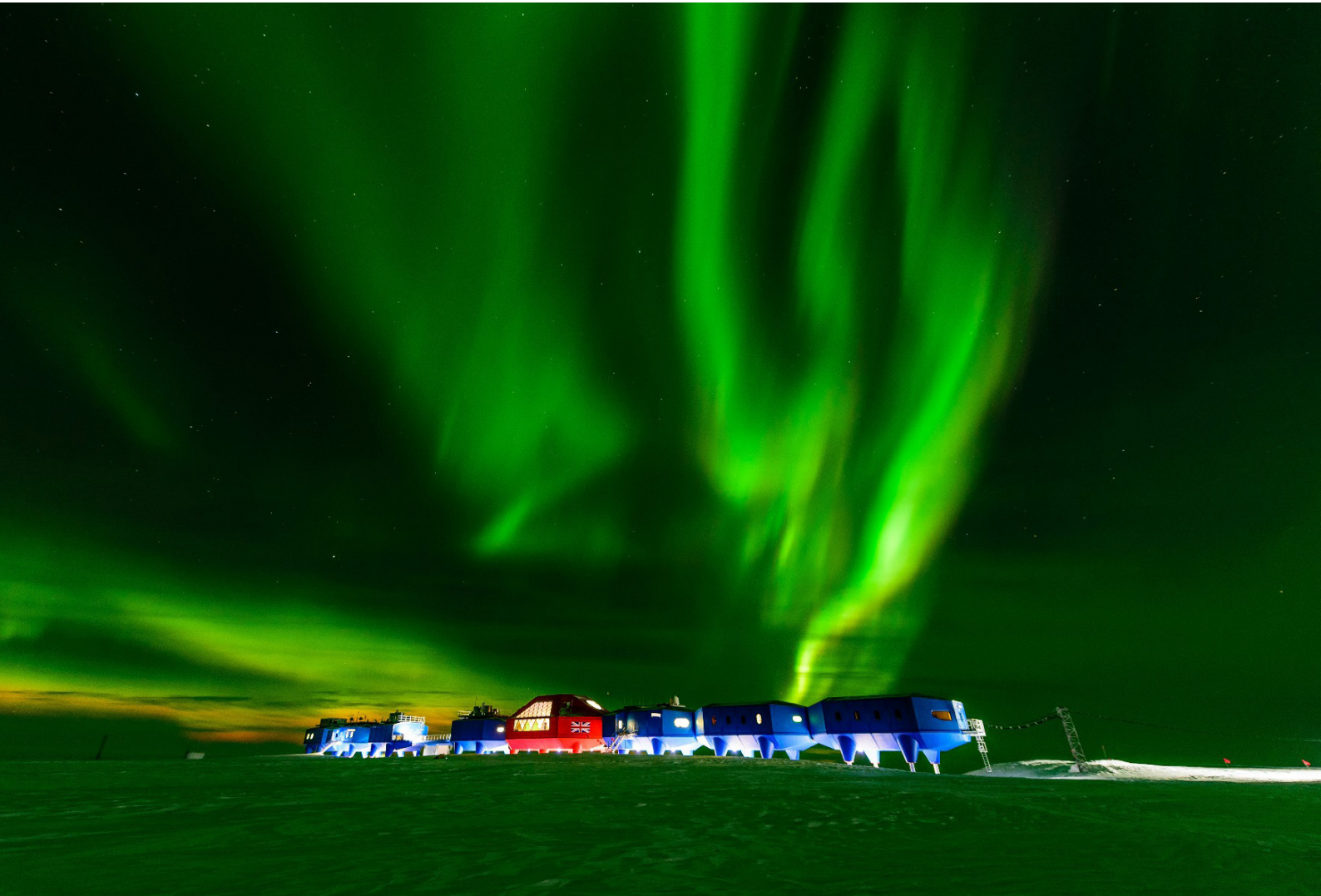
BAS - Halley VI Research Station, Photo: Michal Krzysztofowicz