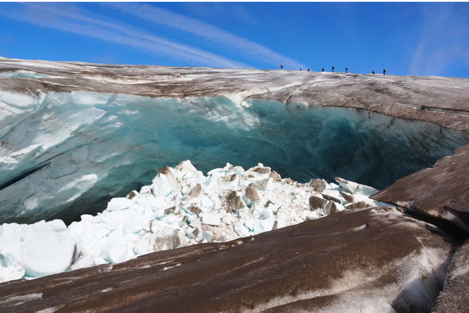
Greenland Mittivakkat c Glacier.