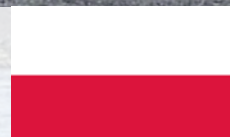
The S. Siedlecki Polish Polar Station, Hornsund, Svalbard and the H. Arctowski Polish Antarctic Station, King George Island Antarctica.