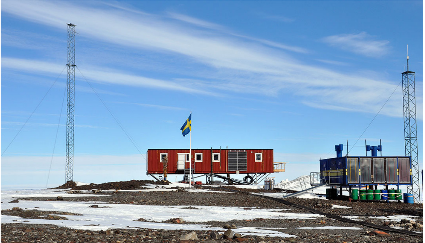
The research station Wasa in Dronning Maud Land, Antarctica.