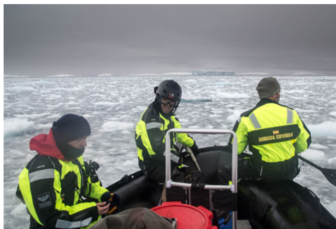
Broken ice by Biscoe Island.

Spain has published Guidelines for a Spanish Polar Strategy . These guidelines were written by SPC and endorsed by the State Secretary of Research. This document has not passed through parliamentary discussions yet.