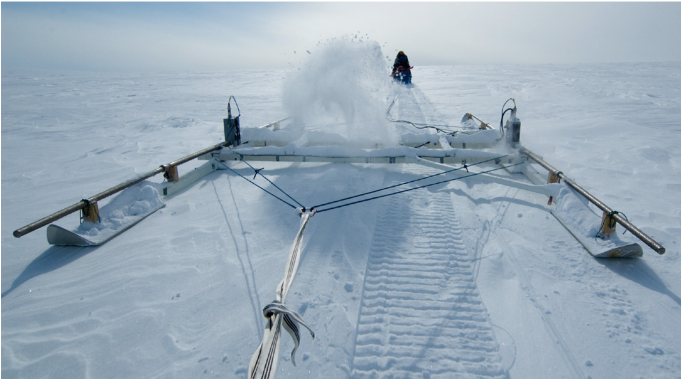
Greenland Zackenberg.