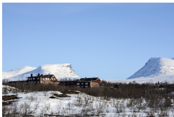
Abisko Scientific Research Station.

The Ministry of Enterprise and Innovation is the Swedish representative in the BEAC working group on economic cooperation (WGEC) and governs the Swedish Maritime Administration. It is the owner of IB Oden. Within the Barents Euro-Arctic region (BEAR) the County Administrative Board of Norrbotten and Västerbotten is active.