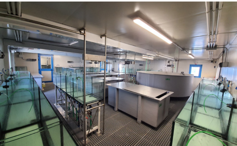
The new aquarium facility at Mario Zucchelli Station.

on the East Antarctic Plateau 3233 m above sea level and over 1000 km from the coast. It is a permanent station jointly managed by PNRA and IPEV (France) as part of their respective polar programmes.