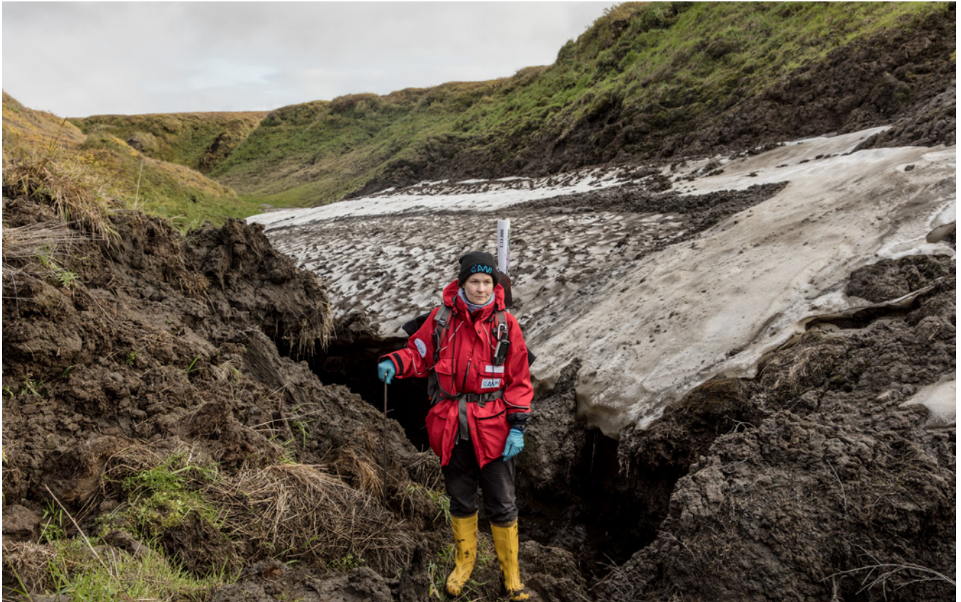
Permafrost research on Samoylov.

various observatories that gather data over longer timeframes. One example is the FRAM observatory in the Fram Strait, which targets a modern vision of integrated underwater infrastructure. FRAM enables truly year-round observations from surface to depth in the remote and harsh Arctic Ocean.