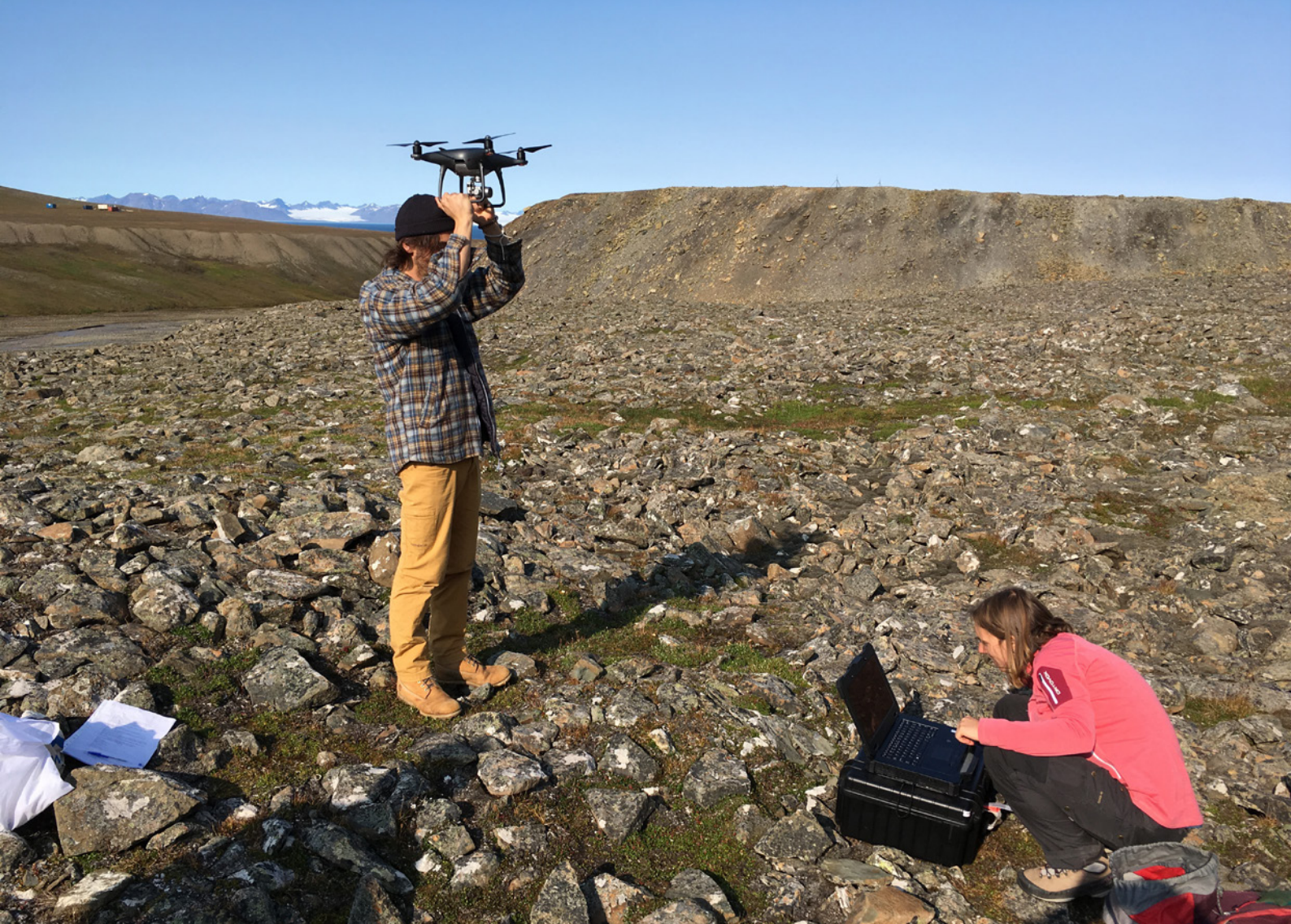
Vegetation drone mapping, Bjørdalen Valley, Adventfjord (Svalbard).