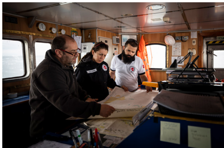
2018-2019 Antarctic Season, R/V Betanzos.

The Ministry of Industry and Technology prepared a National Polar Science Programme for the 2018-2022 period with contributions from over 100 scientists from 40 institutions. The objective of the programme is to implement polar research with a systematic approach. The vision of the programme is "becoming one of the scientifically-successful programmes". As required by this vision, the main objectives are implementing polar research activities with a systematic integrity and project approach, ensuring that national expeditions are conducted to polar regions to provide scientific opportunity, promoting bilateral cooperation on polar sciences and creating awareness of global climate change and polar regions.