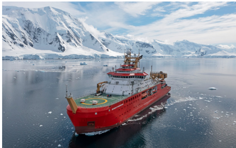
The United Kingdom's polar research vessel, RRS Sir David Attenborough, in the Neumayer Channel, Antarctica, January 2022.

Detailed information on the infrastructures can be found in Polardex .