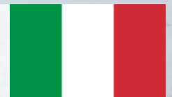
Dirigibile Italia Station activity at NYA (reaching the measurement site)