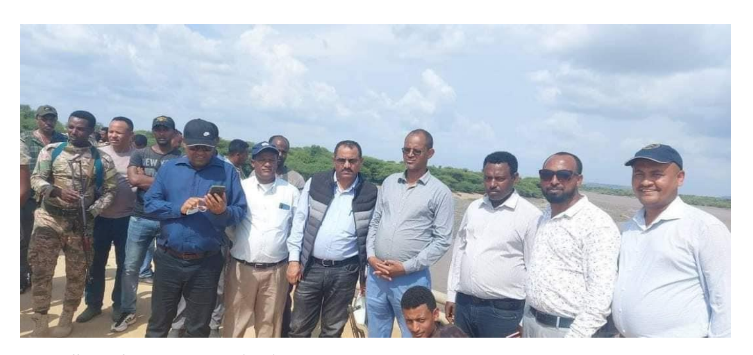
Fig. 3. Officials of Gondar, Bahir Dar (BDU), Debre Markos, Debre Birhan, Debre Tabor, Wollo, Woldiya and Debarq Universities on the Tekeze bridge in Humera<sup>105</sup>. They were on an organised visit to the armed forces in the occupied Western Tigray. The same officials have never visited their own university colleagues who are in concentration camps in Amhara Region. There is also no evidence that in Humera, they inquired about the dire human rights infringements in that town.