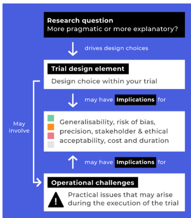
Fig. 1. Visualization of the interplay between design choices, implications and operational challenges.

methodological framework of pragmatic trials with three additional aspects, which need to be taken into account, to make balanced design choices towards Real World Evidence generation: