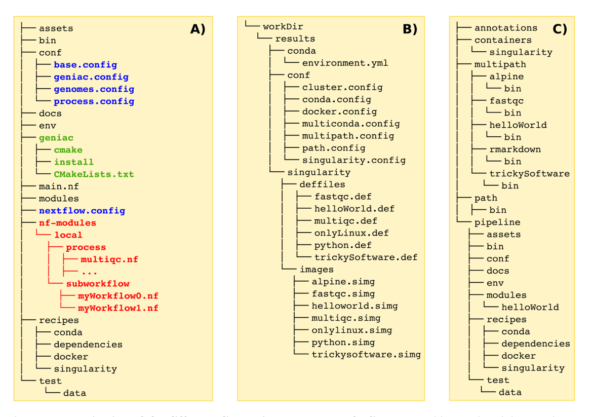
Figure 3. Organization of the different directories. A) source code directory: in blue are listed the mandatory files which could be retrieved from the Geniac Template, in green appears the folder of the Geniac toolbox itself which contains the files from the Geniac repository. Examples of source code are available on the GitHub repositories for both the Geniac Demo and the Geniac Demo DSL2 (in red is highlighted what is specific to a Nextflow pipeline which is implemented with DSL2). B) build directory: once the pipeline has been configured with cmake and built with make, a workDir folder appears with all the files which are automatically generated by Geniac. C) install directory: during the installation with make install several folders are created such as the pipeline folder which contains the Nextflow code.