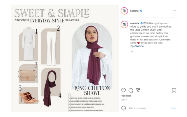
Figure 4. Creative Advertising Post by Naelofar Hijab Brand