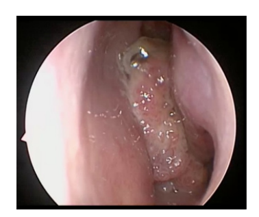
Figure 1: Endoscopic picture of the exophytic fleshy mass on the left intranasal cavity.