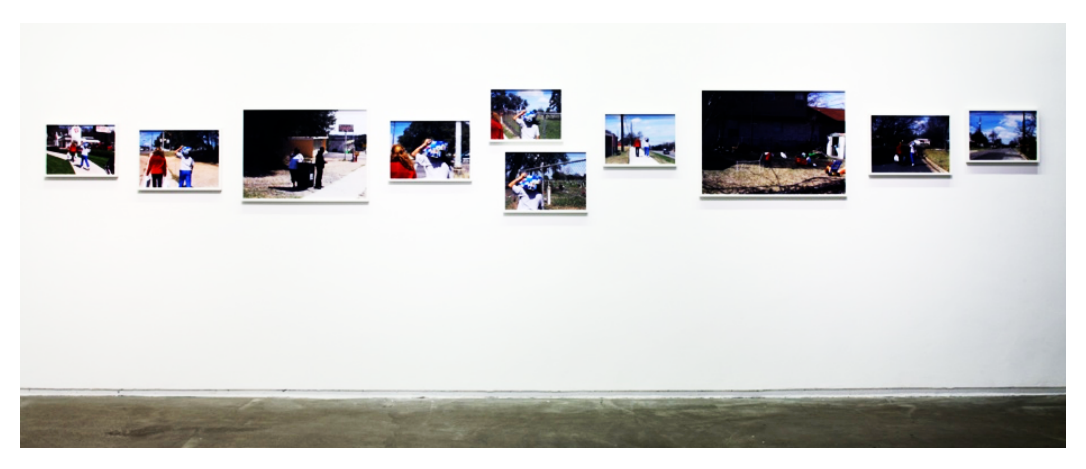
Figure 10: Installation view of Paul Graham, Austin, Texas 2006 at The Douglas Hyde Gallery, Dublin 2012.

One and the same photographic sequence affords something completely different in a public exhibition space than in a private gallery. In a museum, viewing the work educates the viewer aesthetically. In 2012, the photographical sequence Austin, Texas was shown at The Douglas Hyde Gallery, Dublin (fig. 10). The arrangement of the photographs is slightly different. The pictures are hanging on a single wall and the viewer can approach them orthogonally. Once again, the hanging was done by the artist himself.