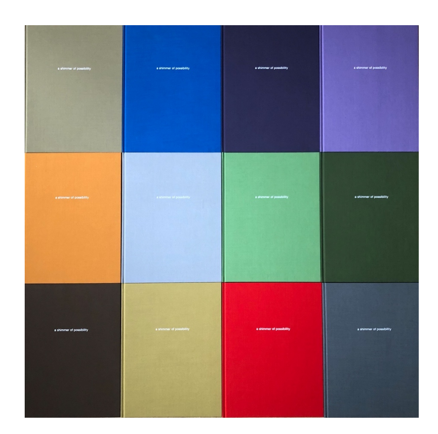
Figure 1: Paul Graham, a shimmer of possibility , first hardcover edition, SteidlMACK 2007.

In May 2009 a shimmer of possibility was published once again in a softcover paperback edition in a minimally smaller format of 24.2 x 31.8 cm and with 367 pages as a whole book (fig. 2). In contrast to the first edition, the photographs in this edition are overprinted with a light clear varnish to make the colours appear deeper and more saturated. The paper is thinner and glossier.<sup>23</sup> In 2018 the publishing house MACK Books London decided to reprint the twelve volumes. In the reprint edition, all volumes are bound in the same light blue-violet linen (fig. 3). The title is printed in the colours of the first edition. These are the three primary, material manifestations of a shimmer of possibility . Quantitatively speaking, most people will only have access to the paperback edition and no access to the 12 hardback volumes either of the first or the third edition or the original photographs.