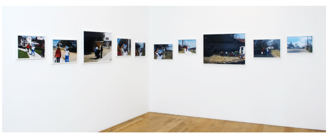
Figure 9: Installation view of Paul Graham Austin, Texas 2006 from a shimmer of possibility at Anthony Reynolds Gallery, London 2007.

The affordances an artwork offers can be quite different depending on the situation of the encounter.<sup>29</sup> When a viewer enters a public exhibition space, the aspect of aesthetic education is the focus of interest. But when a viewer enters a private gallery, the situation is different. Here it is a matter of purchase. The question of how expensive such a photographic sequence is and whether it is still available for purchase at all is standing in the room. A shimmer of possibility was first exhibited at Anthony Reynolds Gallery, London from September 13 to October 14, 2007. Austin, Texas 2006 was installed over a corner (fig. 9). The first five photographs were hanging on the left wall and the second five photographs on the right wall. The hanging was done by the artist himself.