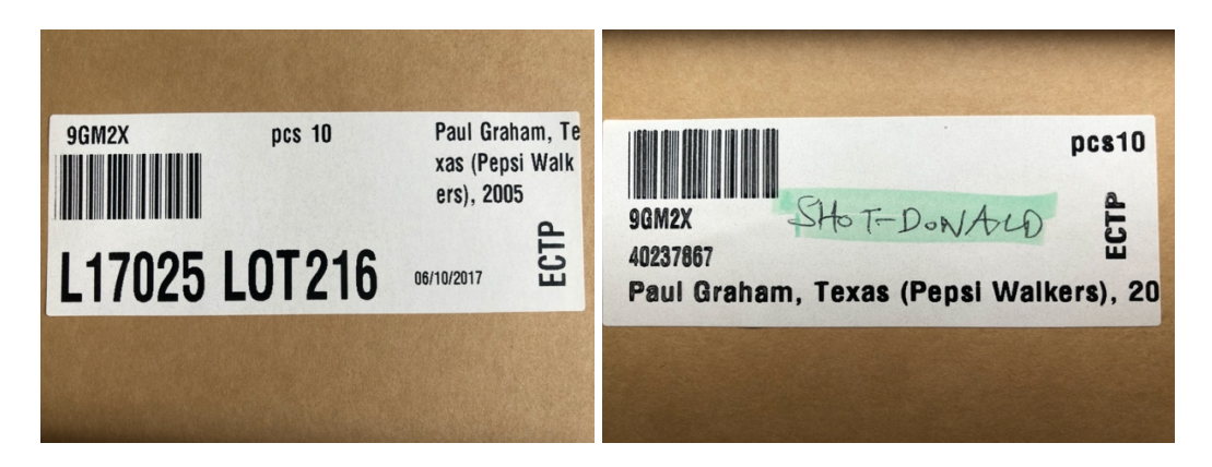
Figure 7 and 8: Sticker of Sotheby's, London, 2017.

Furthermore, it contains four stickers with valuable information. The most important is from Anthony Reynolds Gallery, 60 Great Marlborough Street, London. It contains the artist's name, the title of the work Texas Pepsi Walkers from the series a shimmer of possibility; plate 5", which in this case differs significantly from the title and the year in the photobooks (fig. 6). It dates the sequence back to the year 2005, although the photobook indicates 2006 as the year of creation. Furthermore, the sticker contains information about the size of the photograph, the number of the plate, the size of the edition (Edition of 5 + 1 artist print) and the number of the edition (1/5). Then there are two stickers from Sotheby's London, where the work was auctioned in 2017, containing the lot number 216, the number of sold pieces (pcs 10) (fig. 7) and the name of the photographer, Shot-Donald (fig. 8).