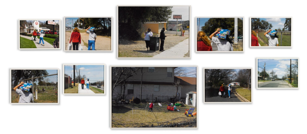
Figure 11: Installation view of Paul Graham Austin, Texas 2006 at Sothebys, London 2017.

In a gallery or auction house, the artwork affords a price at which it can be purchased. A gallery or auction house is acting like a broker or agent who offers a work of art he or she has suggested as relevant for an audience. However, demand must be added to supply. The gallery cannot force this. One edition of the photographic sequence of Austin, Texas 2006 was sold at Sothebys, London on October 6, 2017. The pictures hung in two rows, an assembly which Graham often uses, also for other sequences of a shimmer of possibility (fig. 11).