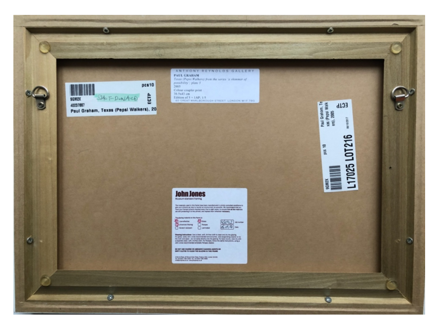
Figure 5: Paul Graham, a shimmer of possibility (Austin, Texas 2006) detail of backside of plate 5