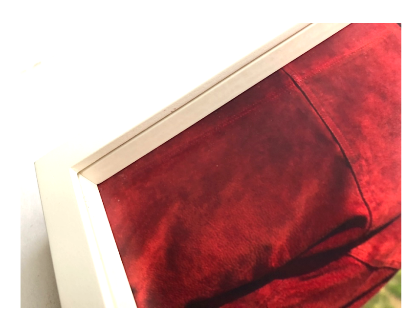
Figure 4: Paul Graham, a shimmer of possibility (Austin, Texas 2006) detail of frame.

The ten panels consist of so called colour coupler prints , also known as C-prints.<sup>27</sup> They are framed flush with an angular white frame and with a spacer strip at a distance of about 1 centimetre (fig. 4). The framing was carried out by the company John Jones, London on 5 September 2007 using "museum-standard framing," in which the glass is low-reflective and filtering the ultraviolet light. The back of the frame is fitted with a diagonal, bevelled, four-sided hanging strip, which is connected to the white frame strip. In addition, the joint was sealed dust- and airtight with a brown, 12 mm wide, water-soluble adhesive tape. Four spacers made of transparent plastic as well as two hanging loops, which are attached to the sides, complete the back of the frame (fig. 5).