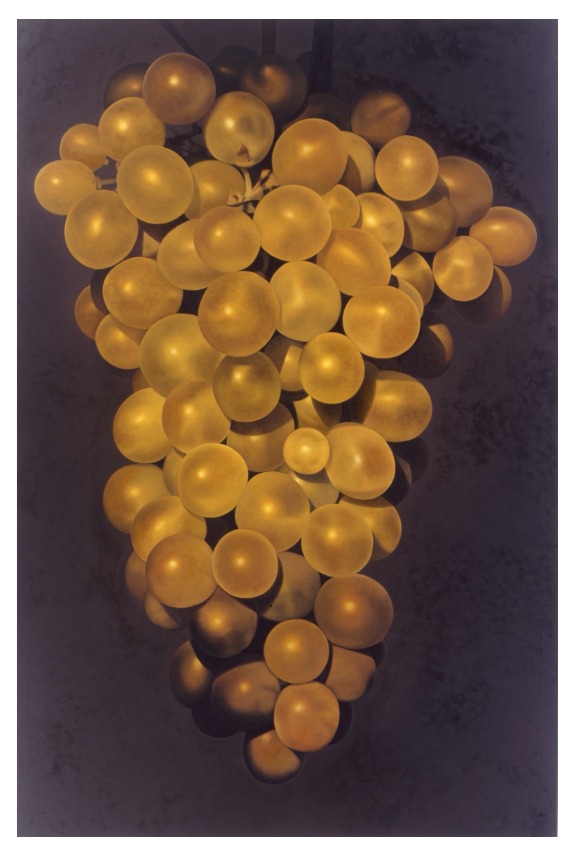
Figure 2: untitled (grapes), 1998, oil on canvas, 3,00 x 2,00 m, DZ Bank, Kunstsammlung Düsseldorf