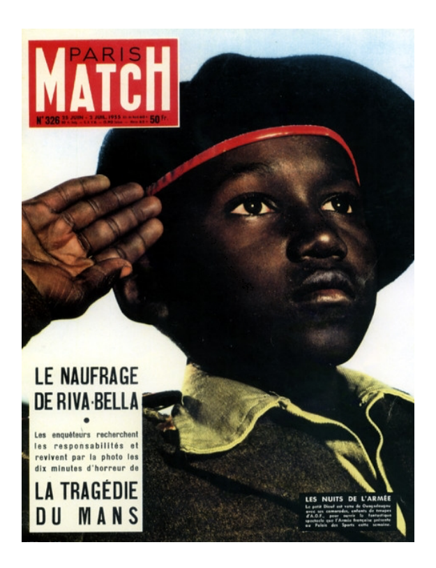
Figure 4: Cover, Paris Match , No. 326, 25th-26th June 1955 (https://en.wikipedia.org/wiki/Mythologies_(book), use Rationale for Roland Barthes "Mythologies", 1957

Roland Barthes is one of the first to make a significant contribution to the study of postmodern age, 'avant la lettre'. (Cf. re. cultural studies, Grabbe, Rupert-Kruse 2009, 21-31) In his key book Mythologies form 1957, he spoke of facts, which precisely characterizes the everyday understanding of media, be it words or pictures, without us recognizing their subliminal meaning. (Cf. re. images, Jöckel 2018, 255-273) The Fruits of Karin Kneffel are a good example of this. Influenced by our everyday experiences, they too give us credible impressions of fruits that look exactly the way we think they should look, be it peaches, grapes, apples, plums or cherries. But Roland Barthes abandoned this idea by showing that what we see is never factual or neutral, but "mythologies". One of the best-known examples, with which he also presented his theoretical considerations on the subject, is the cover of the magazine Paris Match from June 1955 of a young black man in uniform saluting with a militarily greeting.