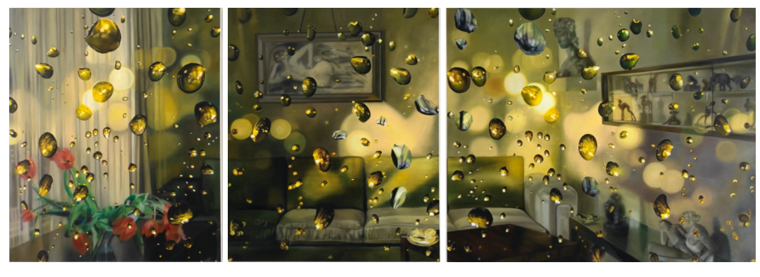
Figure 5: untitled (Haus Lange, Krefeld, living room), 2009, four-part, oil on canvas, 1,80 x 5,20 m, Collection Heinz und Marianne Ebers-Stiftung.

Kneffel's desire to reproduce everything as plausible and 'authentic' as possible, as it looked, inspired her to examine, especially with regard to the latter, who owns the works today and where they hang (fig. 7). (Voss 2019, 86) In this way, she can give a faithful picture of their appearance. With regard to Kneffel's realized Interiors, they seem to fulfil this claim so authentically, which they in turn do not.