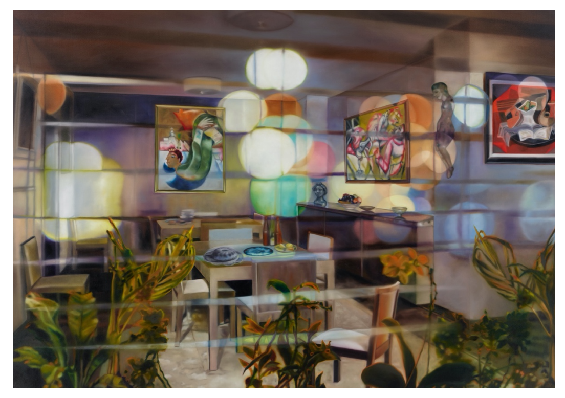
Figure 6: untitled (Haus Lange, Krefeld, dining room), 2017/5, oil on canvas, 1,80 x 2,40 m, private collection.