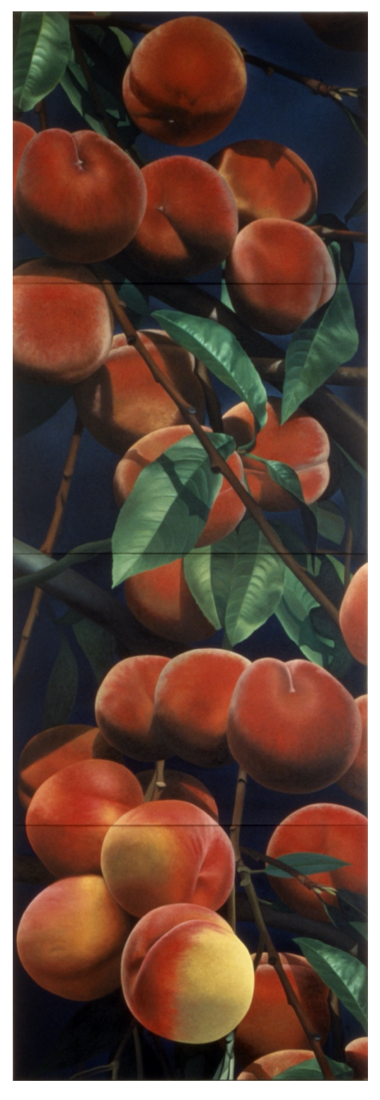
Figure 1: untitled (peaches,) 1996, four-part, oil on canvas, 7,10 \times 2,40m , KfW Stiftung Frankfurt a.M.