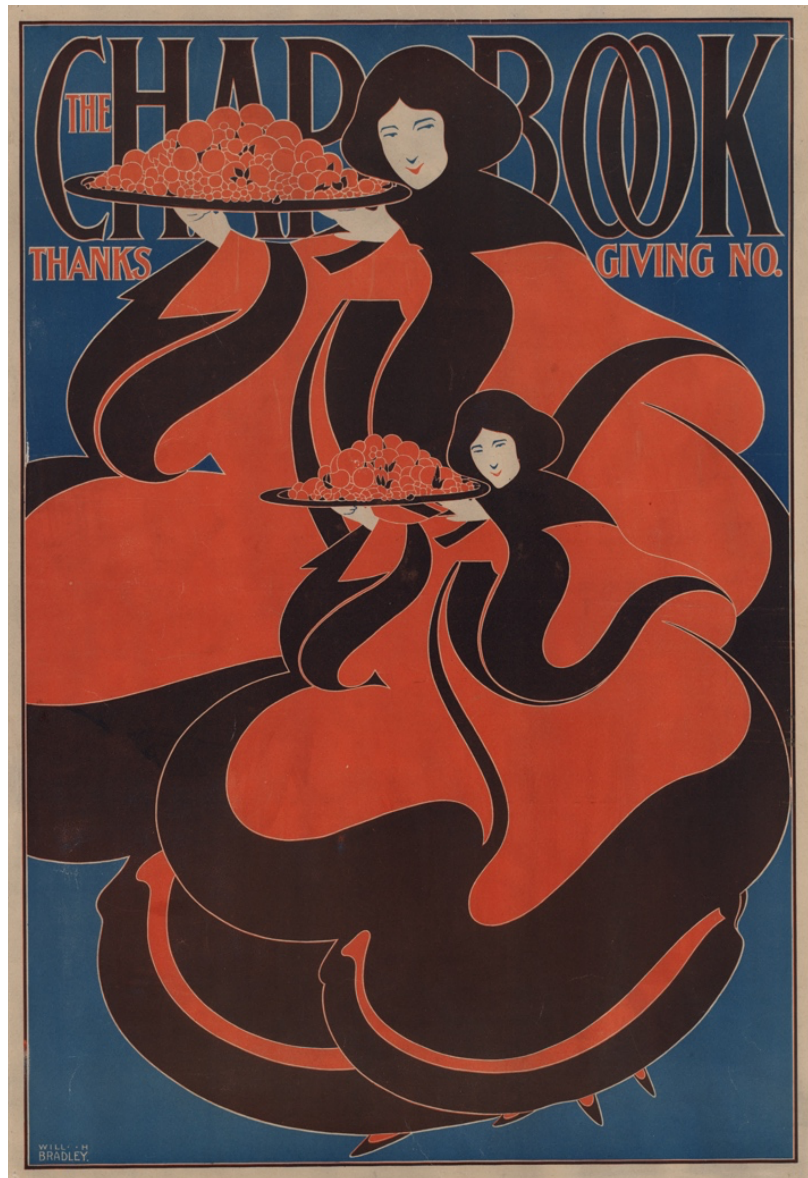
Figure 2. Will Bradley, The Chap-Book , 1895.