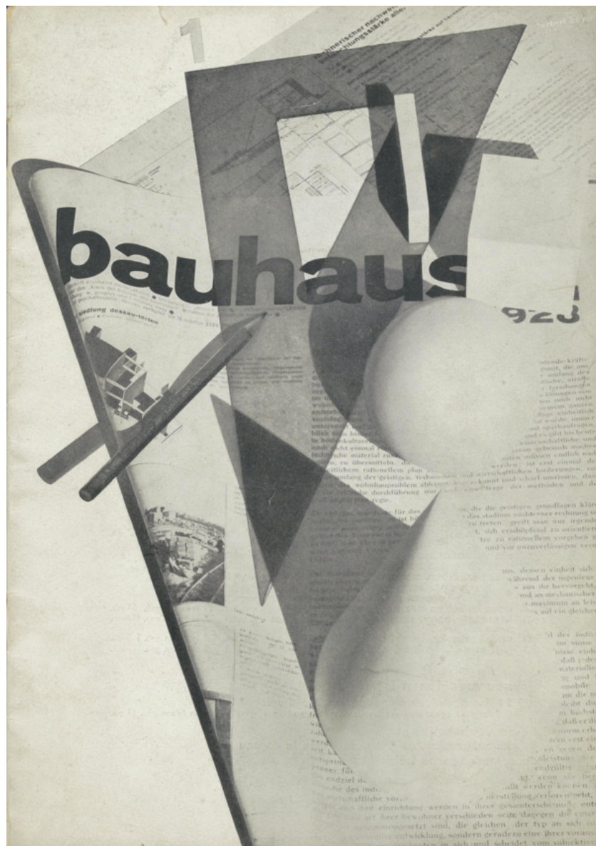
Figure 6. Bauhaus Magazine ( Bauhaus: Zeitschrift für Bau und Gestaltung 2:1 ) 7 15 Feb 1928. Editors: Walter Gropius and László Moholy-Nagy. Image Cover by Moholy-Nagy. Image in the public domain.

transformations that concerned the rupture of values, the constant search for solutions to social problems, and the changing of habits and behaviors. As a result of the Bauhaus lessons, any form of hierarchy that compared both art and design and outlined the differences between the artist and the craftsman would no longer be accepted by its members. Undoubtedly, many innovative results in the world of the arts and between artists were due to the freedoms and equality experienced during the existence of the Bauhaus.