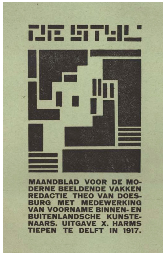
Figure 5. De Stijl , Vol. 1, no. 1, Delft, October 1917. Design by Vilmos Huszár. Image in the public domain.

However, similar kinds of art projects were common among the De Stijl artists. For example, between Van der Leek and Van Doesburg, who gradually began to form their styles with neutral colors—black, gray, and white—not only in painting but also in architecture, sculpture, and typography. It was precisely with this latter technique that Doesburg began his graphic and editorial project by publishing and financing the De Stijl magazine from 1917 until his death in 1931 and disseminating the movement's theory and philosophy to a wider audience (fig. 5).