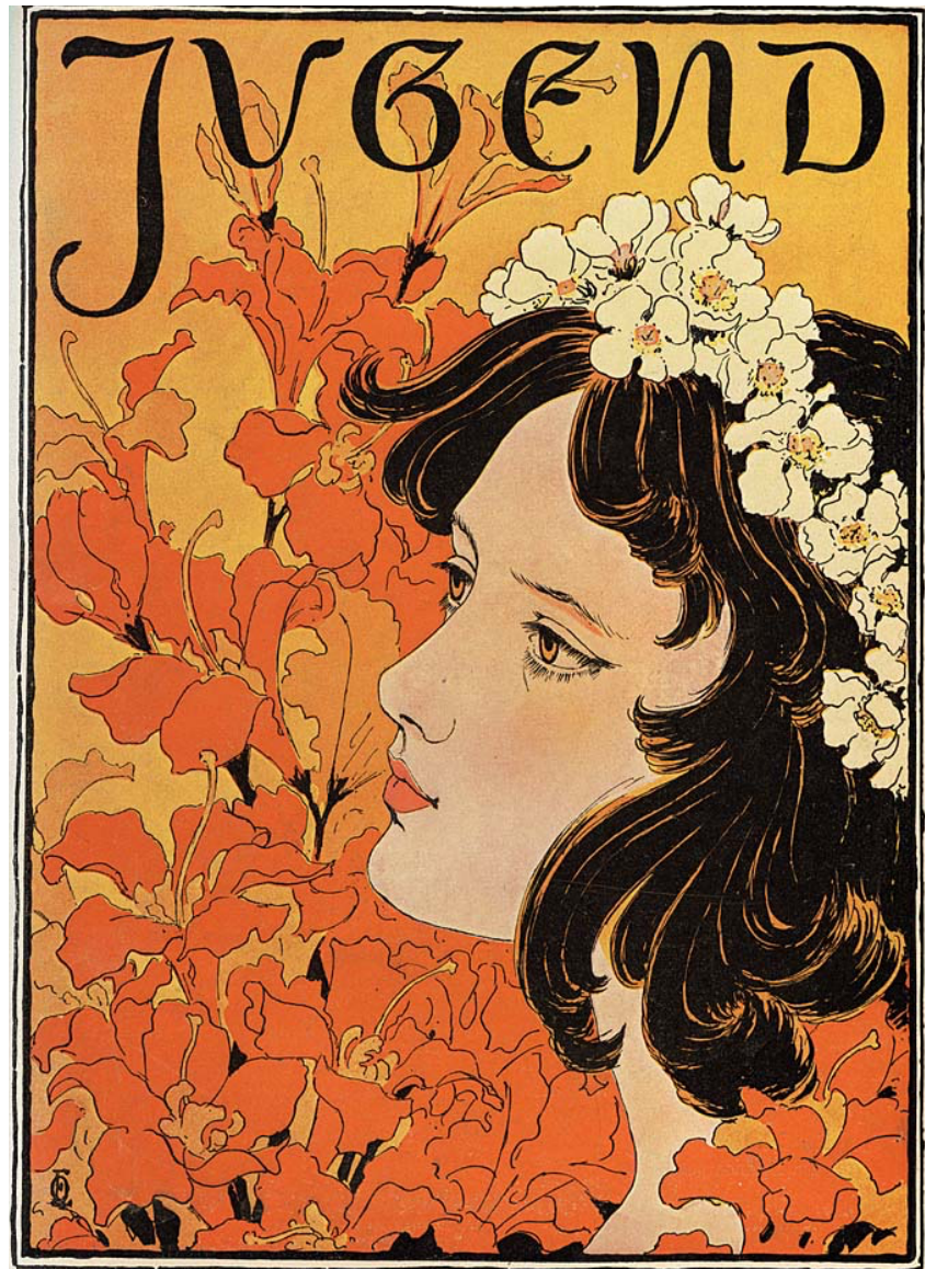
Münchener illustrierte Wochenschrift für Kunst und Leben. — G. Hirth's Verlag in München & Leipzig.