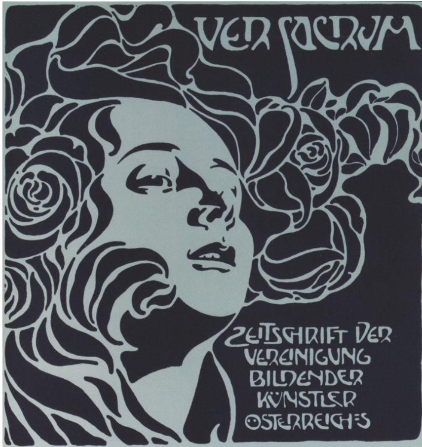
Figure 4. Koloman Moser, Ver Sacrum cover, 2/4, 1899. Image in the public domain.

In general, the possibilities of communicative mechanisms as factors of change in society do not come from technology itself, but rather from what humans do with it. There is no other way to relate except by communicating—a process achieved by humans through technology and media. In this sense, the arts, intrinsic to their techniques, can be considered precursors in the process of evolution and the access to knowledge in Western societies, idealizing the spirit of the time.