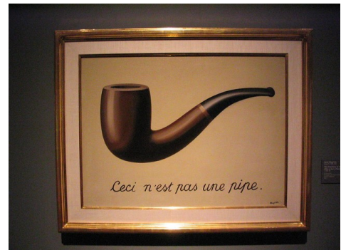
René Magritte (1929), Ceci n'est pas une pipe.

As exemplified by Magritte 's paintings, the main authors associated with poststructuralism encourage us to distrust an idealised but widespread vision of language as a mirror of nature . In turn, questioning of the capacity of language to convey indubitable meanings makes it possible to dispute the validity of the philosophical projects inspired by this vision, such as rationalism , which are committed to Knowledge or Truth as absolute values, and, more specifically, the tenability of methods of analysis with a long tradition in particular disciplines, for example literary criticism understood as an exercise aimed at discovering the true meaning of texts.