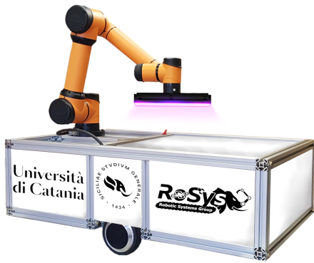
Fig. 1. The prototype of mobile manipulator developed for the testing.

for each of them and finally merge these trajectories through a backtracking policy. Taking into account the UVGI model described in [8] and the UV source’s properties, a suitable coverage timing is considered to ensure the proper UV dosage for virus inactivation. The distance of the end effector to the surface is constantly monitored as well, still to ensure the proper UV exposure of the surface, by acting on the scanning velocity of the irradiation source.