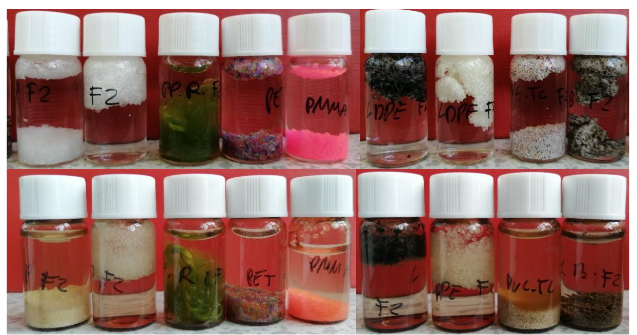
Fig 3: Five different types of MP from a range of sources in water. Top is before treatment with an electron beam, bottom is afterwards. Note that after treatment almost all the MPs are either floating or have sunk, hence providing routes for removal using standard techniques.