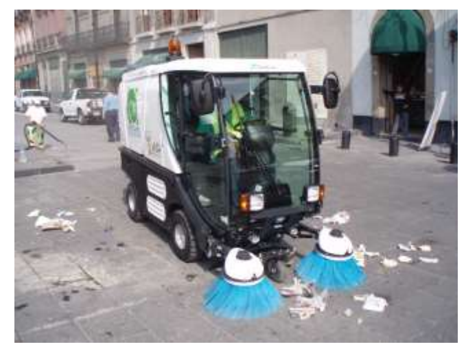
Streetsweeper CN100 Sinder - Street sweeper - Wikipedia