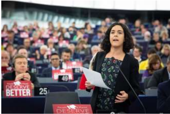
File:Strasbourg Plenary November 2019 F70A6122 (49132216507).jpg