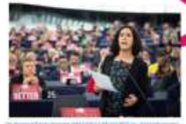
March 2024 Manon Aubry (La France insoumise) strategizes for EP elections

Stop looking at only the expenditure side of things! Let's rethink the revenue side too!