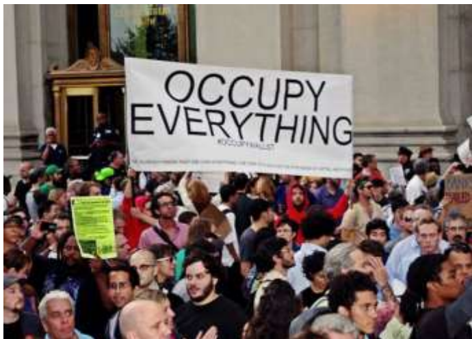
File:Day 14 Occupy Wall Street September 30 2011 Shankbone 49.JPG - Wikimedia Commons