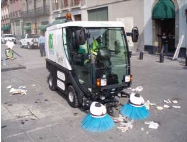
Streetsweeper CN100 Sinder - Street sweeper - Wikipedia

Dimitar Gochev waits to clean up Alexander Nevski Square in Sofia