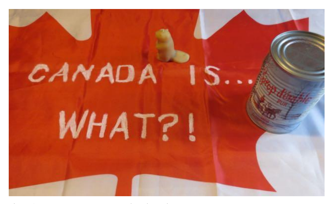
Figure 1: CANADA IS... WHAT?!

When I wrote Unbecoming Nationalism: From Commemoration to Redress in Canada , I saw it as part of a larger conversation within and with this land called Canada. So, I must admit,