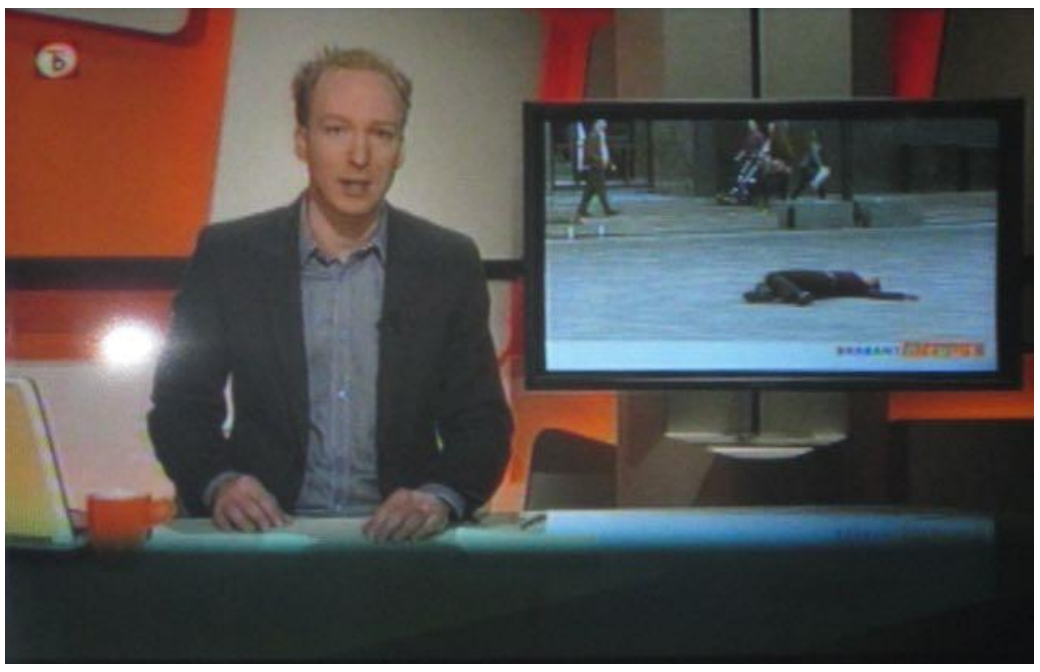
Figure 8. Impact Afghanistan War on Brabant Television.

As the result of a query by a Dutch friend, a camera crew came to film me falling in a square in Eindhoven and did a short interview that aired on Brabant Television (Figure 8). When I returned to Reusel there was a small group of family members gathered around the TV. In the past, pilgrimages to Canadian War memorials in Bergen-op-Zoom and Groesbeek had been a regular part of the itinerary arranged by my Dutch relatives when my parents, or my siblings and I visited. But, prior to this moment, I don't recall ever having a critical discussion about militarism and war with my Dutch relatives during any of our visits in the Netherlands or Canada.