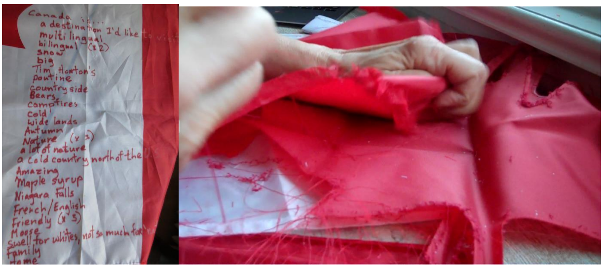
Figures 4 and 5. CANADA IS... WHAT?! responses and unraveling the Canadian flag.

While I worked on this paper, I alternated between inscribing 'CANADA IS...WHAT?!' responses onto one Canadian flag (Figure 4) and unraveling a second flag (Figure 5). As I unloosed the red and white threads of Canada's iconically friendly mascot-flag, I watched and listened to a presentation by John Immerseel titled "For a Better Life: Post-War Dutch Immigration to Canada."