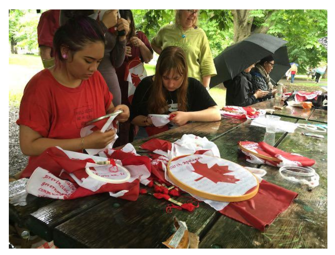
Figure 2. Stitch-by-Stitch Unsettling Canada Day Sewing Circle held in solidarity with Unsettling Canada 150 National Day of Action by Idle No More and Defenders of the Land.

Canada to add these words to the Oath of Citizenship administered to newcomers: "I will faithfully observe the laws of Canada including Treaties with Indigenous Peoples," (TRC, "Final Report" 337).<sup>2</sup>