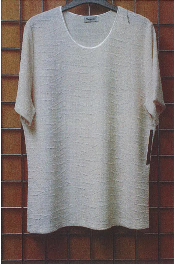
Figure 1: Response Clothing v Edinburgh Woollen Mill (defendant's wave fabric top)

Images taken from judgments available on bailii.org