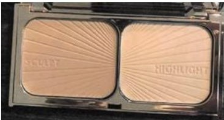
Figure 2: Islestarr v Aldi (claimant's makeup powder design)