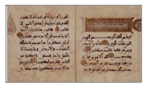
Fig. 1: Old pages of the holy Quran

-2<sup>nd</sup> book: the Hadith ( author: the Prophet Muhammad ) contains the statements of the Prophet Muhammad in different situations [13]. Muhammad was born in Mecca in the 6<sup>th</sup> century, became Prophet at the age of 40 and died at the age of 63. In this investigation, we used the Bukhari Hadith book, which is considered one of the most trusted compilation of the Hadith;