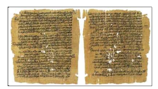
Fig. 2: Old pages of the Hadith

-2<sup>nd</sup> book: the Hadith ( author: the Prophet Muhammad ) contains the statements of the Prophet Muhammad in different situations [13]. Muhammad was born in Mecca in the 6<sup>th</sup> century, became Prophet at the age of 40 and died at the age of 63. In this investigation, we used the Bukhari Hadith book, which is considered one of the most trusted compilation of the Hadith;