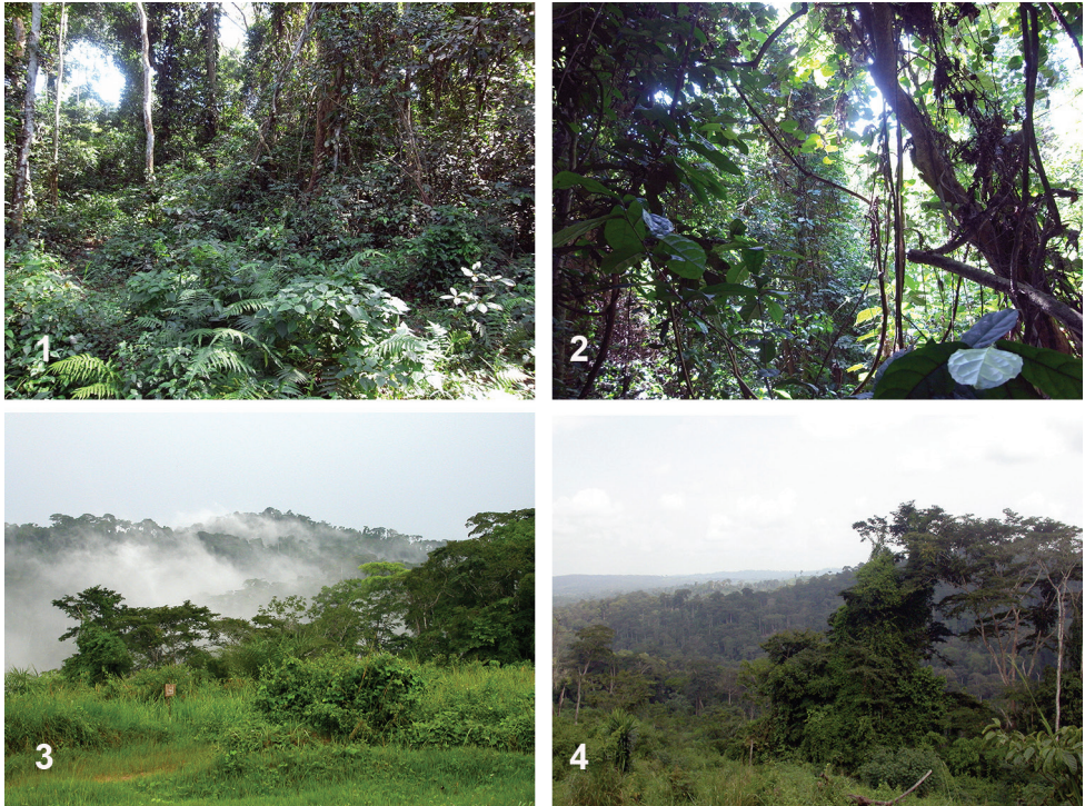
Figures 1–4. Collecting localities in Sub-Saharan Africa 1, 2 Bobiri Forest, Ashanti, Ghana 3, 4 Mayumbe Forest, Bas-Congo, Democratic Republic of the Congo.

& De Prins, 2011, known from Kenya and U. maculata (Mey, 2007), known from Namibia. However, U. falcata can be distinguished most easily by the presence of two claw-shaped cornuti, pointed apex of phallus and long ventral shield of juxta.