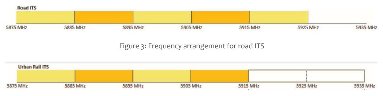
Figure 4: Frequency arrangement for urban rail ITS

The recommended frequency allocation by the document is shown on Figure 3 for Road ITS and on Figure 4 for urban rail ITS.