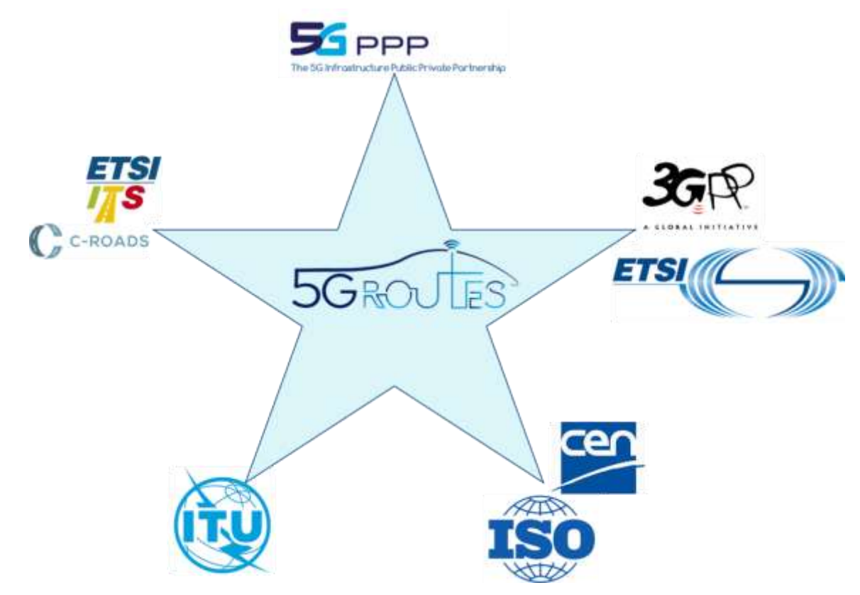
Figure 1: 5G-ROUTES relation

5G-ROUTES will have a wide area to consider for such approach, including the CAM's specialized organisations (C-ROADS, ETSI ITS), the 5G standards organisations (3GPP) and the wider communication standardisation vision uniformed at European level (5GPP).