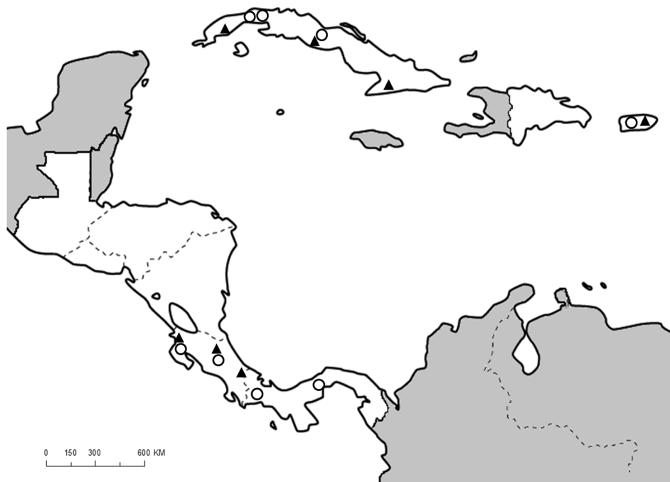
Fig. 2. Sampling sites (approximation) in Central America and the Caribbean where entomopathogenic nematodes have been isolated. ▲ = Steinernema ; ○ = Heterorhabditis .

efficacy of EPNs against white grubs and banana weevils. For example, Rodríguez et al. (2009) tested a native Heterorhabditis sp. (strain CIA-NE-07) against larvae of Phyllophaga elenans Saylor (Coleoptera: Melolonthidae). Results of this study showed that the nematodes were more effective in killing second instar larvae than third instar larvae, with an observed percent mortality of 68% vs 24%. Amador et al. (2015) assessed the virulence of Heterorhabditis atacomensis (strain CIA-NE07) against the weevil Cosmopolites sordidus Gemar (Coleoptera: Curculionidae) (Table 3). The achieved mortality of weevils was 80% at 10 days post inoculation.