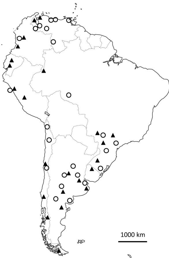
Fig. 3. Sampling sites (approximation) in South America where entomopathogenic nematodes have been isolated. ▲ = Steinernema ; ○ = Heterorhabditis .

regions. Brida et al. (2017) also isolated H. amazonensis and S. raram from soils samples of several fruit and forest crop fields (Fig. 3, supplementary).