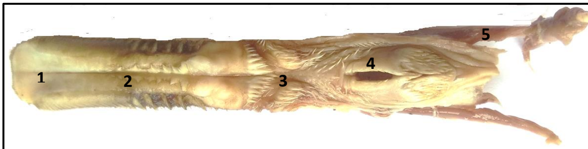
Fig. 1 Tongue of Bewick Swan