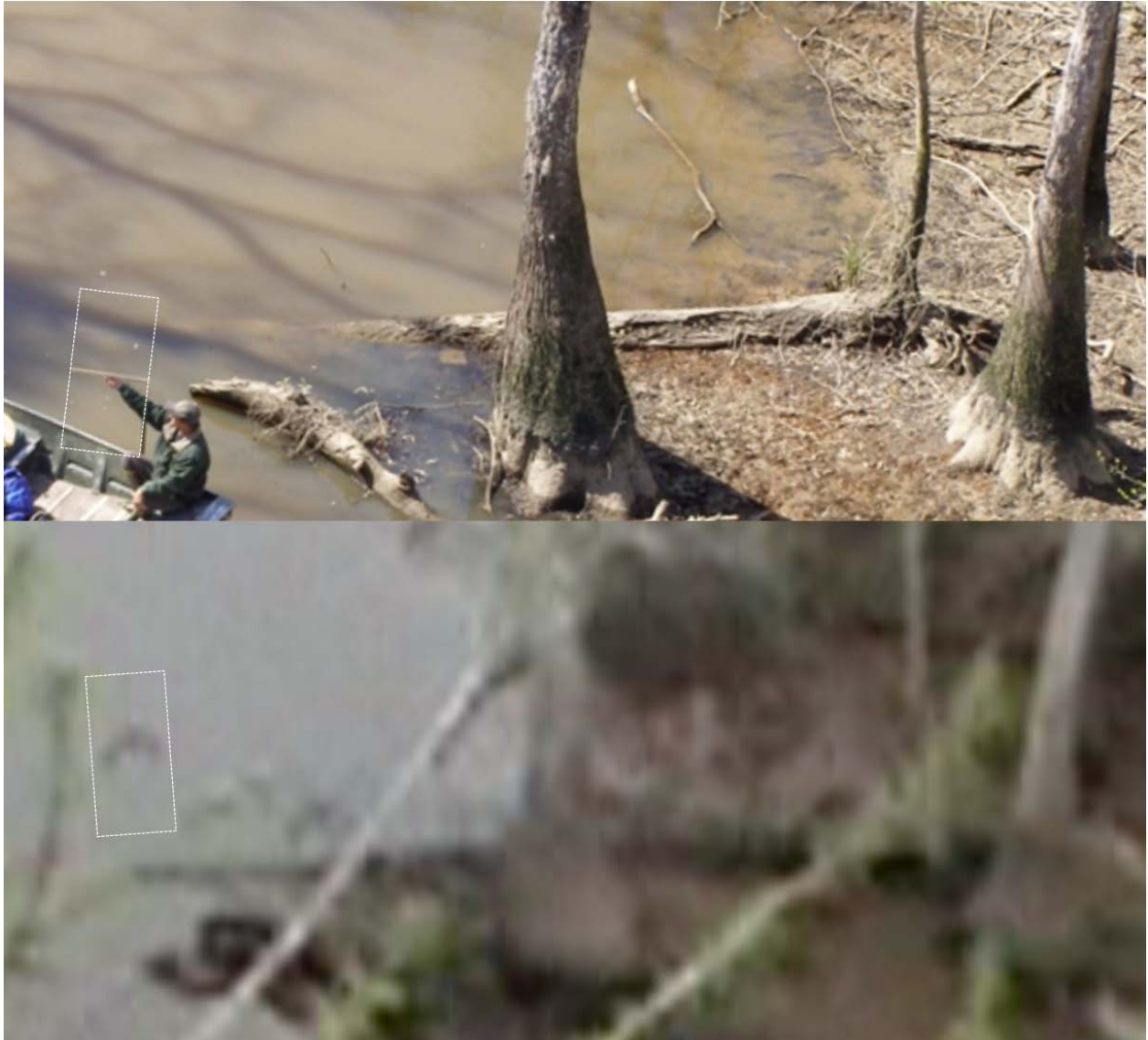
Figure 8. Top: The width of the white rectangle is the same as the length of the reference object. Bottom: The rectangle has been copied without changing its size onto an image from the video in which the wings were only partially open; this image was scaled using objects that appear in the video. Small tree branches that appear in the foreground in the lower image were removed to obtain the reference photo.