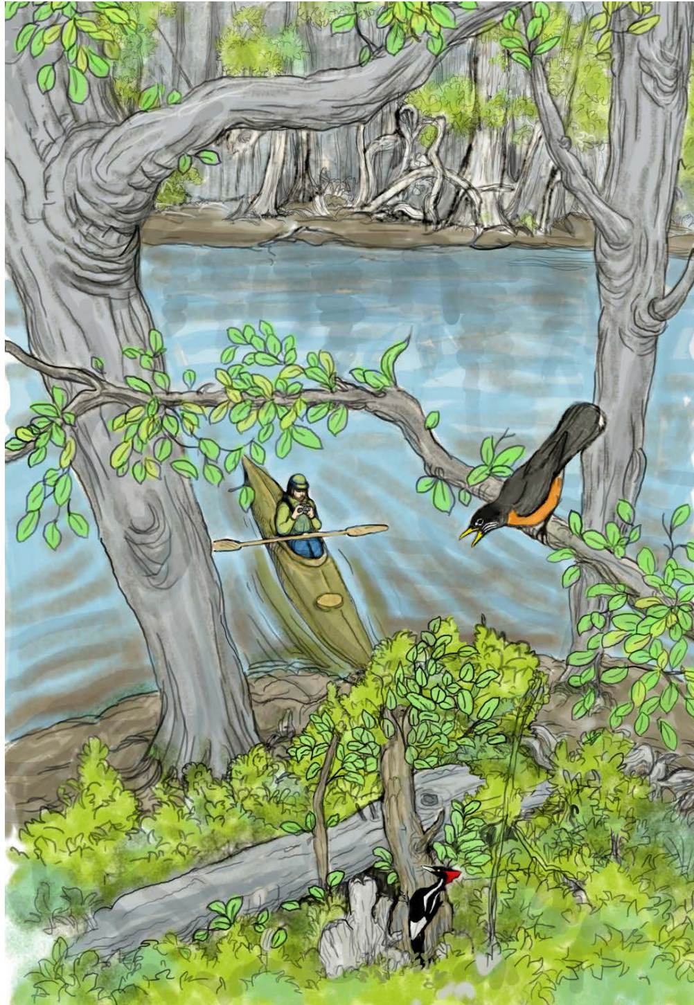
Figure 1. Artistic recreation by Michael DiGiorgio of an encounter with two Ivory-billed Woodpeckers in the Pearl River swamp [6]. Kent calls from one of the birds was coming from behind a fallen tree as I waited for it to move into view. An American Robin ( Turdus migratorius ) was scolding from above. Moments later, kent calls started coming from behind me on the opposite side of the bayou.