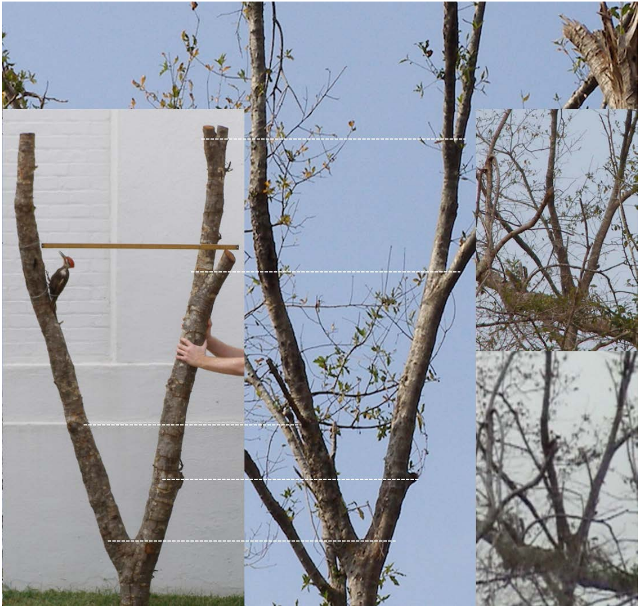
Figure 2. Comparison of the tree specimen with an image from the 2006 video and photos that were obtained shortly after the video was obtained. The photo in the center was scaled horizontally and vertically by slightly different amounts to compensate for the fact that it was obtained from a closer vantage point at an angle looking slightly upward. The dashed lines indicate forks and other features that line up.