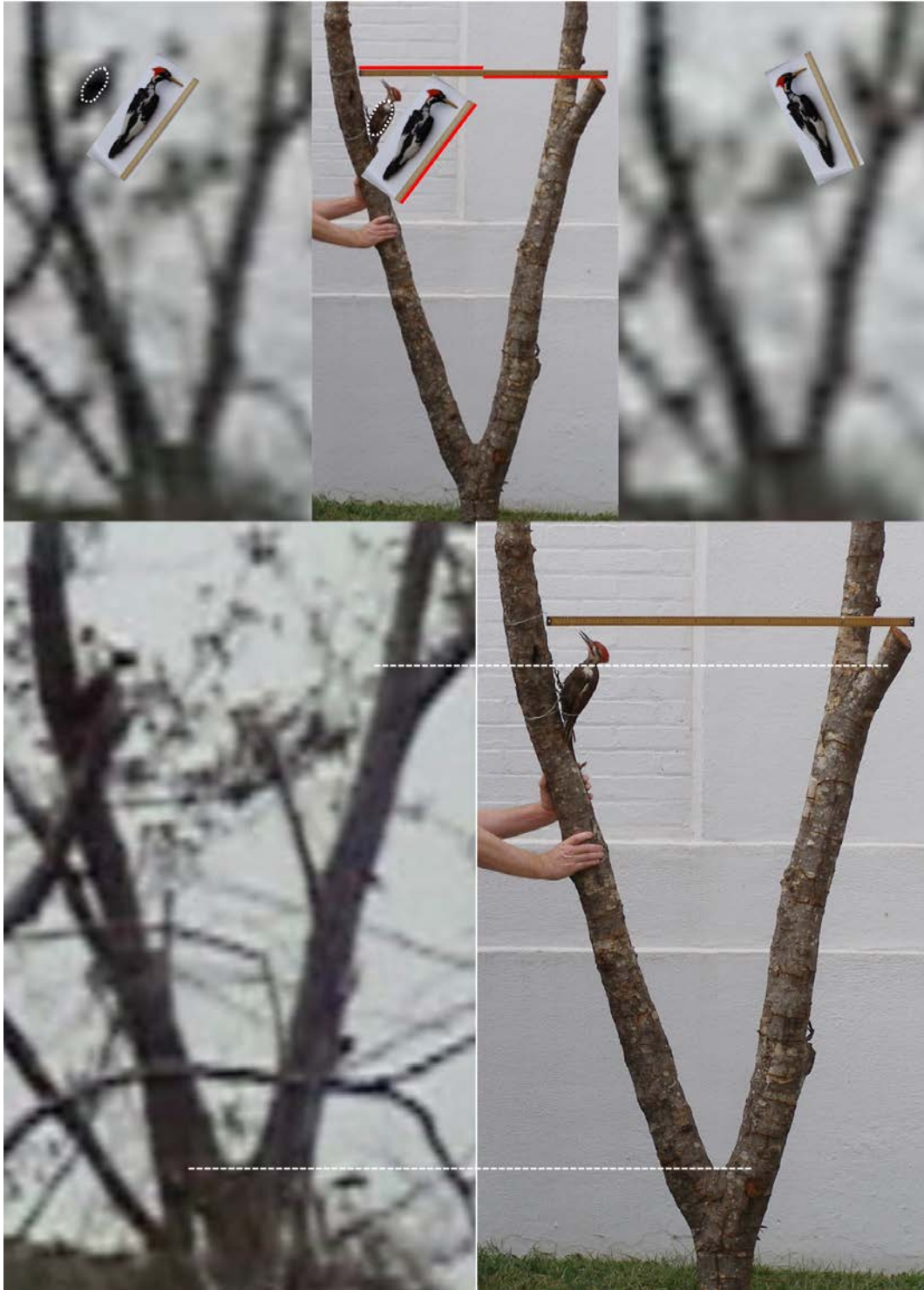
Figure 3. Comparison of the woodpecker in the 2006 video with specimens of the large woodpeckers. As indicated by the dashed lines, two forks in the tree were used to scale the images. The Pileated Woodpecker specimen was mounted on the tree specimen along with a meter stick. The Ivory-billed Woodpecker specimen was photographed with a half meter stick that was used for scaling as indicated by the red lines. The woodpecker in the video was partially hidden by vegetation in the image on the lower left, but it was in full view during a short flight between limbs (top left). The outline of the body of the Pileated Woodpecker specimen is marked by a dashed curve that was copied without changing its size.