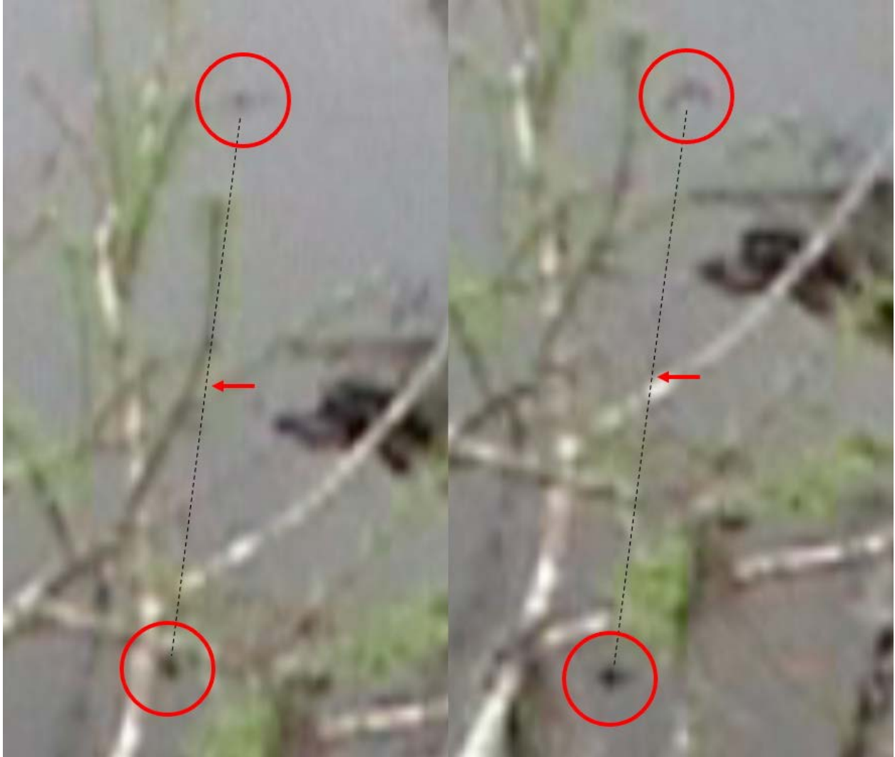
Figure 6. Frames from the 2008 that were used to estimate the wingspan. The red circles mark the locations of the bird and its reflection. The red arrows indicate the approximate locations of the projection of the bird onto the surface of the bayou. Left: The wings are fully extended but poorly resolved. Right: The wings are well resolved but only partially extended. The lines between the images are vertical, but the video camera was not held perfectly level.