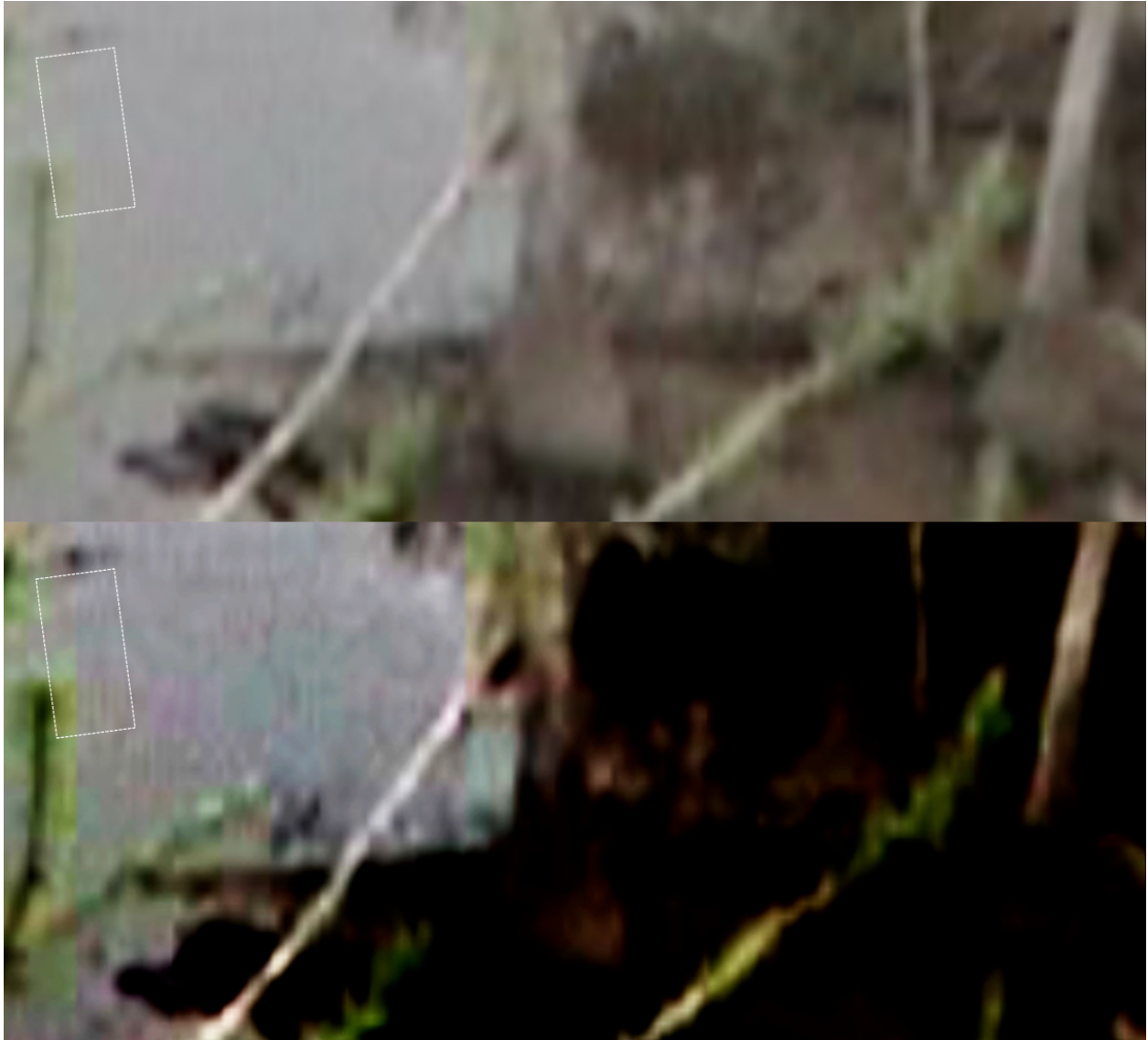
Figure 9. Top: Similar to the bottom image in Figure 8 but for a frame from the video in which the wings are nearly fully extended but poorly resolved. Bottom: It is clear that the wingspan exceeds 24 inches when the brightness and contrast are adjusted.