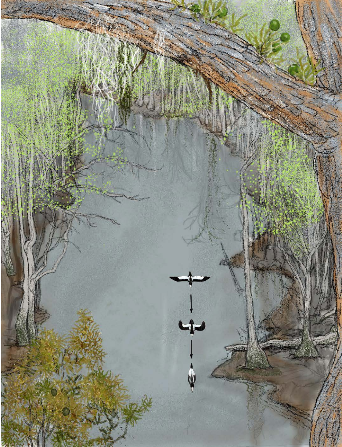
Figure 5. Illustration of the view of the flyunder that appears in the 2008 video [6]. The two white stripes on the back and the black leading edges and white trailing edges on the wings were well seen from an ideal vantage point at close range and nearly directly above. The wings were folded closed in the middle of each upstroke. This distinctive wing motion, which is well resolved in the video, is consistent with the two large woodpeckers but no other large bird (wingspan over 24 inches) of the region.