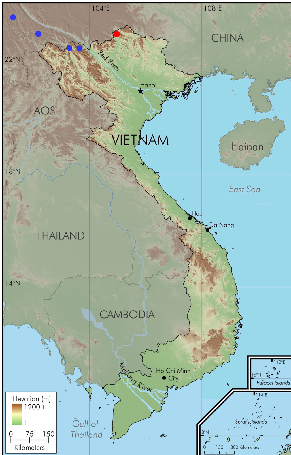
Fig. 6. Map showing distribution of Theلودerma bicolor (Bouret, 1937) (blue circles) in Lao Cai and Lai Chau provinces, Vietnam and Jingdong and Luechun counties, Yunnan Province, China (west of the Red River) and the type locality (red circle) of Theلودerma khoii sp. nov. in Ha Giang Province, Vietnam (north of the Red River).