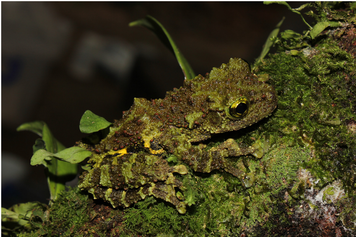
Fig. 2. Theلودerma khoii sp. nov., holotype, ♂ (VNMN 012757). Dorsolateral view, in life.

SKIN TEXTURE IN LIFE. Dorsal surface of head, dorsum, arms and legs above very rough, with large irregular glandular ridges ordered symmetrically in middle vertebral region; a large, distinct horn gland behind head in X-shape; on top of each supraorbital 3–4 enlarged glands, distinctly conical; lateral parts of body become granular; large conical tubercles on back of thighs near vent; throat and chest with some small blurred pattern; belly and ventral surface and underside of thigh with thickened flat granules or