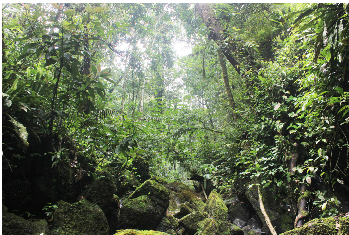
Fig. 5. Habitat of Theلودerma khoii sp. nov. at the type locality in Quan Ba District, Ha Giang Province, Northern Vietnam.

Theلودerma khoii sp. nov. appears to be closely associated with karstic environments. Specimens were found at night between 19:00 and 23:30 h near cave entrances and in valleys surrounded by limestone cliffs, about 5–6 m from water sources (Fig. 5). Advertisement calls, eggs and tadpoles of the species have not been recorded during our field surveys. The main habitat at the type locality was secondary