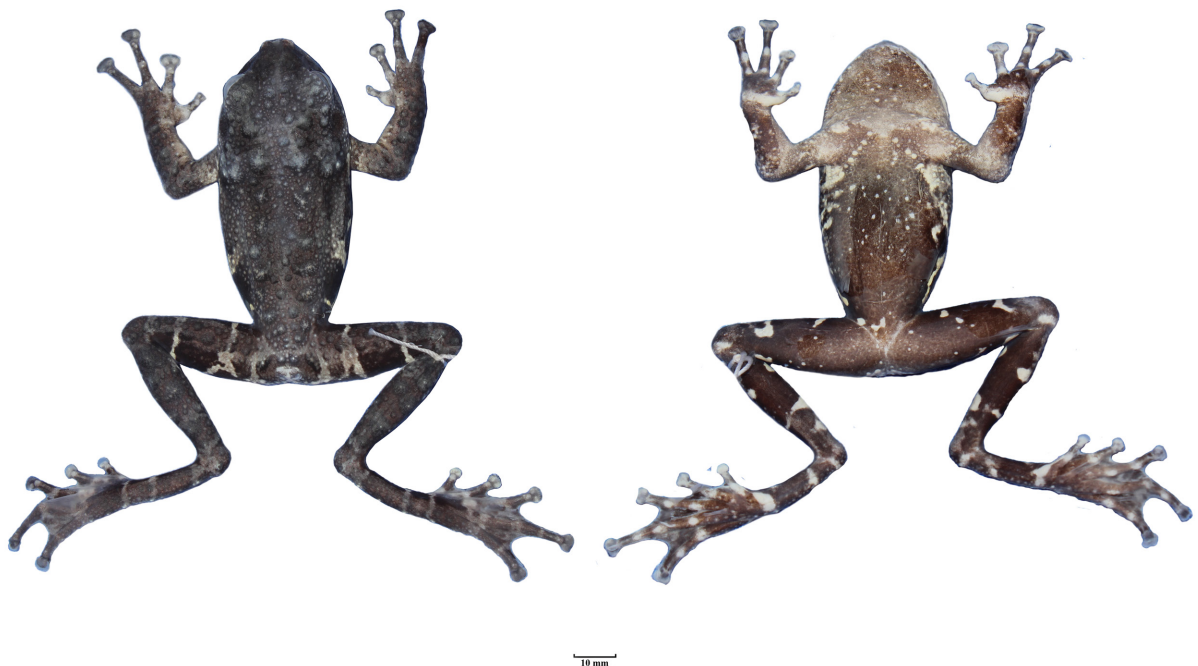
Fig. 3. Theلودerma khoii sp. nov., holotype, ♂ (VNMN 012757). Dorsal (left) and ventral view (right) during fixation.