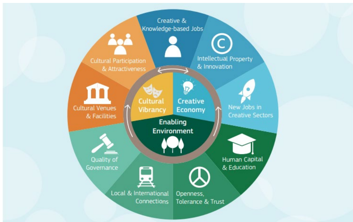
Figure 1: Cultural and Creative Cities Monitor conceptual framework