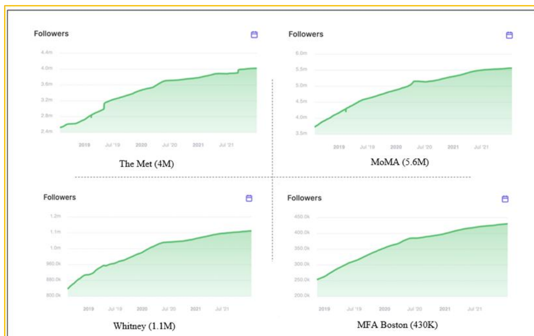
Figure 1. Increase in Instagram Followers in Museums

The paper's focus is on the motives of following social media accounts and their effectiveness in providing what the audience is looking for. This research uses survey data designed to understand the social media account usage in relation to museum visits and the survey respondents' interest in specific forms of art. We are interested in the impact of Covid-19 in museum visiting patterns as well. I have specifically focused on the museums located in the United States as English-speaking countries are taking the lead in embracing social media (Marakos, 2014). While the method used in this research has some limitations, such as not considering museums located outside the United States and the majority of survey respondents being art major *(i.e. our sample consists of 64% students, 74% of whom majoring in art or art-related topics), I believe this survey result helps explain the impact of Social Media on museum visits in a meaningful way. As it turns out, despite the recent overall popularity in social media and active usage of SNS from museums, respondents typically believe that SNS platforms are insufficient alternatives to museum visits.