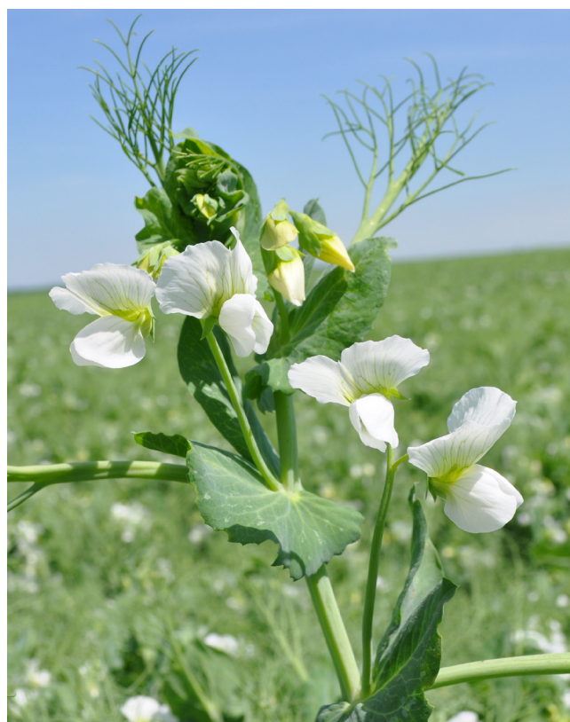
Pea flower.

Introducing the faba bean into the feed reduces feed costs under this scenario. At €240/t, faba bean is a cost-effective alternative to wheat and soybean meal because the value as a substitute for wheat and soybean meal at €268/t is higher than the actual purchase price of 240 € (including transport and processing).