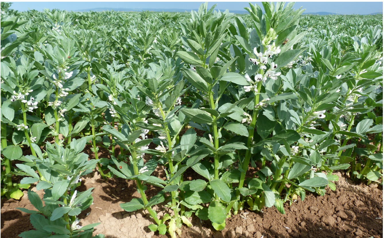
Faba bean.

What is the intrinsic economic value of grain legumes for livestock feeding? How much can be paid for grain legumes considering the cost of standard protein sources?