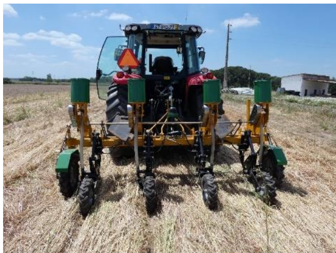
Figure 3: No-till system. Sowing into a thick mulch layer provided by a rolled-down cover crop (Basch, 2018)