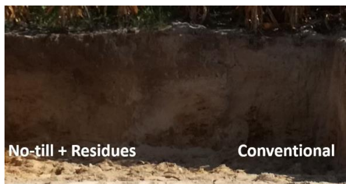
Figure 2: Differences in soil moisture due to evaporation reduction through no-till and residue cover (Basch, 2018)