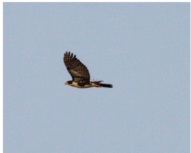
FIG. 11. — Accipiter melanoleucus temminckii (Hartlaub, 1850), Comoé-Léraba classified forest, Cascade Region, 10.II.2010.