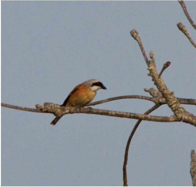
FIG. 18. — Lanius gubernator Hartlaub, 1882, Comoé-Léraba classified forest, Cascade Region, 20.III.2011.