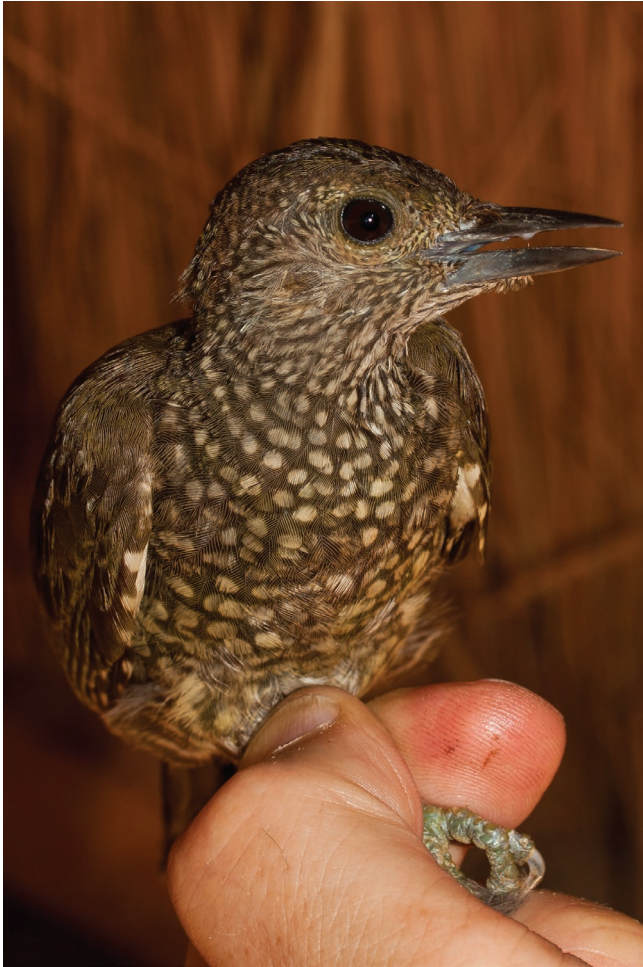
FIG. 12. — Campethera nivosa maxima Taylor, 1970, juvenile, 17.III.2011; Comoé-Léraba classified forest, Cascade Region.

(2000); Borrow & Demey (2001, 2014); Portier (2002c); Balanca et al. (2007); Sinclair & Ryan (2010); Dowsett et al. (2013).