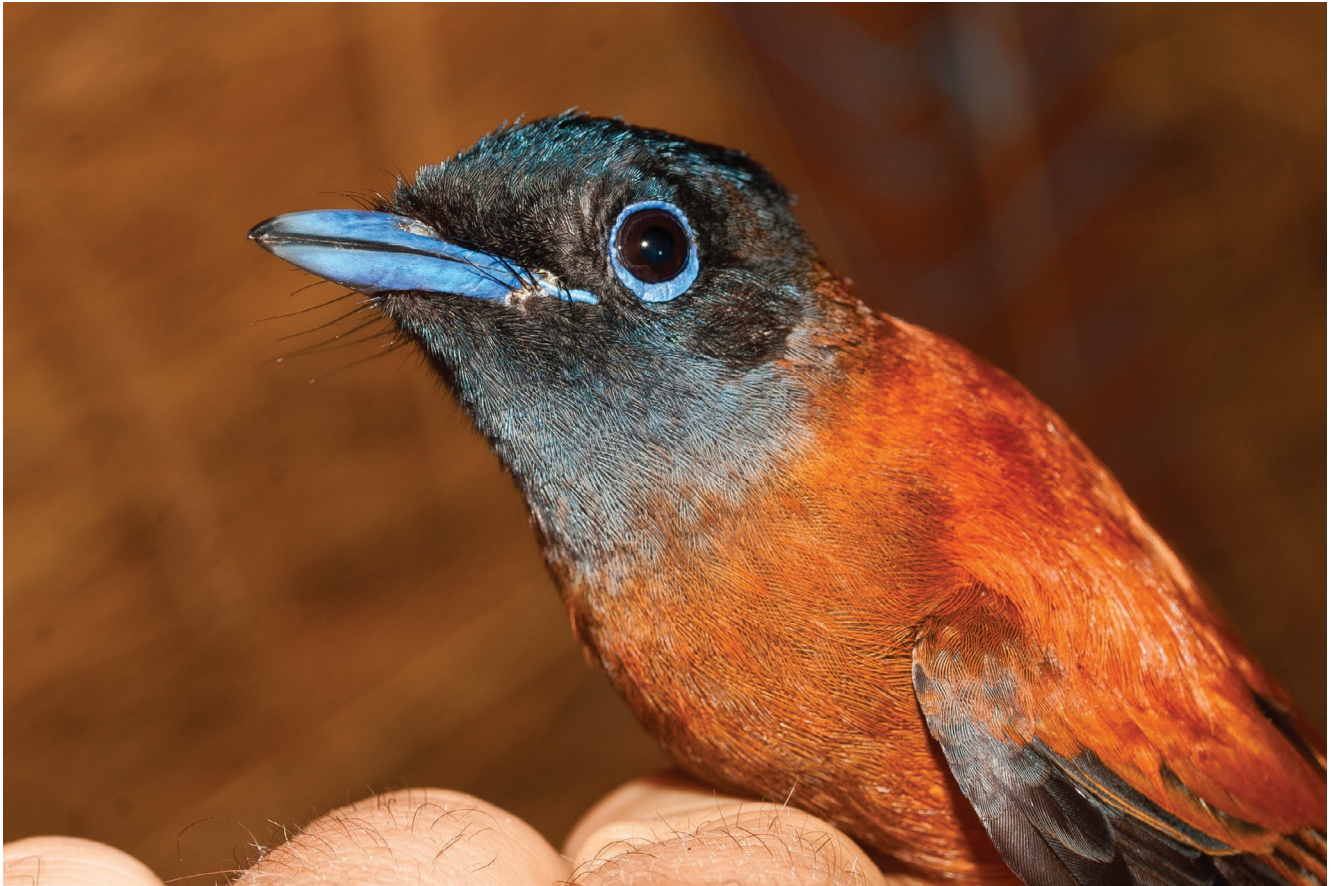
FIG. 17. — Terpsiphone rufiventer (Swainson, 1837), female, Comoé-Léraba classified forest, Cascade Region, 18.III.2011. An identical paired male was trapped but escaped from mist-nest in December 2012 near Folonzo, Cascade Region.