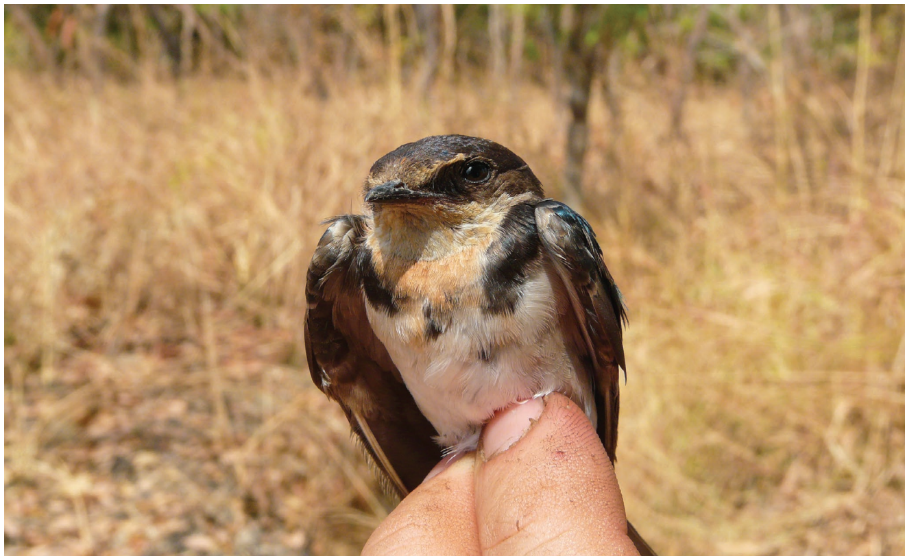
FIG. 24. — Hirundo aethiopyca aethiopyca Blanford, 1869, 10.II.2010, Folonzo, Cascade Region (photo G. Boano).