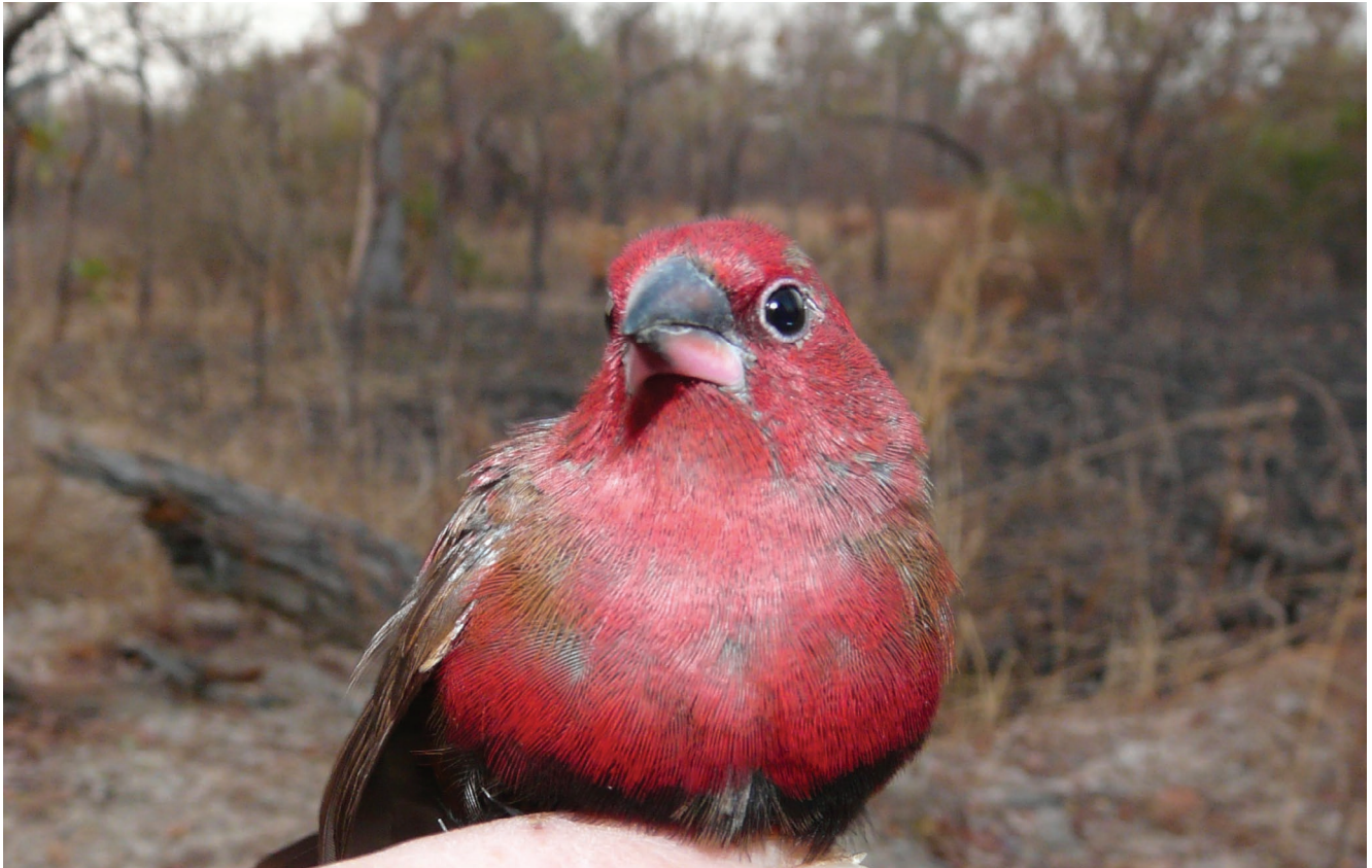
FIG. 27. — Lagonosticta rara forbesi Neumann, 1908, Folonzo, Cascade Region, 6.II.2010.

REMARK. — Previously considered conspecific with A. rubriceps Sundevall, 1850 (del Hoyo & Collar 2016) and cited with this name in the literature.