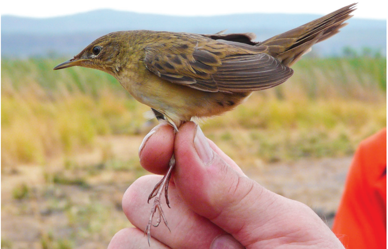
FIG. 21. — Locustella naevia (Boddaert, 1783), Lemoroudougou Lake, Banfora, Cascade Region, 13.II.2010.