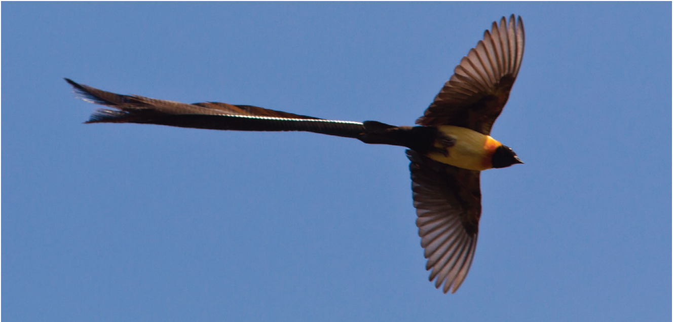
FIG. 28. — Vidua interjecta (Grote, 1822), Folonzo, Cascade Region 11.XII.2012.