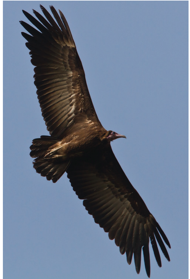
FIG. 7. — Necrosyrtes monachus (Temminck, 1823), Ouagadougou, 18.XII.2012.