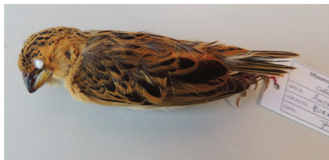
FIG. 29. — Anomalospiza imberbis butleri W. L. Sclater & Mackworth-Præd, 1918, juvenile, Folonzo, Cascade Region, 7.XII.2012.