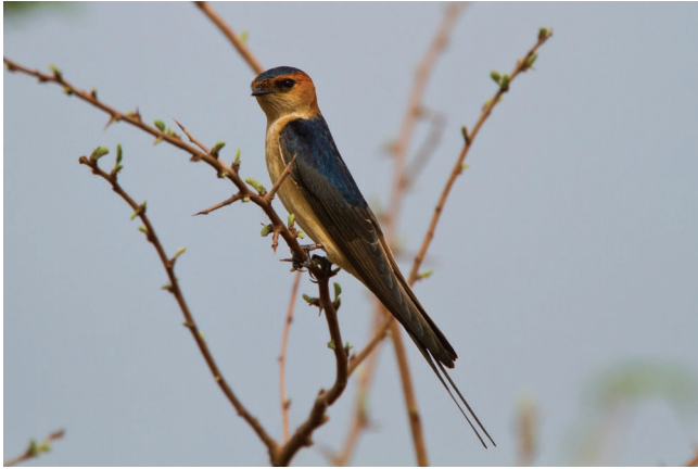
FIG. 22. — Cecropis daurica rufula (Temminck, 1835), Karfiguela Falls, Banfora, Cascade Region, 14.III.2011.