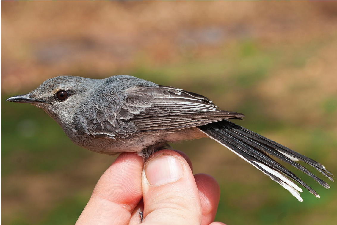
FIG. 25. — Fraseria plumbea plumbea (Hartlaub, 1858), Comoé-Léraba classified forest, Cascade Region, 18.III.2011, 9.III.2011.