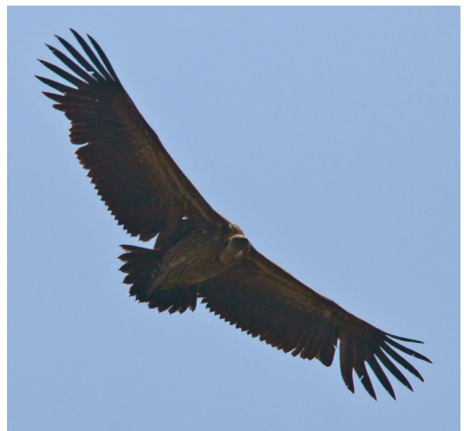
FIG. 9. — Gyps rueppelli rueppelli (A. E. Brehm, 1852) juvenile, Folonzo, Cascade Region, 10.II.2010.