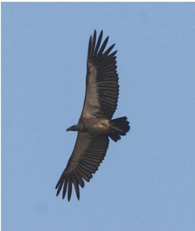
FIG. 8. — Gyps africanus Salvadori, 1865, Folonzo, Cascade Region, 10.II.2010. Relatively abundant up to the last century, many vultures are now classified as Critically Endangered.