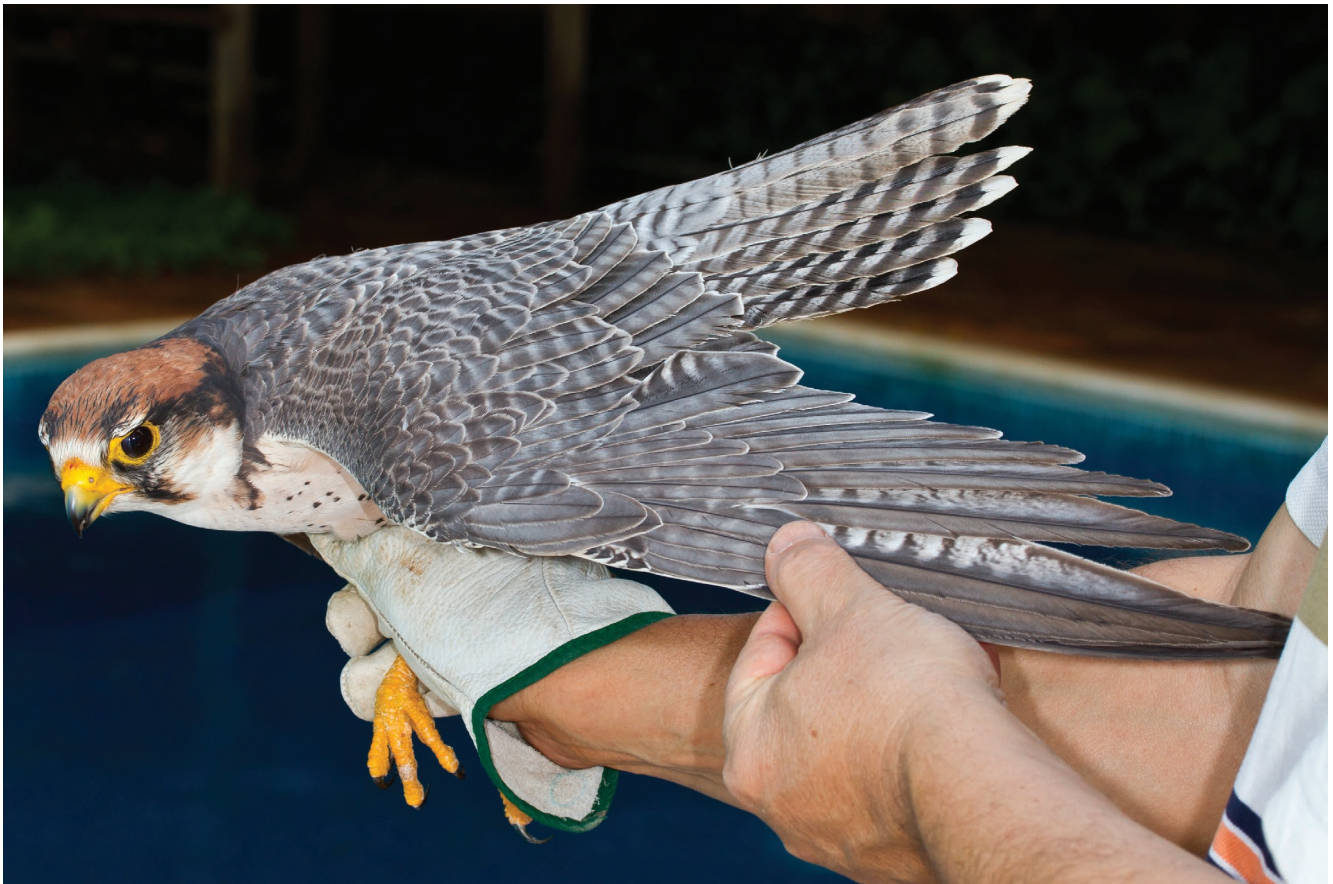
FIG. 14. – Falco biarmicus abyssinicus Neumann, 1904, adult male, Banfora, 30.XI.2012.