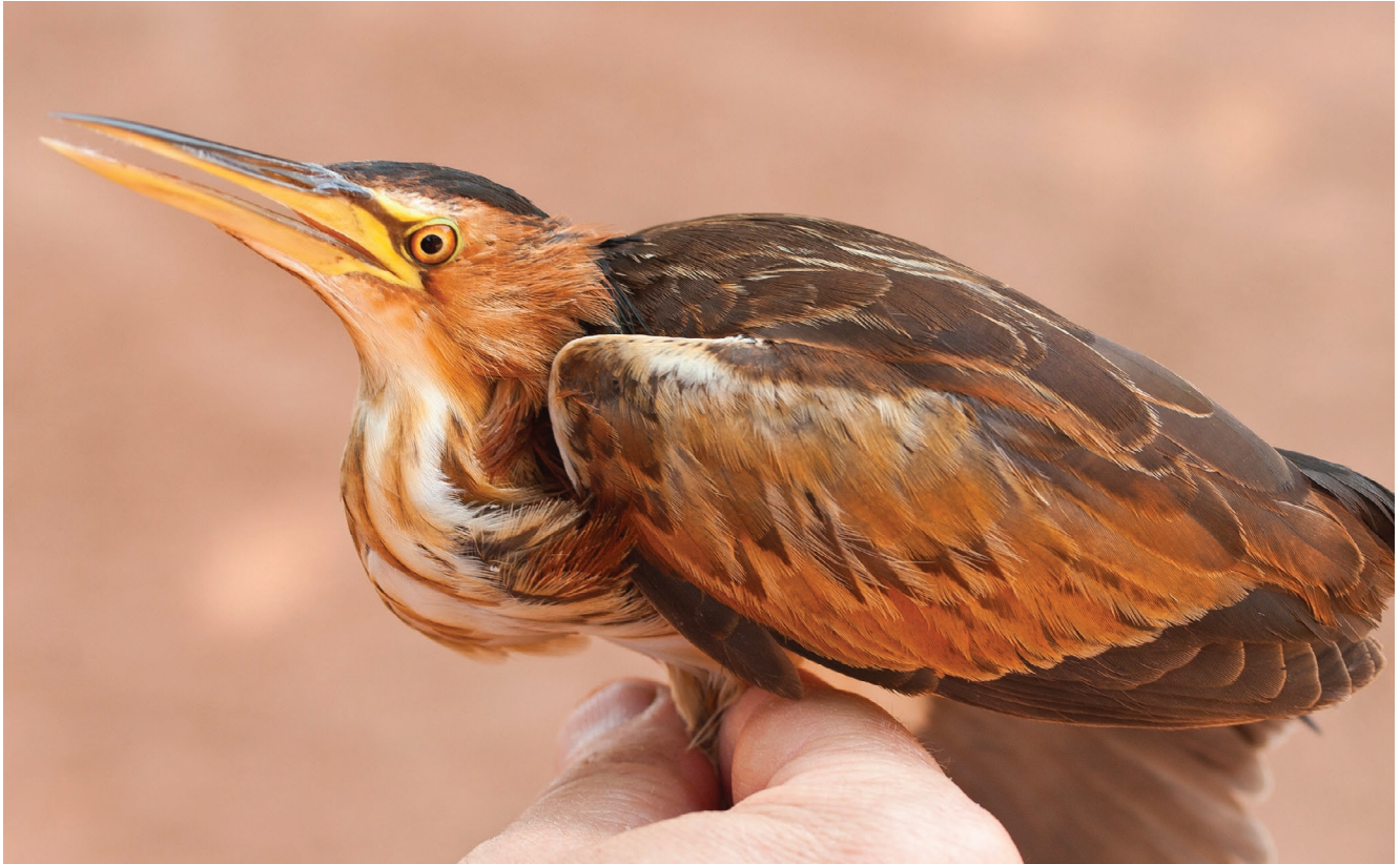
FIG. 4. — The resident population of Ixobrychus minutus (Linnaeus, 1766), pertains to the well separated subspecies I. m. payesii Hartlaub, 1858, Lemorodougou Lake, Banfora, Cascade Region, 18.II.2010.