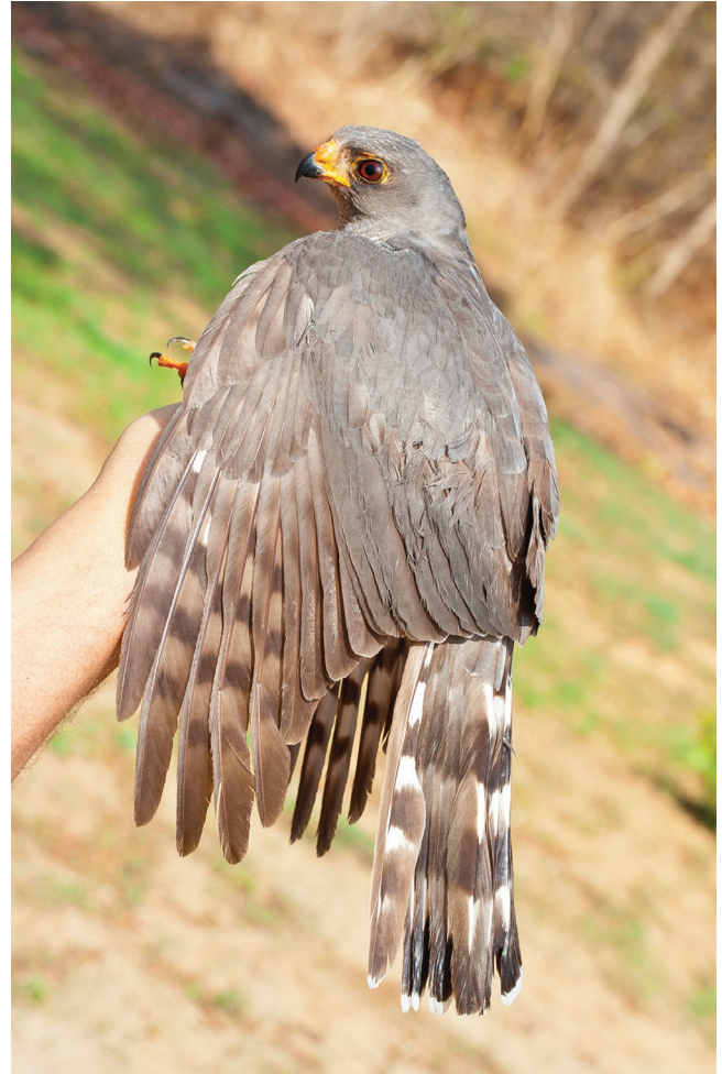
FIG. 10. — Accipiter ovampensis Gurney, Sr., 1875, Comoé-Léraba classified forest, Cascade Region, 18.III.2011.