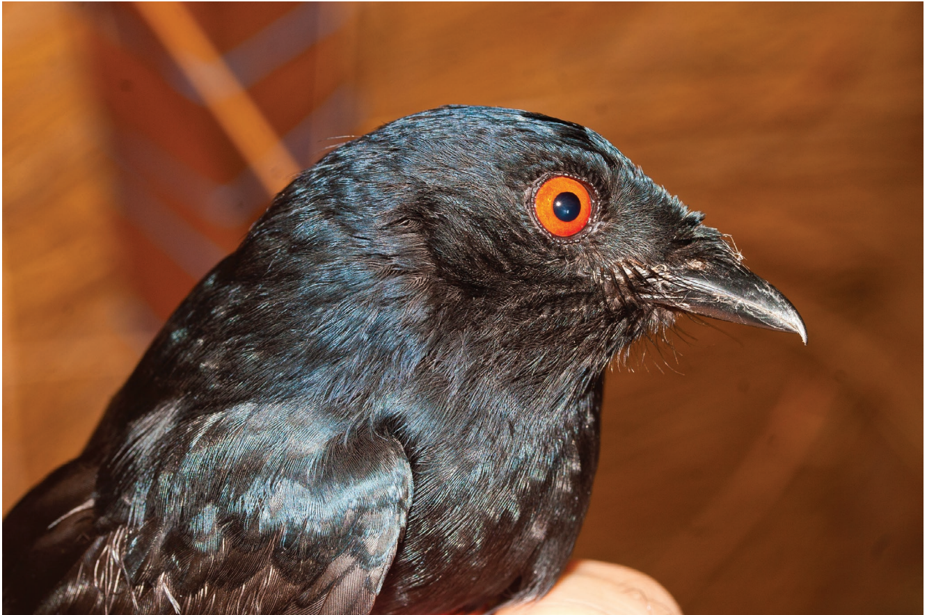
FIG. 16. — Following the taxonomic revision of the Squared-tailed Drongo species complex (Fuchs et al. 2018), the population in southern Burkina Faso is now attributed to Dicrurus occidentalis Fuchs, Douno, Bowie & Fjeldså, 2018. The portrayed specimen from Comoé-Léraba classified forest, Cascade Region, 18.III.2011 was sequenced and included in the sample of the original description.