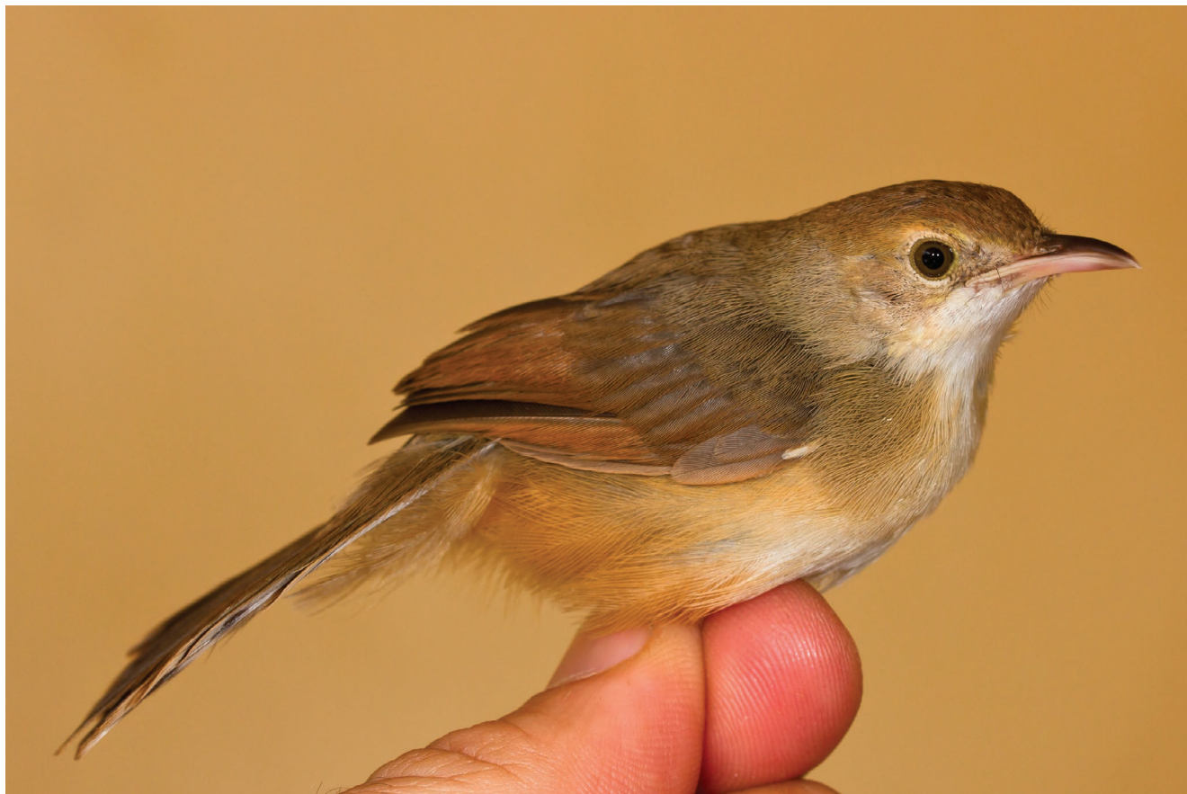
FIG. 20. — Cisticola guinea Lynes, 1930, Folonzo, Comoé-Léraba classified forest, Cascade Region, 11.XII.2012.