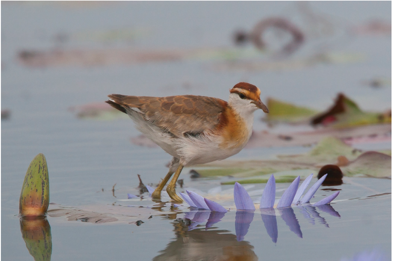
FIG. 5. — Microparra capensis (A. Smith, 1839), Tengrela Lake, Cascade Region, 14.II.2010.