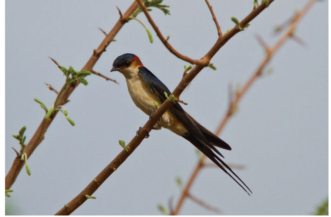
FIG. 23. — Cecropis daurica domicella (Heuglin, 1869), Karfiguela Falls, Banfora, Cascade Region, 14.III.2011.

LITERATURE. — Green & Sayer (1979); Thonnérieux et al. (1989); Dowsett (1993); Borrow & Demey (2001, 2014); Portier (2002c);