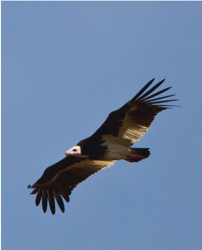
FIG. 6. — Trigoiceps occipitalis Burchell, 1824, Folonzo, Cascade Region, 9.XII.2012.