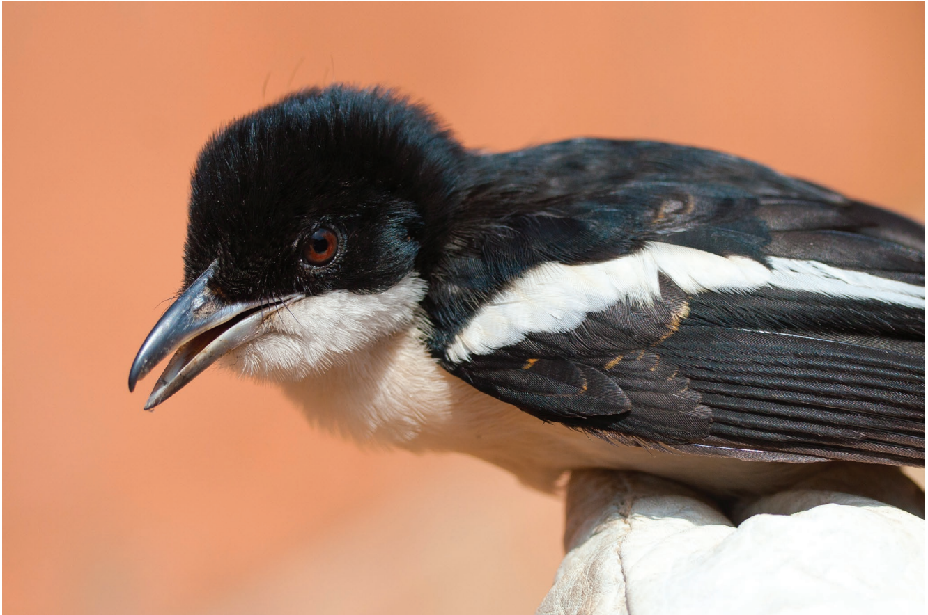
FIG. 15. — Laniarius aethiopicus major (Hartlaub, 1848), 10.II.2010, Comoé-Léraba classified forest, Cascade Region.