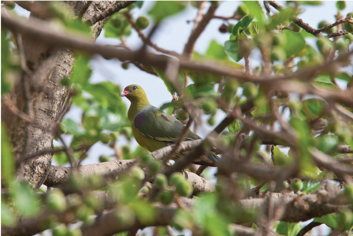
FIG. 3. — Treron calvus sharpei (Reichenow, 1902), Folonzo, Cascade Region, 6.II.2010.