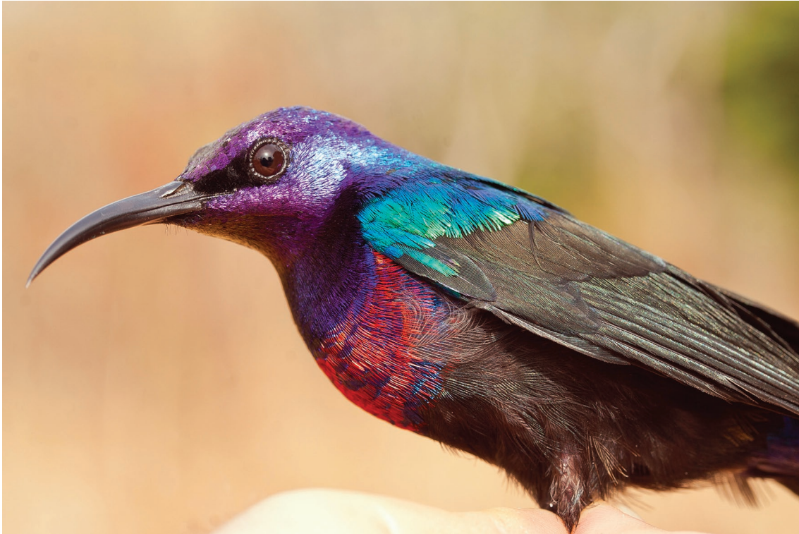
FIG. 26. — Cinnyris coccinigastrus (Latham, 1801), Comoé-Léraba classified forest, Cascade Region, 20.III.2011.