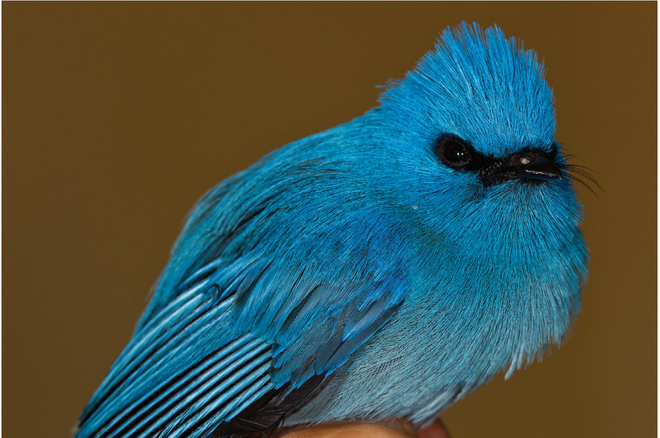
FIG. 19. — Elminia longicauda longicauda (Swainson, 1838), Folonzo, Cascade Region, 11.XII.2012 (photo M. Pavia).