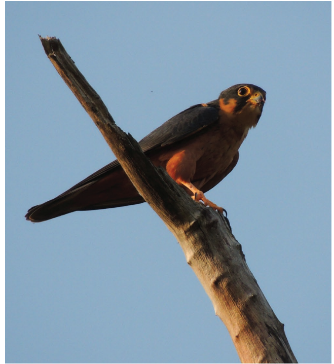
FIG. 13. – Falco cuvieri A. Smith, 1830, near Banfora 4.XII.2012.