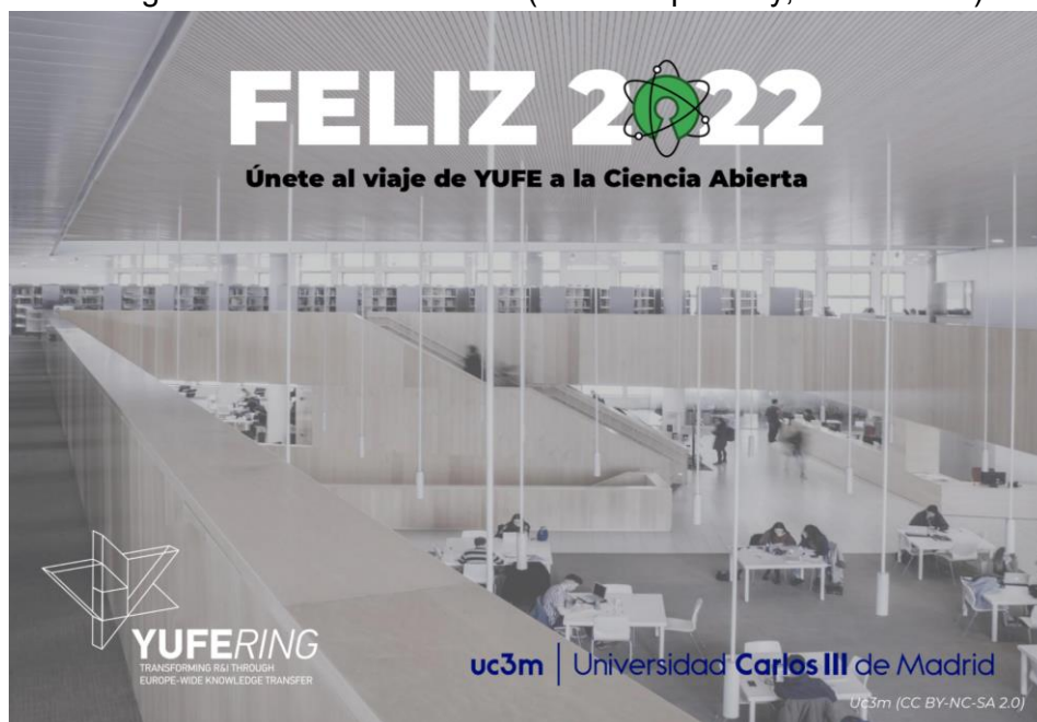
Example of our cover (Spanish version).