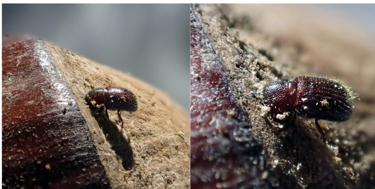
Figure 1. Penetration attempt to a hazelnut (AG5) (not video-recorded).