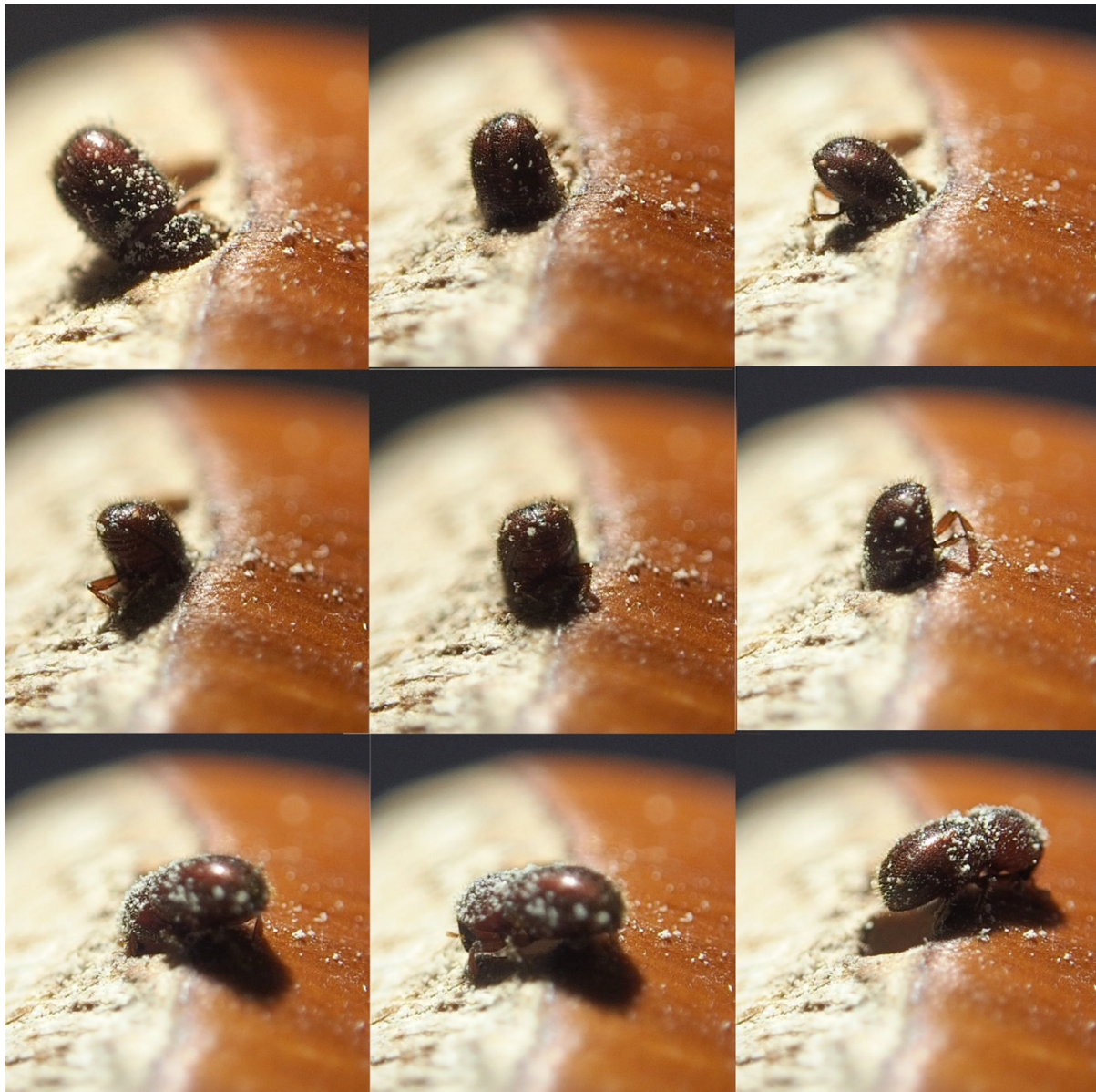
Figure 3. Abandoned penetration attempt into Corylus avellana . Stills from a video.