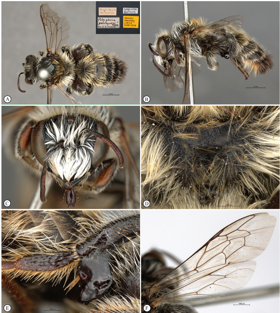
Figure 4. Non-type male specimen of Scapter peringueyi (Cockerell, 1921), stat. rev. A habitus, dorsal view B habitus, lateral view C head, frontal view D propodeum E hind leg tibia F fore wing.