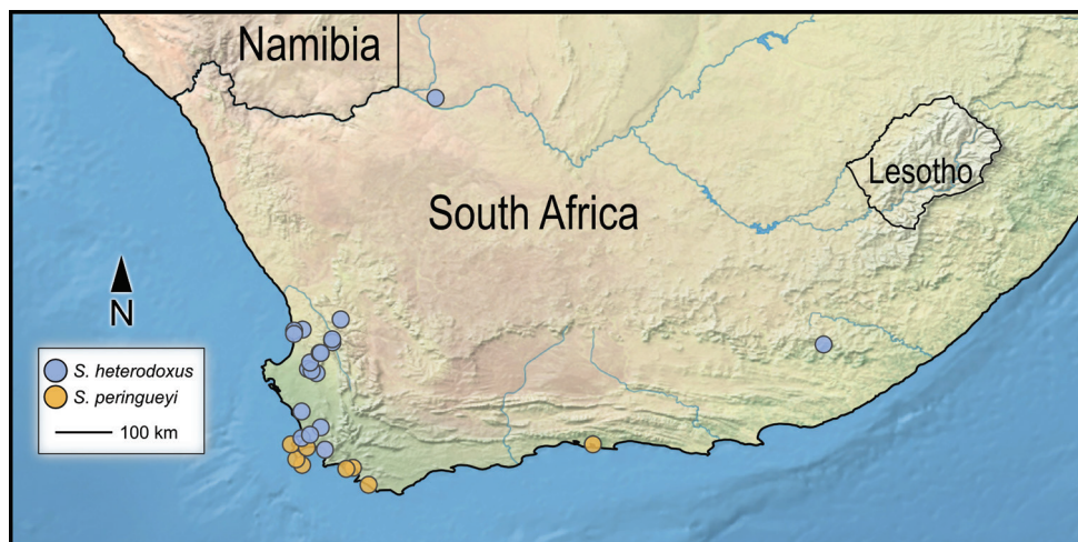
Figure 6. Distribution map of Scapter peringueyi (Cockerell, 1921) and Scapter heterodoxus (Cockerell, 1921) based on 133 examined specimens. If several specimens were collected at the same site, they are shown as a single occurrence.

Mapping the distributions of S. peringueyi and S. heterodoxus based on the 133 examined specimens reveals slightly different distribution patterns for the two species (Fig. 6). Scapter peringueyi is a southern Cape coastal species, without any records north of the Cape Town area. All localities are in close proximity to the shoreline, without any records from inland regions. Scapter heterodoxus in turn extends from Cape Town northwards up the south-western coast of South Africa, with most occurrences recorded from inland of the western coastline. The two species are sympatric in the Cape Town vicinity. Additionally, we recovered two isolated records for S. heterodoxus , one from the interior of the Eastern Cape (Katberg), and another one from Kakamas in the interior Northern Cape region. These records are particularly interesting as they significantly expand the distributional range of S. heterodoxus , but they also warrant further study: the surface sculpturing of these two specimens is slightly less rugulose than in the females from the Cape Town region, which is where the type locality is located. Additional study of specimens from the interior Northern and Eastern Cape regions is required to determine the degree of variation of this propodeal character and could possibly reveal additional, yet to be described species of the S. heterodoxus species group.