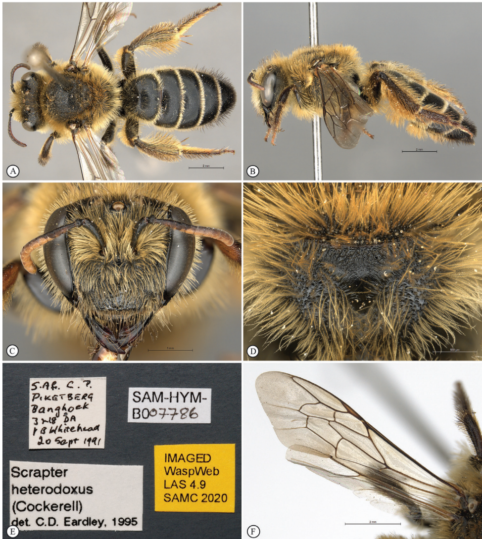
Figure 2. Female non-type specimen of Scapter heterodoxus (Cockerell, 1921), (SAM-HYM-B007786). A habitus, dorsal view B habitus, lateral view C head, frontal view D propodeum E labels F fore wing.

water, -32.9167 , 18.7 , 5 September 1990, leg. V. B. Whitehead, 1♀, SAMC, cat. no. SAM-HYM-B007784. Cape Province, Piketberg, farm Hartbeesrivier, Kapteinskloof, -32.875 , 18.625 , 23 August 1991, leg. V. B. Whitehead, 1♂, SAMC, cat. no. SAM-HYM-B007785. Cape Province, Piketberg, Banghoek, -32.75 , 18.6 , 20 September 1991, leg. V. B. Whitehead, 1♀, SAMC, cat. no. SAM-HYM-B007786. Cape Province, Mamre, Malmesbury Div. Cape, -33.5167 , 18.4667 , 25 August 1977, leg. V. B. Whitehead, 1♂, SAMC, cat. no. SAM-HYM-B007788. Cape Province, Joostenbergkloof, Stellenbosch, -33.7667 , 18.7667 , 14 August 1988, leg. V. B. Whitehead, 3♂,