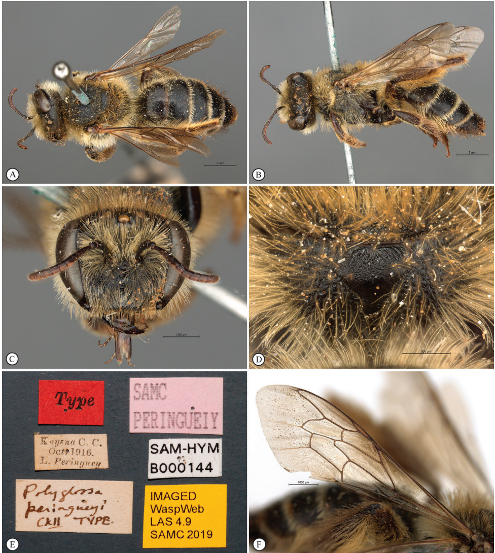
Figure 3. Female holotype of Scrapter peringueyi (Cockerell, 1921), stat. rev. (SAM-HYM-B000144). A habitus, dorsolateral view B habitus, lateral view C head, frontal view D propodeum E labels F fore wing.

(Figs 1E, 4E, 5A, 5B). It further differs from S. heterodoxus in the surface sculpturing of the basal zone of the propodeum, which is substrigulate in S. peringueyi and rugulose in S. heterodoxus (Figs 1D, 3D, 5C, 5D). The integument on the mesoscutum is shagreened between the punctuation, whereas it is polished in S. heterodoxus .