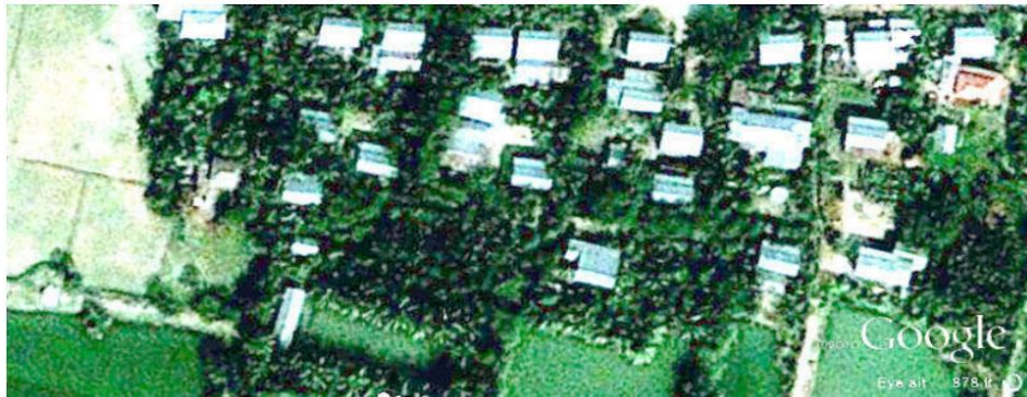
Figure 2: Top view of a Rakhain village in Patuakhali. Image: Google Earth (Source: Majid 2005)

National Census data of 2001 and 2011 did not specify what number of Rakhain peoples now lives in Bangladesh.