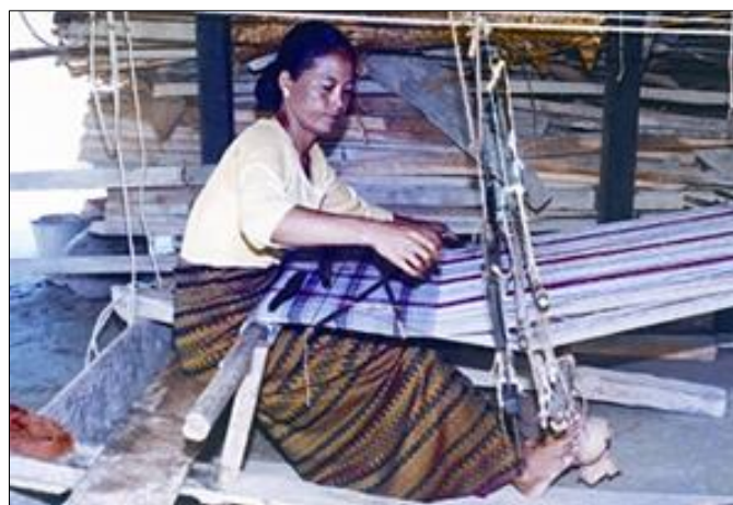
Figure 3: A Rakhain woman weaving using handloom.

Unlike the Bangali families, the Rakhain women feel more empowered. Men and women enjoy equal distribution of ancestral wealth, and after marriage, bride and groom can decide to choose whether they would live with their parents or in-laws. However, the idea of nuclear family is not very common among Rakhains. This finding is significant because in rural areas of Bangladesh, women are often deprived of their ancestral wealth; and if not wage-earners, women in most cases do not have a say in terms of family decisions. The 'Utopian Rakhain villages' are more gender neutral. However, the rate of education in the Rakhain villages is significantly low among women.