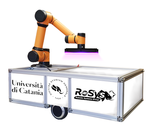
Fig. 1. The prototype of mobile manipulator developed for the testing.

for each of them and finally merge these trajectories through a backtracking policy. Taking into account the UVGI model described in [8] and the UV source's properties, a suitable coverage timing is considered to ensure the proper UV dosage for virus inactivation. The distance of the end effector to the surface is constantly monitored as well, still to ensure the proper UV exposure of the surface, by acting on the scanning velocity of the irradiation source.