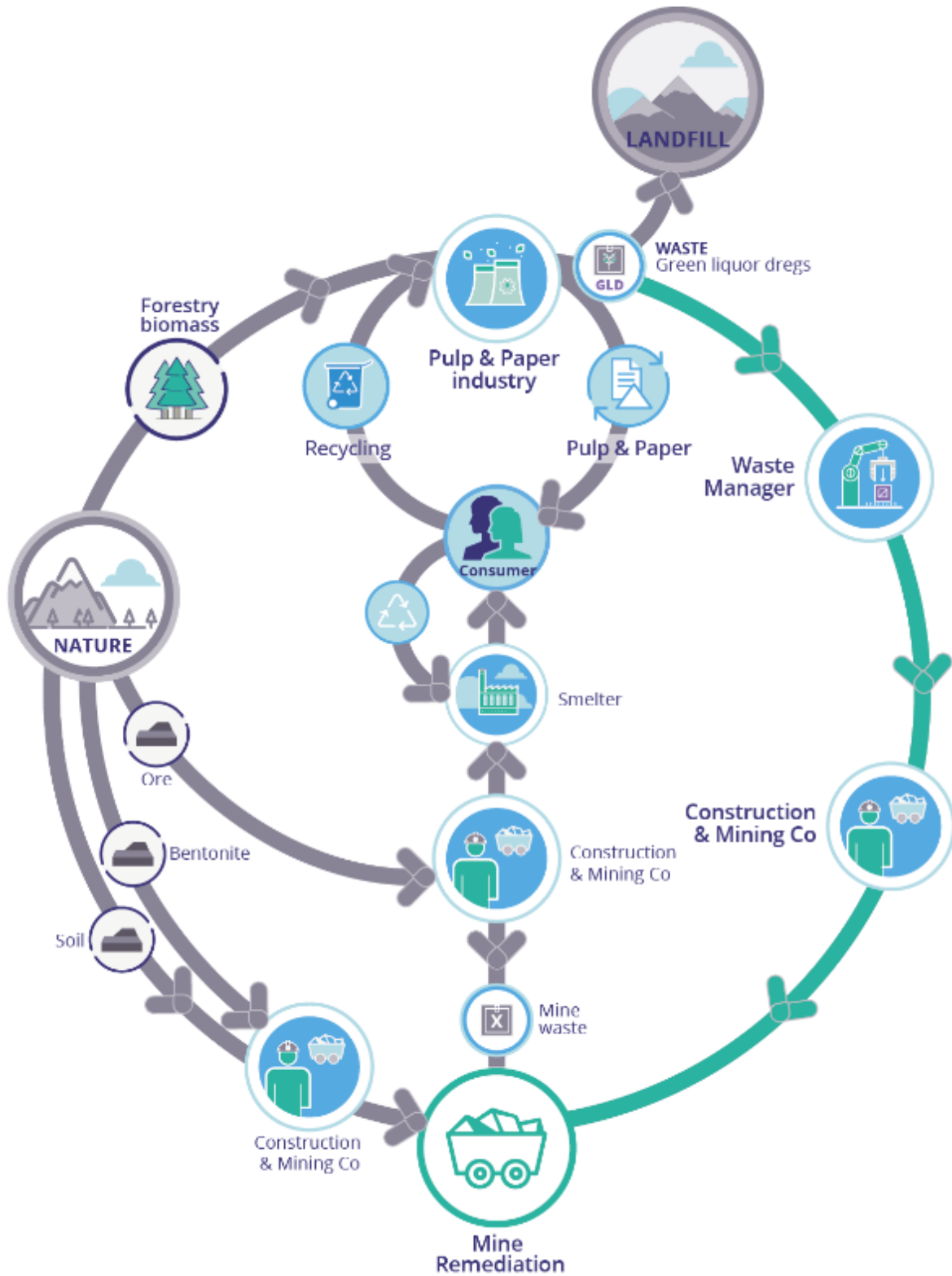
FIGURE 1 – CC5 CIRCULAR CASE (SWEDEN)– MINING WASTE COVERING LAYER WITH GLDs.