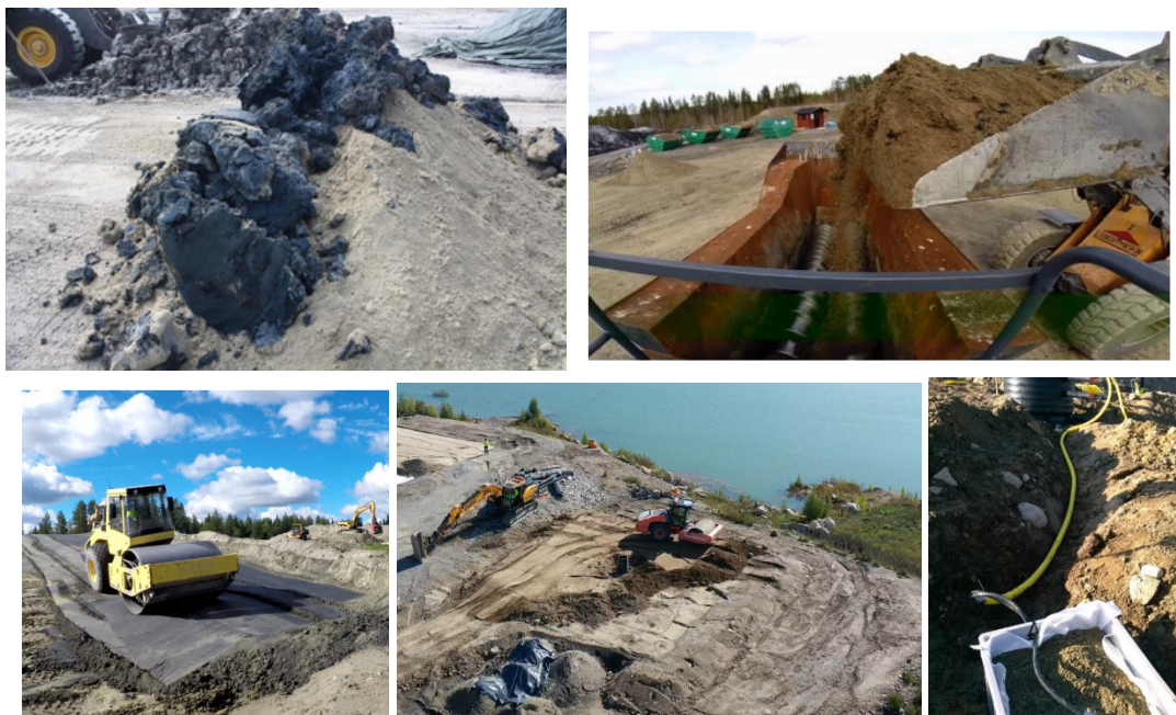
FIGURE 3 – PROCESS: MIXING AND LAYER CONSTRUCTION BASED ON GLDs AND TILL (SOIL)