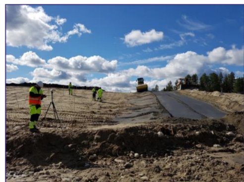
FIGURE 4 – APPLICATION: MINING RESTORATION WITH GLD BASED IMPERMEABLE LAYERS.