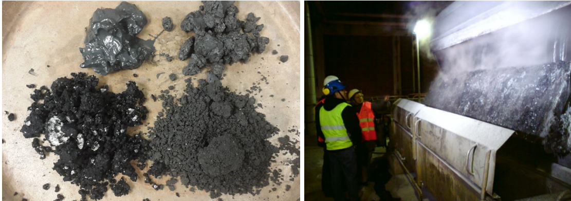
FIGURE 2 – WASTES: GREEN LIQUOR DREGS (GLDs).