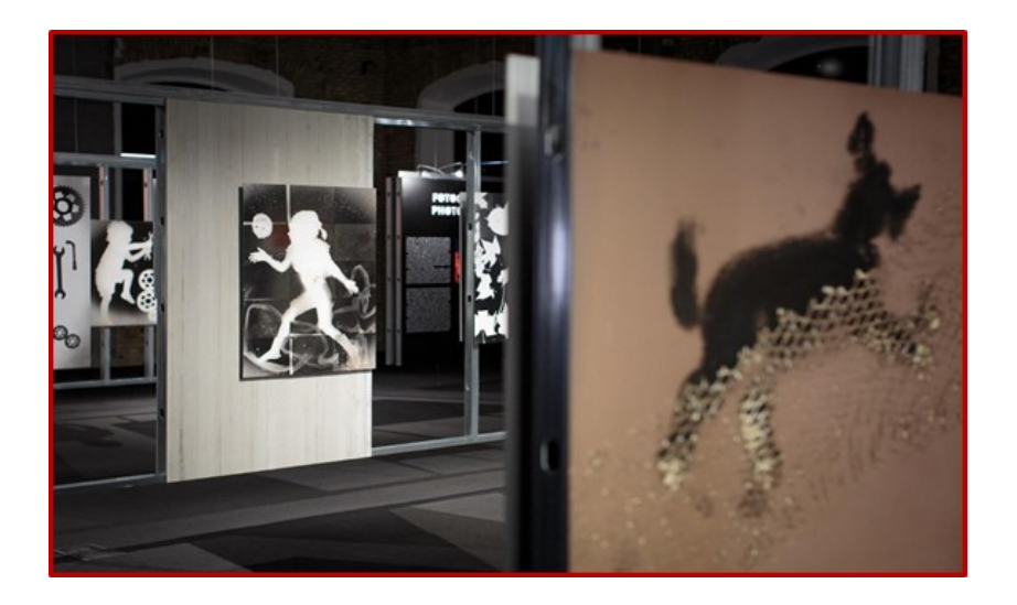
Figure 2: Nino Migliori, Tales of Light , Maxxi Museum, Rome, 2018.