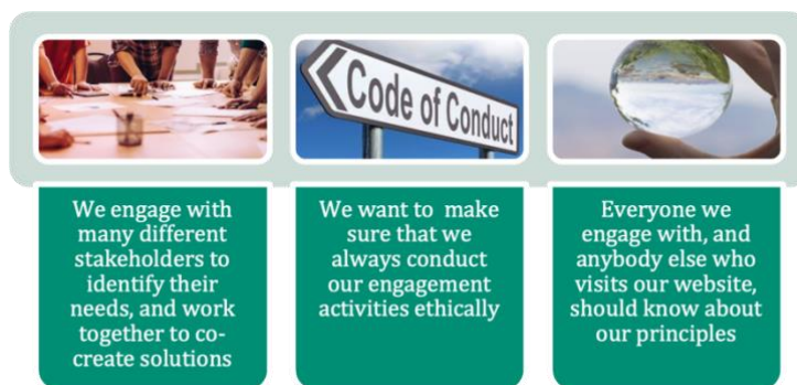
Figure 3. Stakeholder engagement – goal of WP6

The goal of WP6 is to work in an open and inclusive way, with the spirit of mutual respect and trust (Figure 3). They also explained the guiding principles and INTERACT guides for ConcePTION. In addition, they provided more information regarding the ConcePTION glossary. The glossary is designed and maintained by The European Institute for Innovation Through Health Data and RAMIT (More information at: glossary on the RAMIT website )