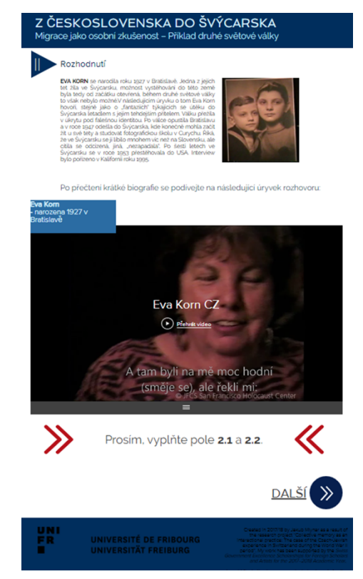
Figure 1.2: On-screen materials available to the students through a shared computer device (in Czech). This example shows page II, titled 'The Decision' ('Rozhodnutí' in Czech). The lower part of the page contains instructions to fill in fields 2.1 and 2.2.