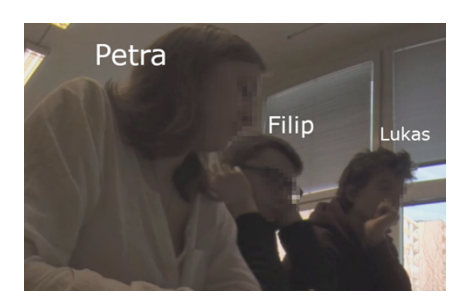
Figure 3: The group of students at work (pseudonyms are used for the members)

On the page, there were no instructions about filling in field 1.2, or any other instructions, apart from the icon '>> Next'.