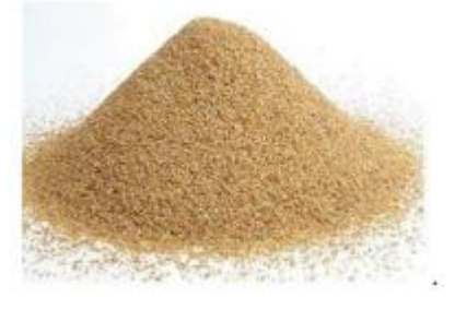
Fig.5. River sand [40]

River sand is often distinguished from gravel by grain size or particle size but is distinct from clays containing organic minerals. Sands which are filtered out and isolated from the organic material by the action of water currents or by winds across arid lands are usually very uniform in grain size. Commercial sand is typically collected from riverbeds or originally produced by the action of winds from sand dunes. Most of the earth's surface is sandy, and the sand is usually quartz and other silica products, a sample of river sand often used for building construction is shown in figure 5 below.