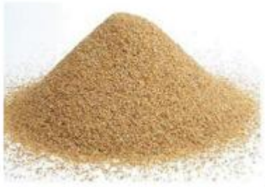
Fig.5. River sand [40]

River sand is often distinguished from gravel by grain size or particle size but is distinct from clays containing organic minerals. Sands which are filtered out and isolated from the organic material by the action of water currents or by winds across arid lands are usually very uniform in grain size. Commercial sand is typically collected from riverbeds or originally produced by the action of winds from sand dunes. Most of the earth's surface is sandy, and the sand is usually quartz and other silica products, a sample of river sand often used for building construction is shown in figure 5 below.