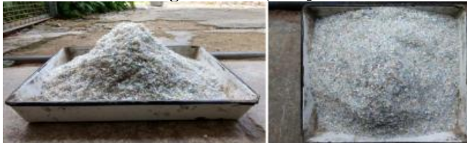
Fig.2. PET wastes (shredded) [23]