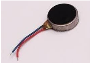
Fig. 3. Vibration Motor.

VIBRATION MOTOR--- Vibration motor have been around 1960s. In 1990's people were needed the vibra-call in their cell phones that is the reason they were invented the vibration motor. Especially, Pan cake vibration motors are the widely used ones as they are compact and trouble free. This type of motors are easy to be suited into all kind of system as they need exterior moving parts. It also have sticking support that would be possible to be easily fixed to any surface. They have interior H-circuitry. Here it is present as a means to alert the person ready for if the ultrasonic sensor has predicted an object within a specific distance.