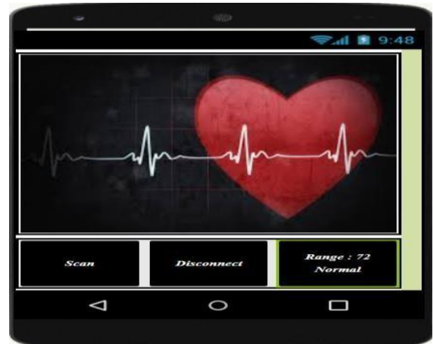
Fig.10. shows the heartbeat rate of the sole.

The differentsolution of the proposed model are shown below: