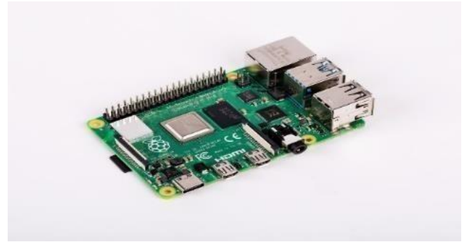
Fig. 5. RASPBERRY PI.

4. RASPBERRY PI-- Raspberry pi 3B has various benefits like it is reasonable pricebut still works as a tiny computer. It is just like a debit card and so it is movable. It makes smooth the work and it create a principles in studyingdifferent computer languages. It can be switch PCor TV as well. It can work like a hard drive because of memory card inserted in the raspberry pi. Here raspberry pi is mainly used to find out exactly