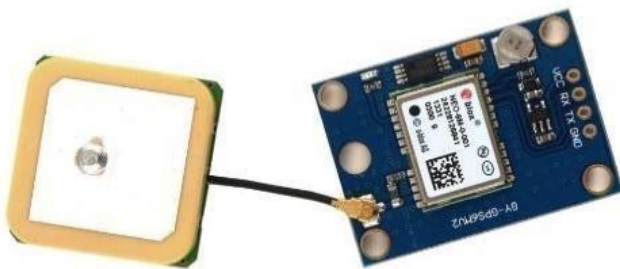
Fig. 4. GPS.

3. GLOBAL POSITIONING SYSTEMS-- Here GPS included with the aim of detecting the location of the person, such that it can be send the notification to the user's pre-decided friends or families when the person is found in any emergency conditions. It performs on the method of trigonometry. It can detect the location from the range determine to the satellites. It measures the far between the satellite and device by transmitting the location along with the satellite at the speed of light and finally ends up when the calculation has done. Thus, the exact position is obtained.