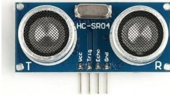
Fig. 2. Ultrasonic Sensor.

VIBRATION MOTOR--- Vibration motor have been around 1960s. In 1990's people were needed the vibra-call in their cell phones that is the reason they were invented the vibration motor. Especially, Pan cake vibration motors are the widely used ones as they are compact and trouble free. This type of motors are easy to be suited into all kind of system as they need exterior moving parts. It also have sticking support that would be possible to be easily fixed to any surface. They have interior H-circuitry. Here it is present as a means to alert the person ready for if the ultrasonic sensor has predicted an object within a specific distance.