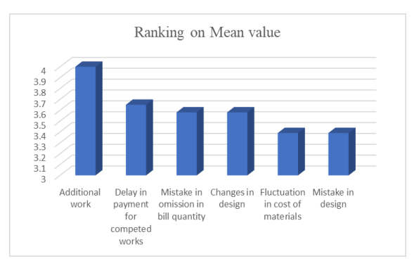
Fig 6.1 Mean value Ranking CO factors.