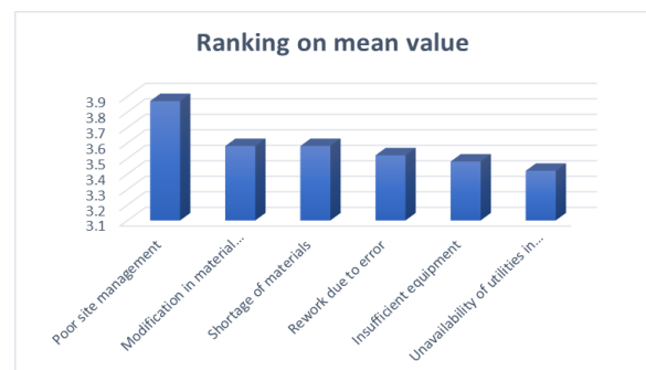
Fig 6.2 Mean value Ranking SO factors.