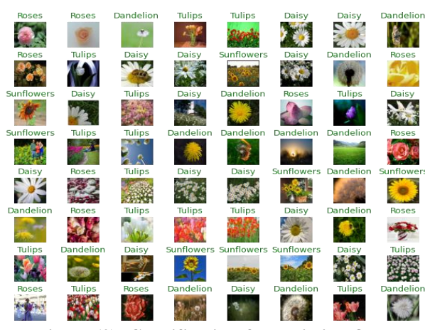
Figure (2): Classification & Prediction Output.