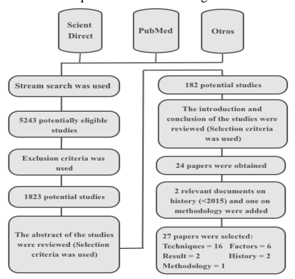
Fig. 1 Systematic literature review process.

This phase explains the development of the review process considering the databases, the search statement and the selection and exclusion criteria found in Table I. The flow chart of the search process is shown in Fig. 1.