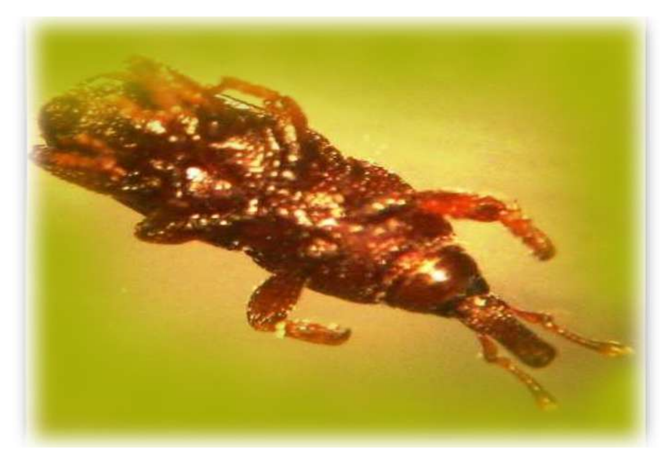
Fig. Adult Sitophilus species.