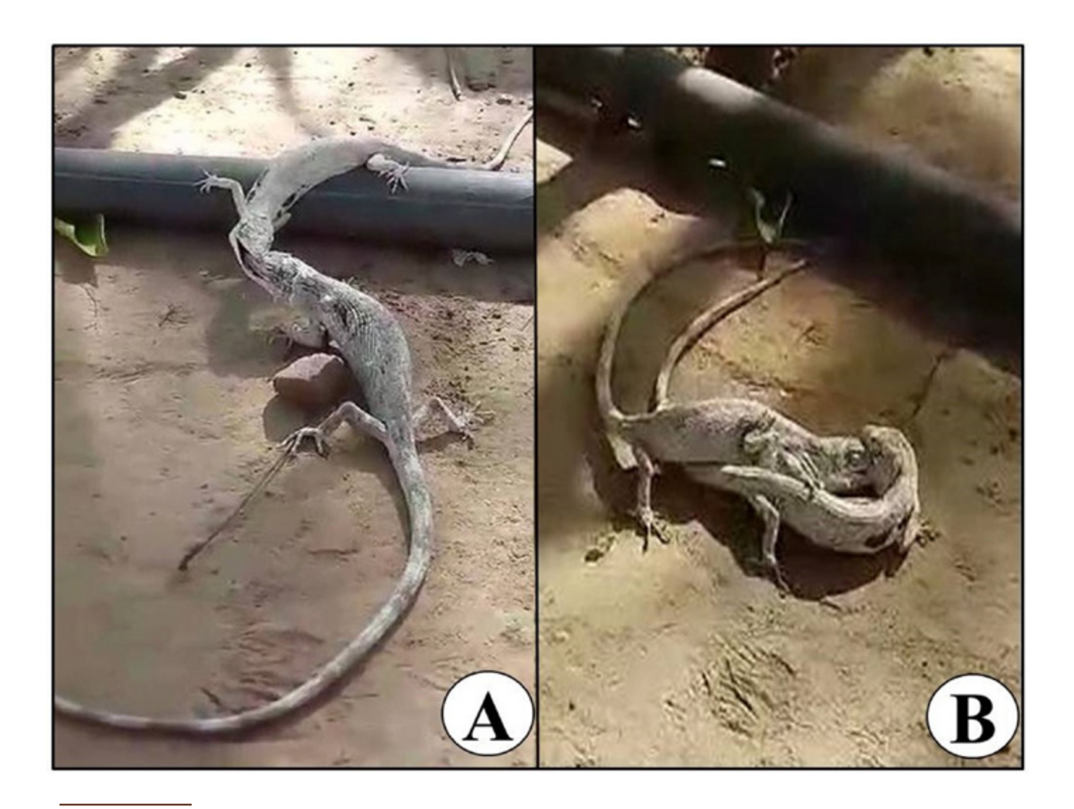
Figure 2. (A) Two adult lizards encountered each other on open ground, and one individual (top) bit the mouth of the other; (B) The attacking lizard (right) stood on the other (left) and continued to bite its mouth and head several times.