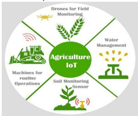
Figure 2 Smart Agriculture using IoT IV. Methods

The soil moisture technology delivers complete and entire details in-season local provision and references to improve water use smart ability. The virtual improve PRO combines technologies like weather condition, soil moisture and for water management into one most in control and most common, cloud-based, and powerful position meant for advisors and things that help plants grow to take advantage of the aids in high quality crop watering or rinsing with water via a simplified connection.