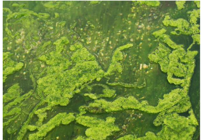
Fig. 1. Algae

Keywords: Algae, Algal dye, Eutrophication, Pollution, Printing on cloth.